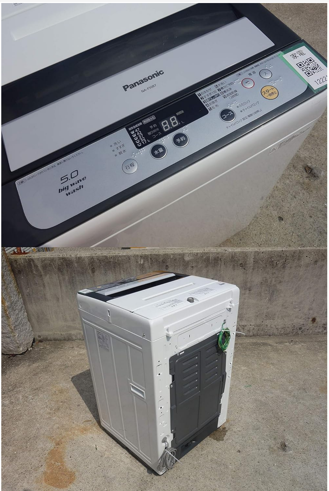
Figure 5.1: Close-up of the control panel, showing buttons for power, start/pause, course selection, and the digital display. The control panel features a digital display and push-buttons for selecting various functions and wash courses. The digital