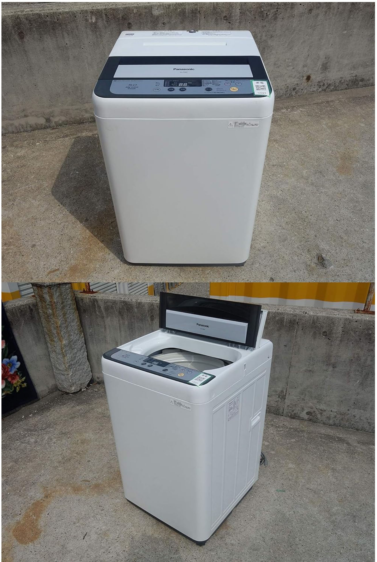
Figure 3.1: Front view of the Panasonic NA-F50B7 washing machine with the lid closed.