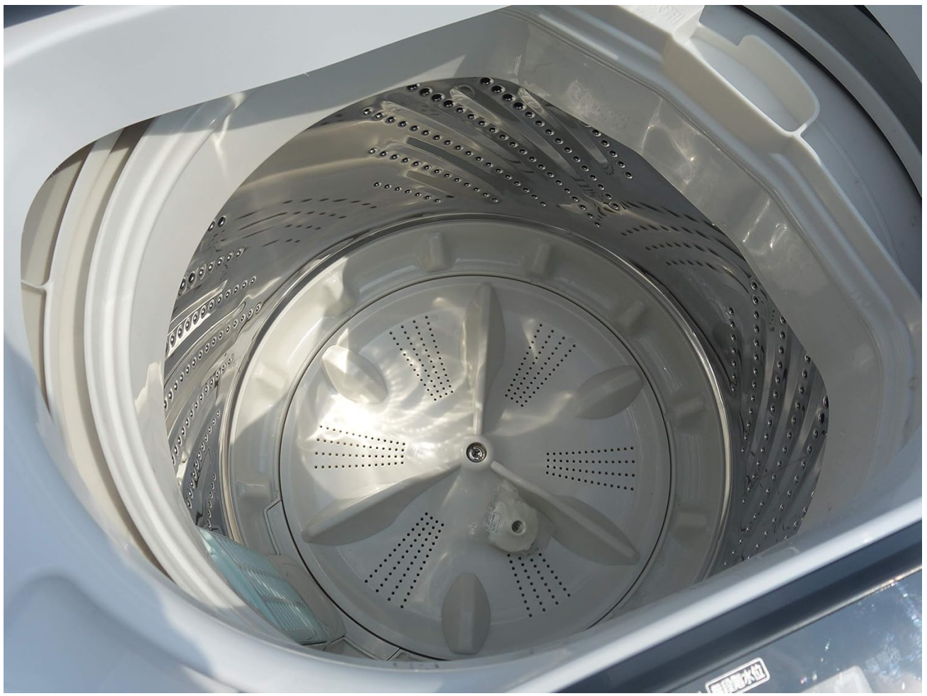
Figure 6.1: Interior view of the stainless steel washing tub.