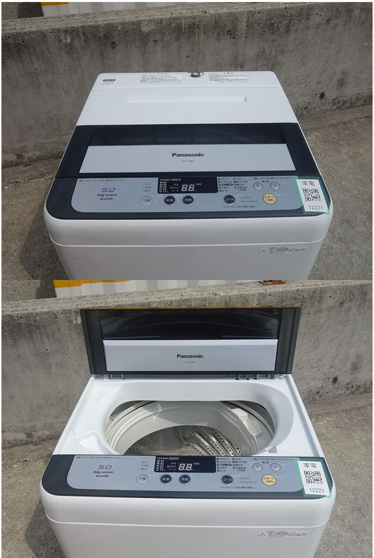
Figure 3.2: Top view of the Panasonic NA-F50B7 washing machine with the lid open, showing the control panel and tub access.