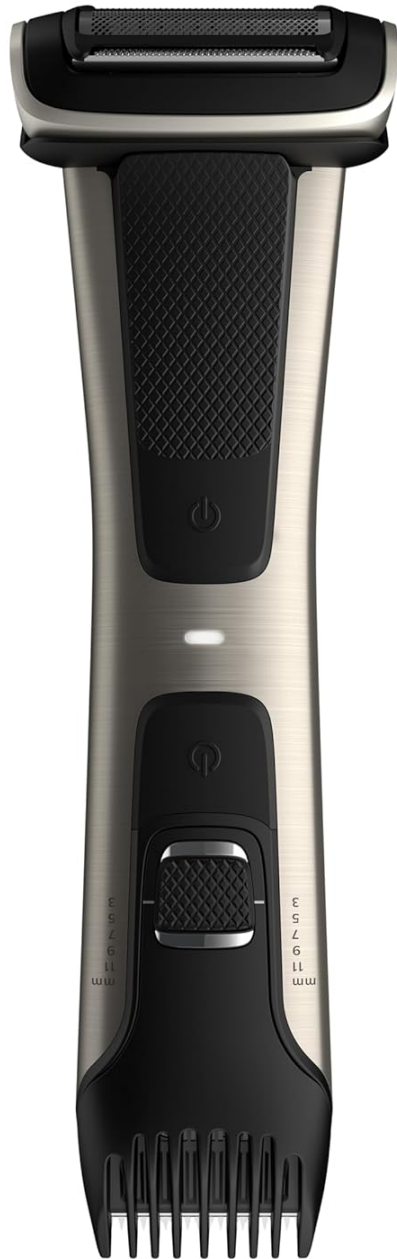
Front view of the Bodygroom 7000 Series, highlighting its ergonomic design and integrated adjustable trimmer.