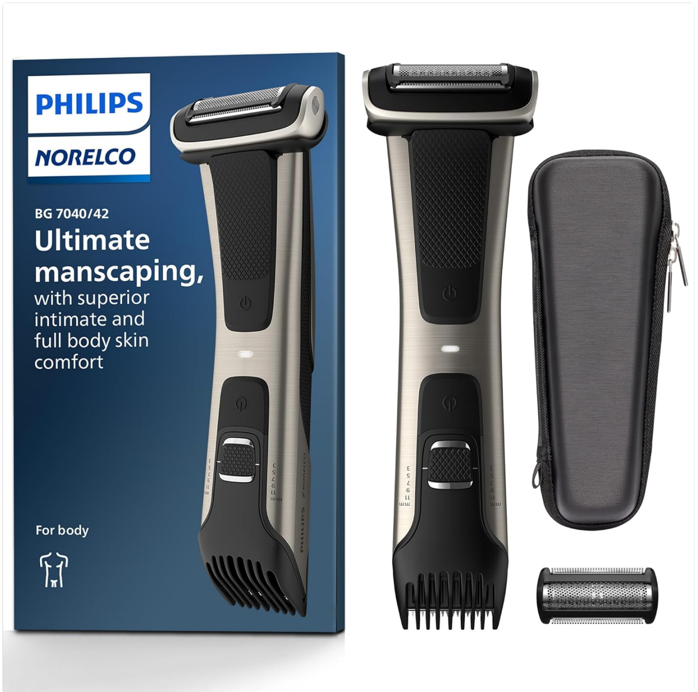
The Philips Bodygroom 7000 Series, Model BG7040/42, shown with its packaging, travel case, and replacement foil head.