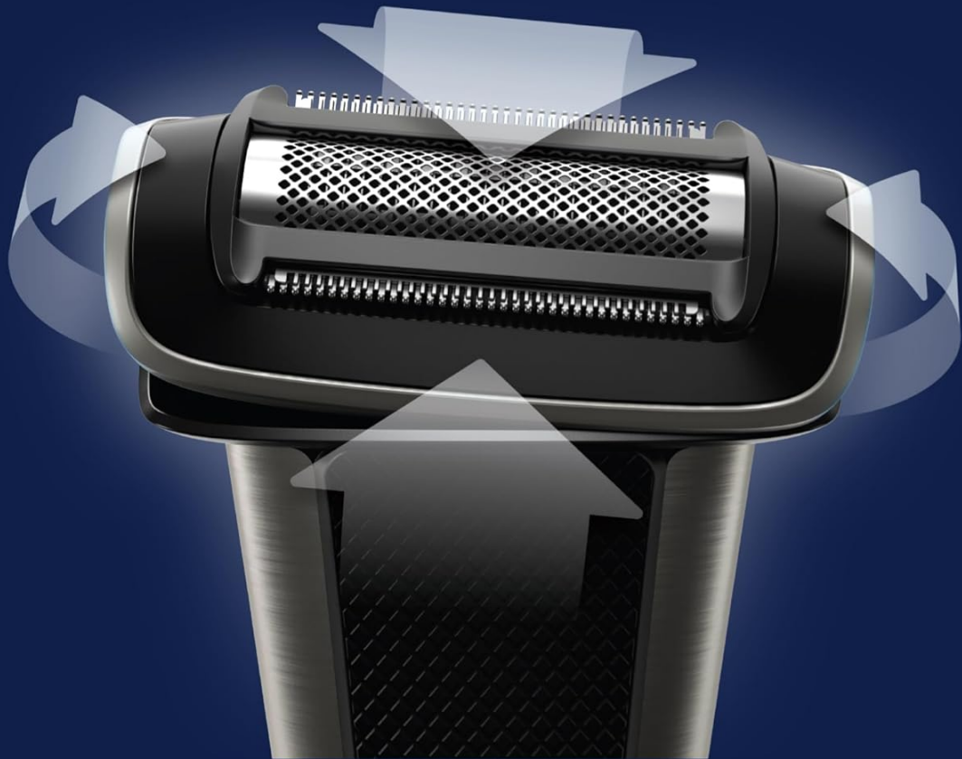
Illustration of the 4-directional pivoting head, designed to adapt to body contours for efficient hair capture.

captures short and long hair and adapts to every contour of your body