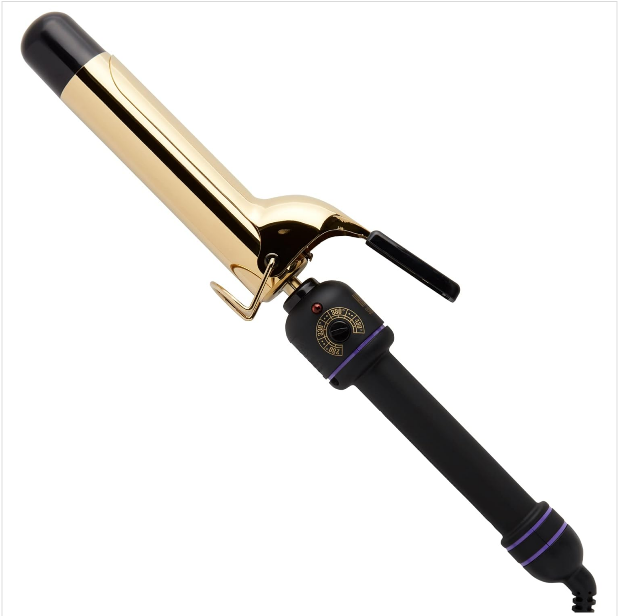
Image: The Hot Tools Pro Signature 1 1/4" Curling Iron, featuring a gold-plated barrel and black handle with temperature control dial.