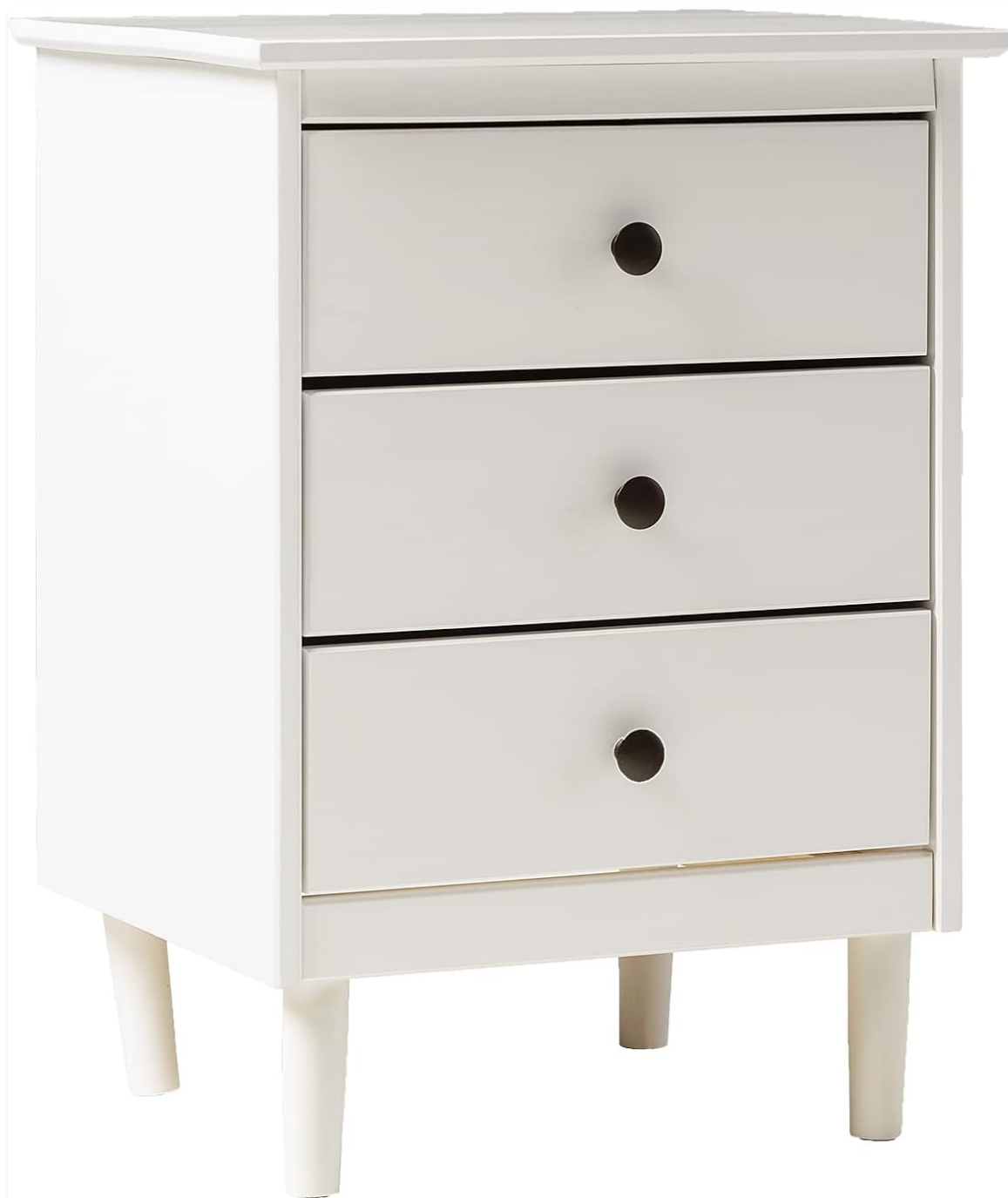
Figure 1: Front view of the Walker Edison Traditional Wood 3-Drawer Nightstand in white.