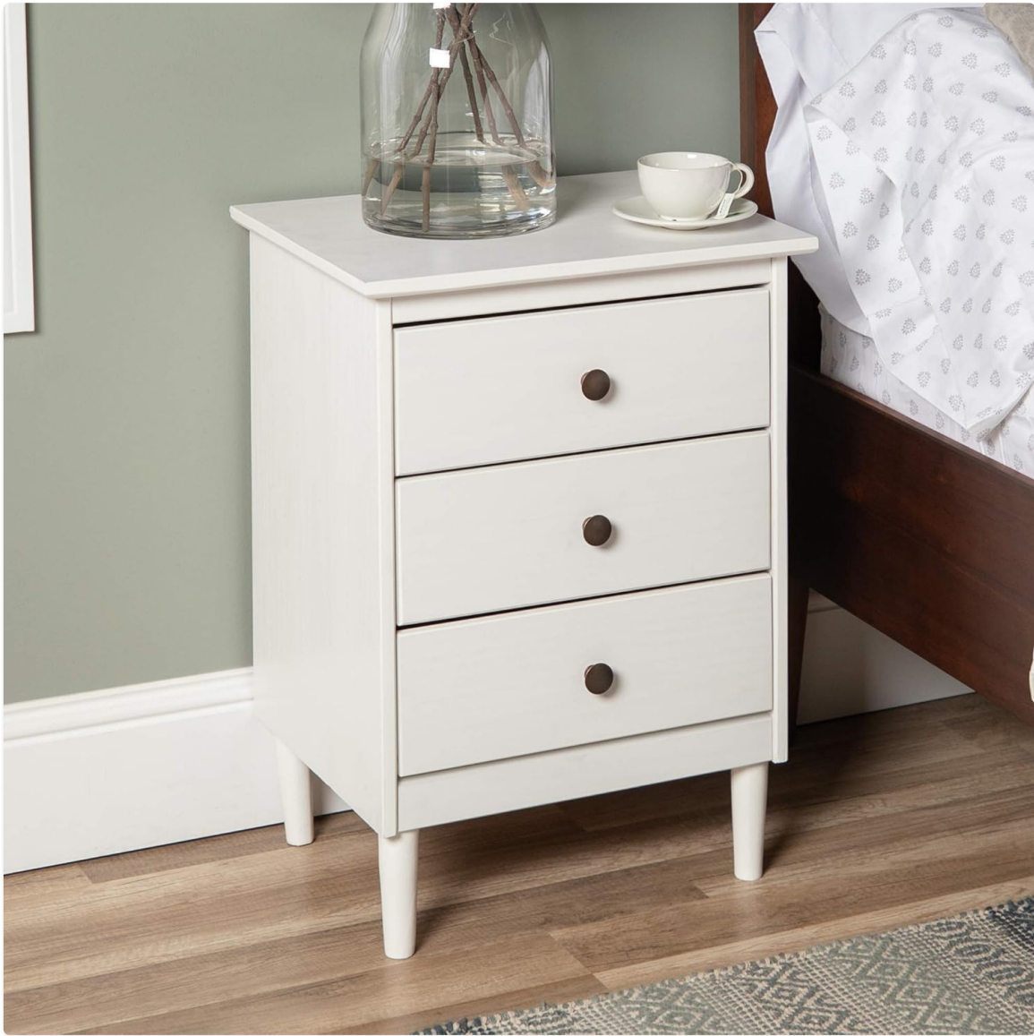
Figure 2: The nightstand integrated into a bedroom setting, showcasing its functional and aesthetic appeal.