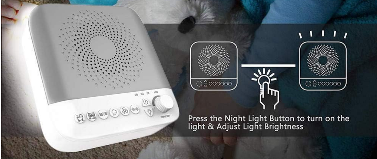
Image 4: The adjustable soft LED night light with 7 brightness levels.

Nighttime Navigation & Comfort and Reassure Your Kids Who Fear Of Darkness