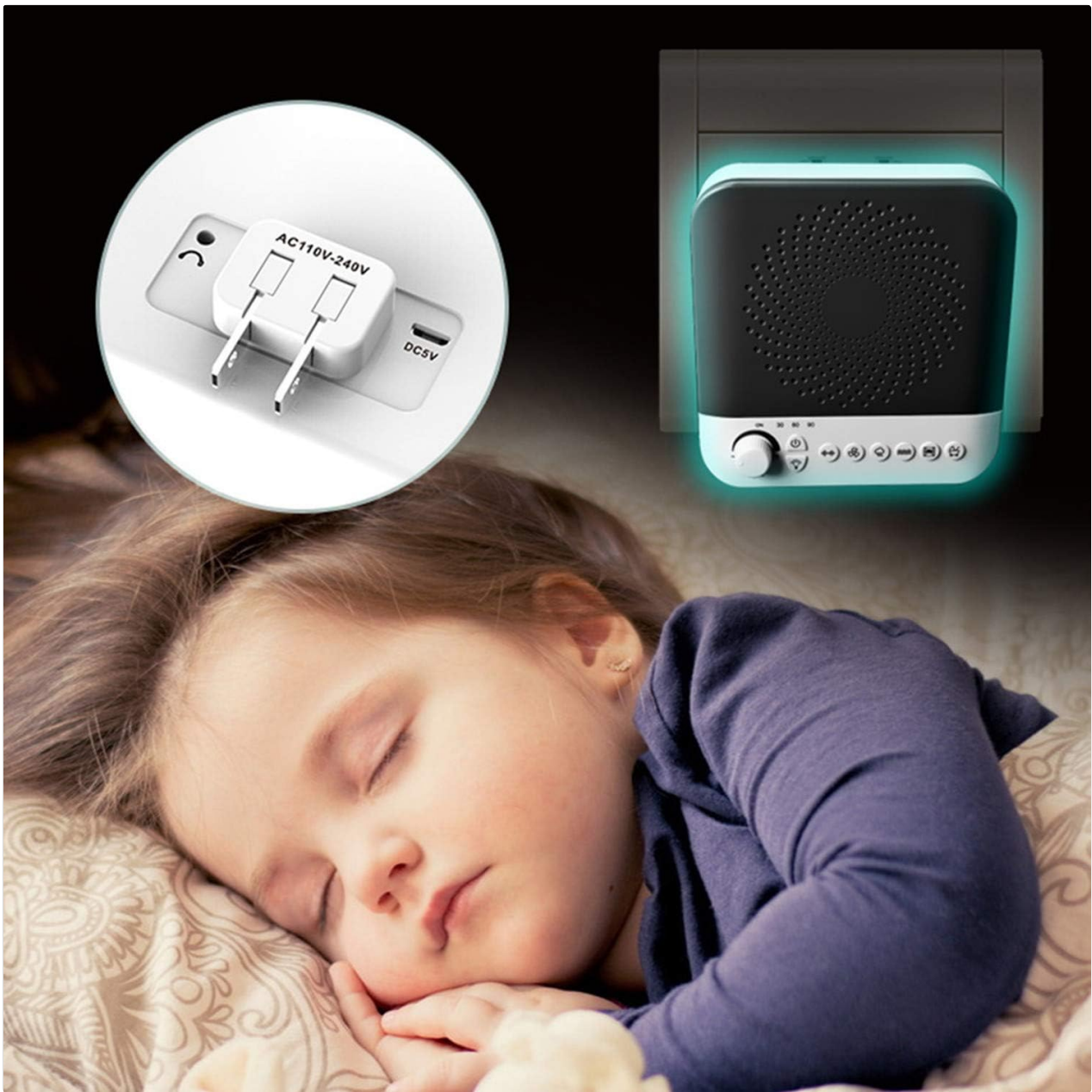
Image 3: The BEREST A3-02 plugged directly into a wall outlet, highlighting its convenient design.