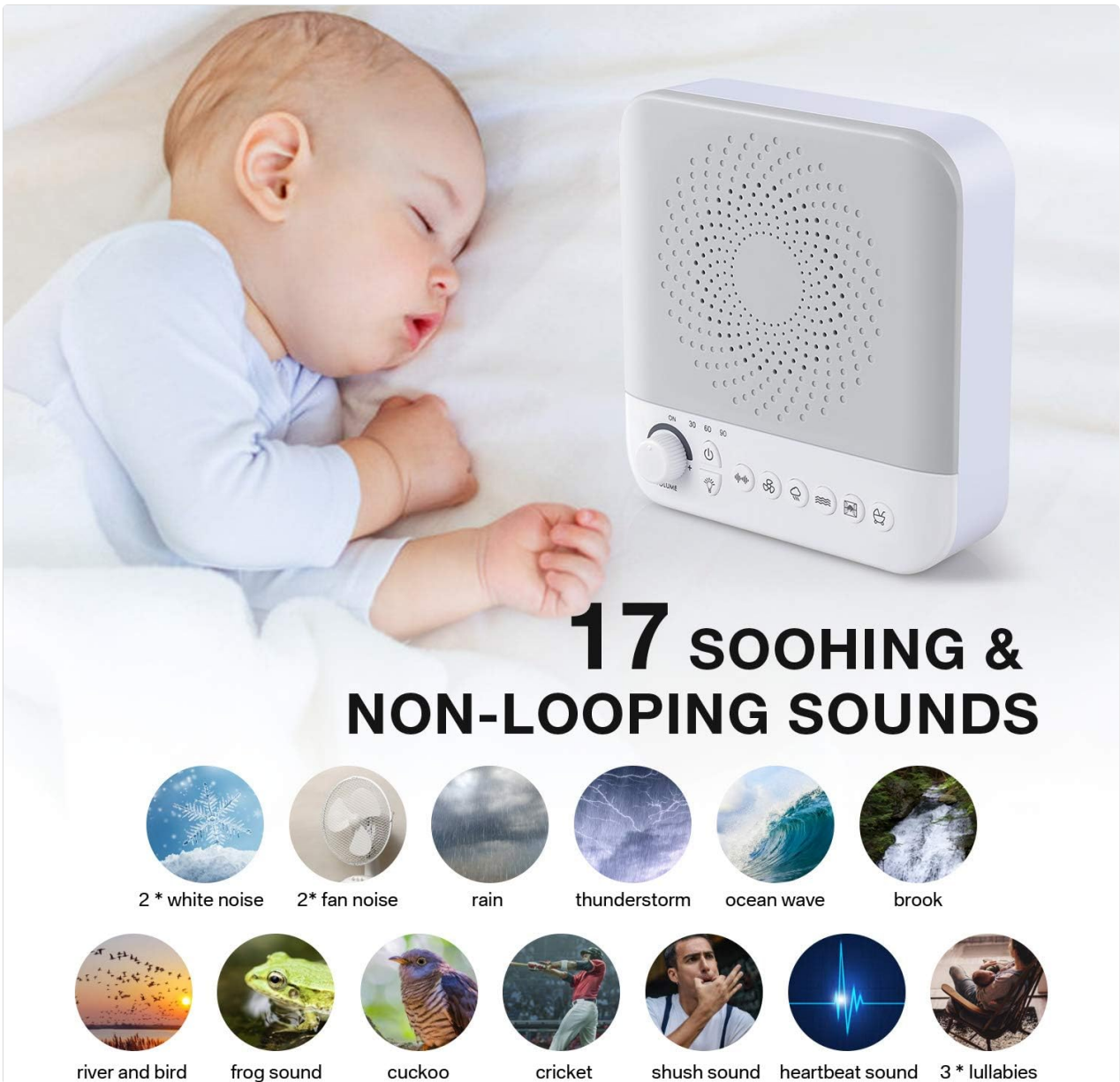
Image 1: The BEREST A3-02 White Noise Sound Machine, illustrating its 17 soothing sounds.