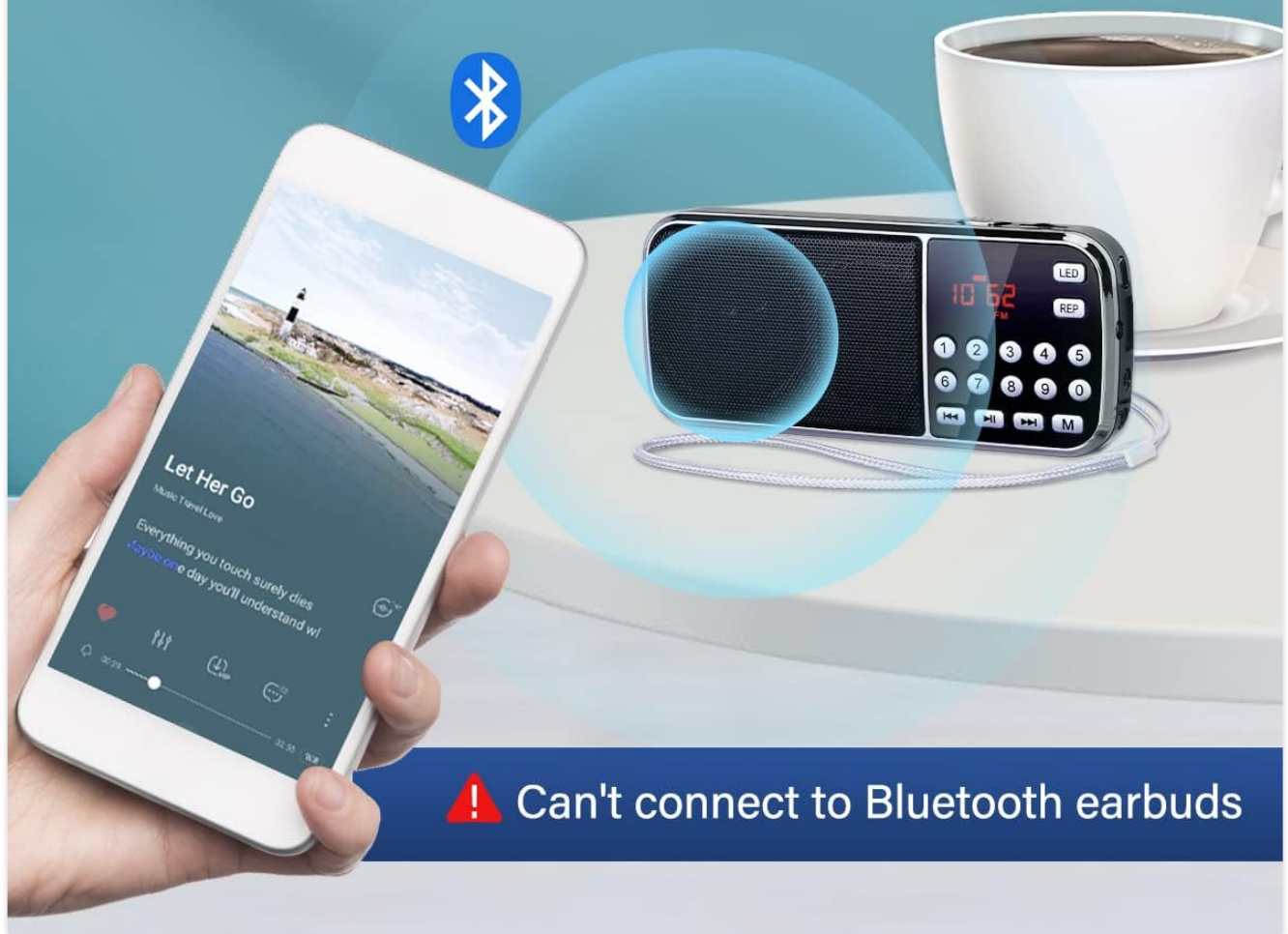
Figure 6: The radio wirelessly connects to your smartphone via Bluetooth for audio streaming.