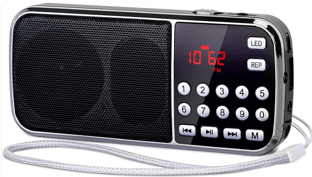
Figure 1: Front view of the PRUNUS J-189 radio, showing the speaker grille, digital display, and control buttons.

The PRUNUS J-189 is a compact and versatile portable radio designed for ease of use and high-quality audio. It features AM/FM radio reception, Bluetooth connectivity for streaming audio, an MP3 player function via USB or TF card, and a built-in LED flashlight. Its small size and lightweight design make it ideal for various indoor and outdoor activities.