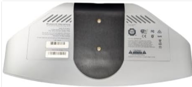
Figure 2: The Pulse 2i speaker positioned on a surface, ready for use.

Place your Pulse 2i speaker on a stable, flat surface. For optimal sound performance, ensure it is not obstructed and has clear space around it. The speaker is designed to deliver powerful audio in large rooms.