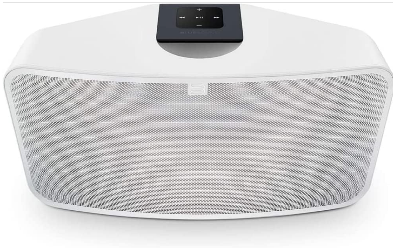
Figure 1: Front view of the Bluesound Pulse 2i Wireless Smart Speaker.

The Bluesound Pulse 2i is a premium, high-resolution streaming music speaker designed to fill large spaces with rich, clear audio. As part of the Bluesound ecosystem, it offers unparalleled sound quality and versatile connectivity options for a seamless multi-room audio experience. This manual provides detailed instructions for setting up, operating, maintaining, and troubleshooting your Pulse 2i speaker.