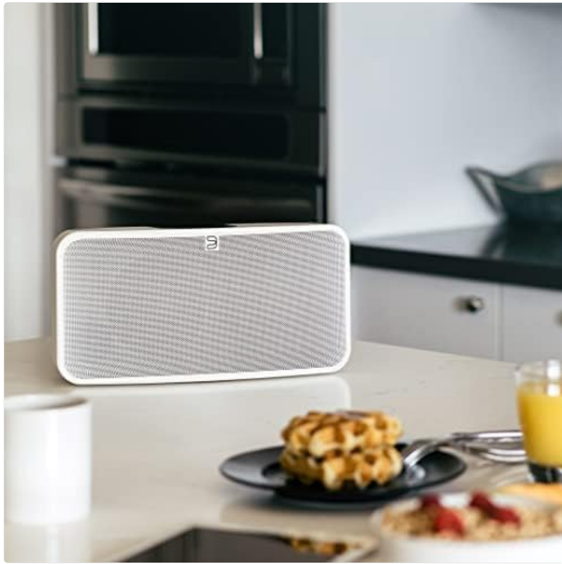
Figure 5: The Pulse 2i seamlessly integrates into a kitchen environment, providing background music.