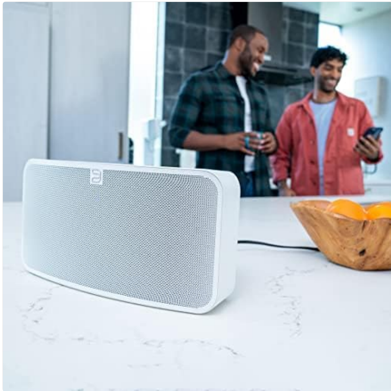
Figure 6: The Pulse 2i enhances the audio experience in a social setting.