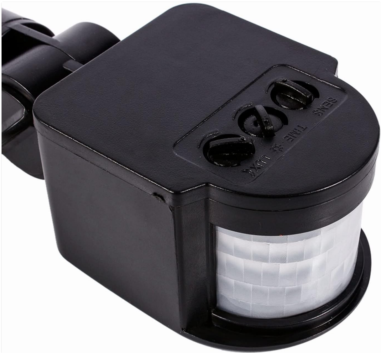
Image 3: Close-up of Adjustment Knobs. This image shows the three control knobs labeled 'SENS', 'TIME', and 'LUX' on the underside of the sensor head, allowing users to fine-tune its settings.