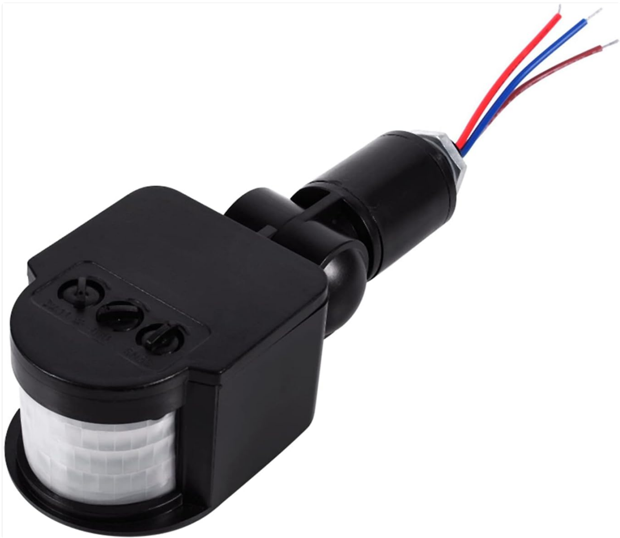
Image 1: FTVOGUE Outdoor 180 Degree PIR Motion Sensor Switch. This image shows the compact black housing of the motion sensor with its adjustable head and the three colored wires (red, blue, black) extending from the base.