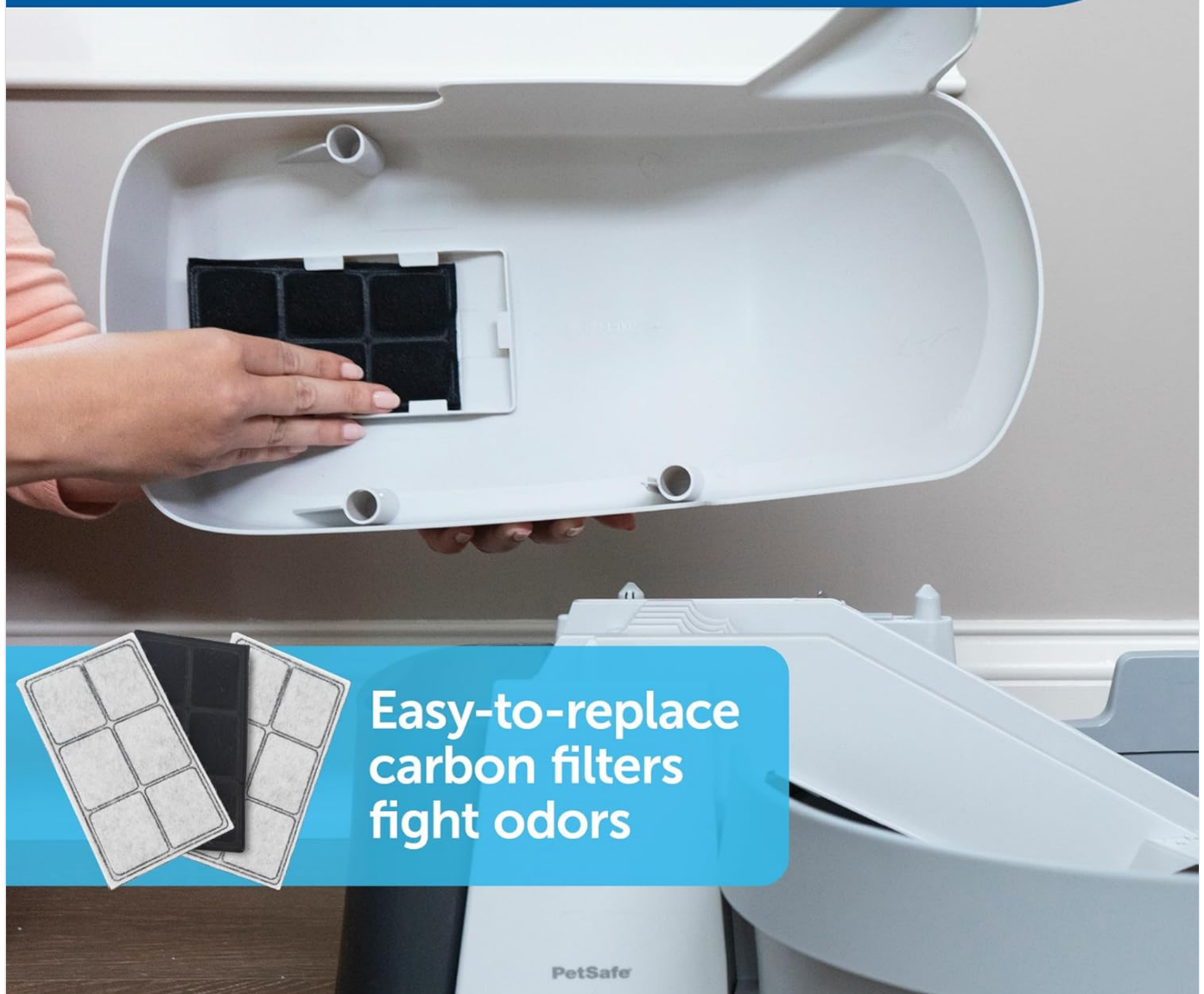
Image: A hand demonstrates the easy replacement of the carbon filter, which is crucial for fighting odors.