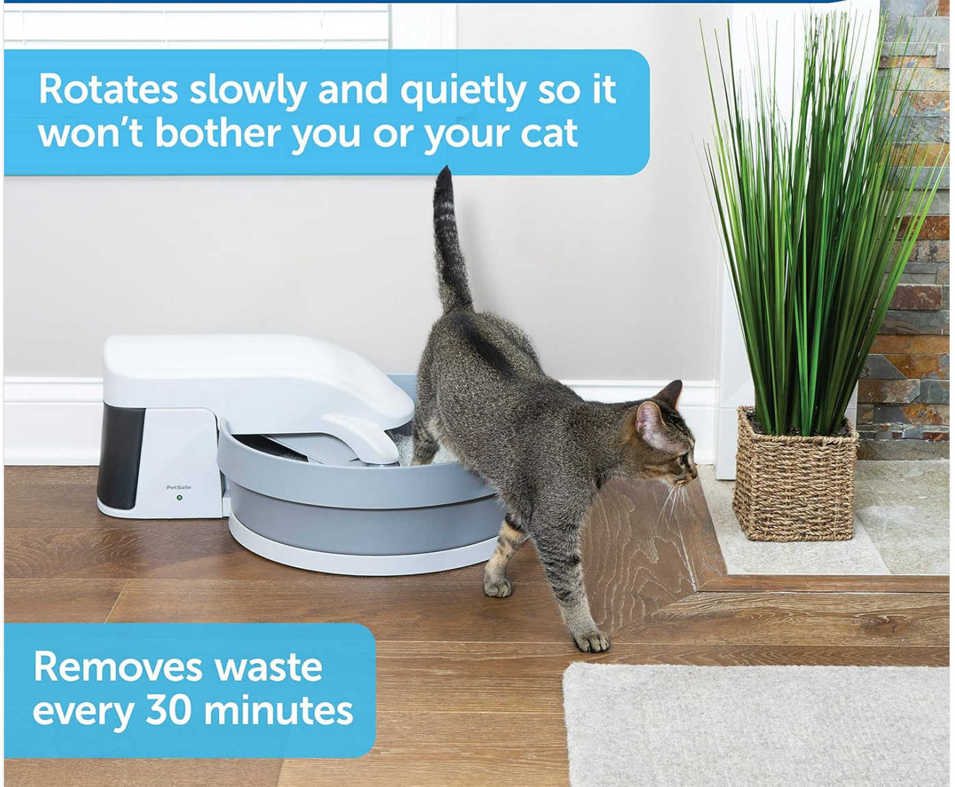
Image: A cat is shown interacting with the PetSafe Simply Clean Litter Box, illustrating the slow rotation and waste removal process every 30 minutes.