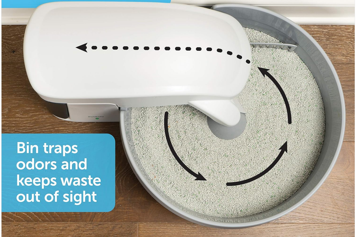
Image: An overhead view of the PetSafe Simply Clean Litter Box, highlighting the covered conveyor system that scoops waste into the bin, trapping odors and keeping waste out of sight.

Bin traps odors and keeps waste out of sight