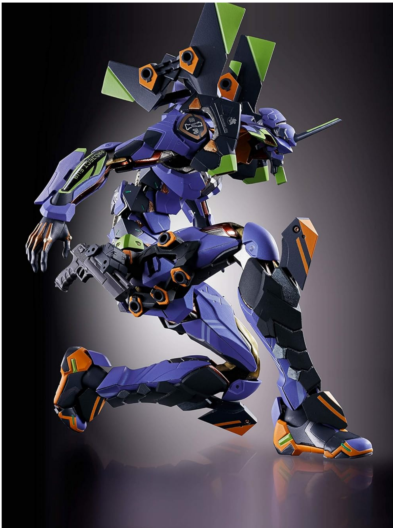
Side view of the Eva-01 figure, highlighting its profile and joint design.