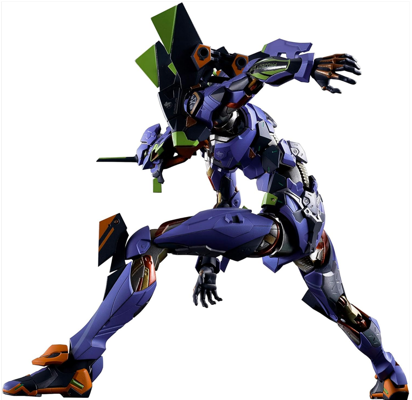
Figure of the Eva-01 Test Type in a crouching, ready-for-action pose, showcasing its detailed design and articulation.