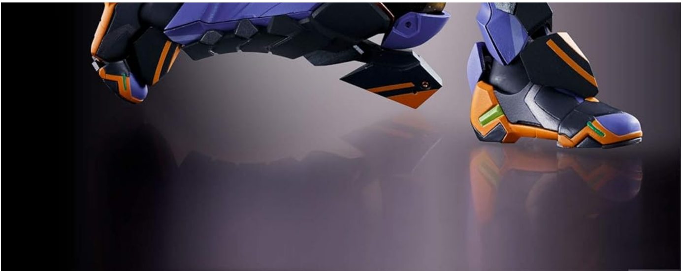
The Eva-01 figure positioned on its display stand, with additional weapons stored on the stand's racks.