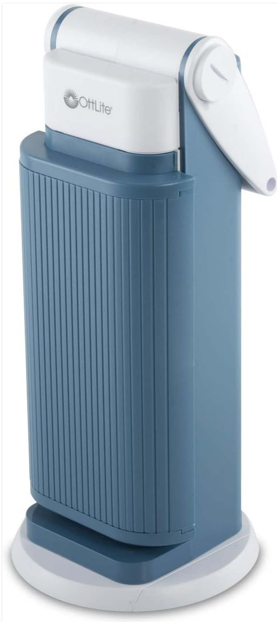
The lamp in its compact, folded state, demonstrating its portability and ease of storage.