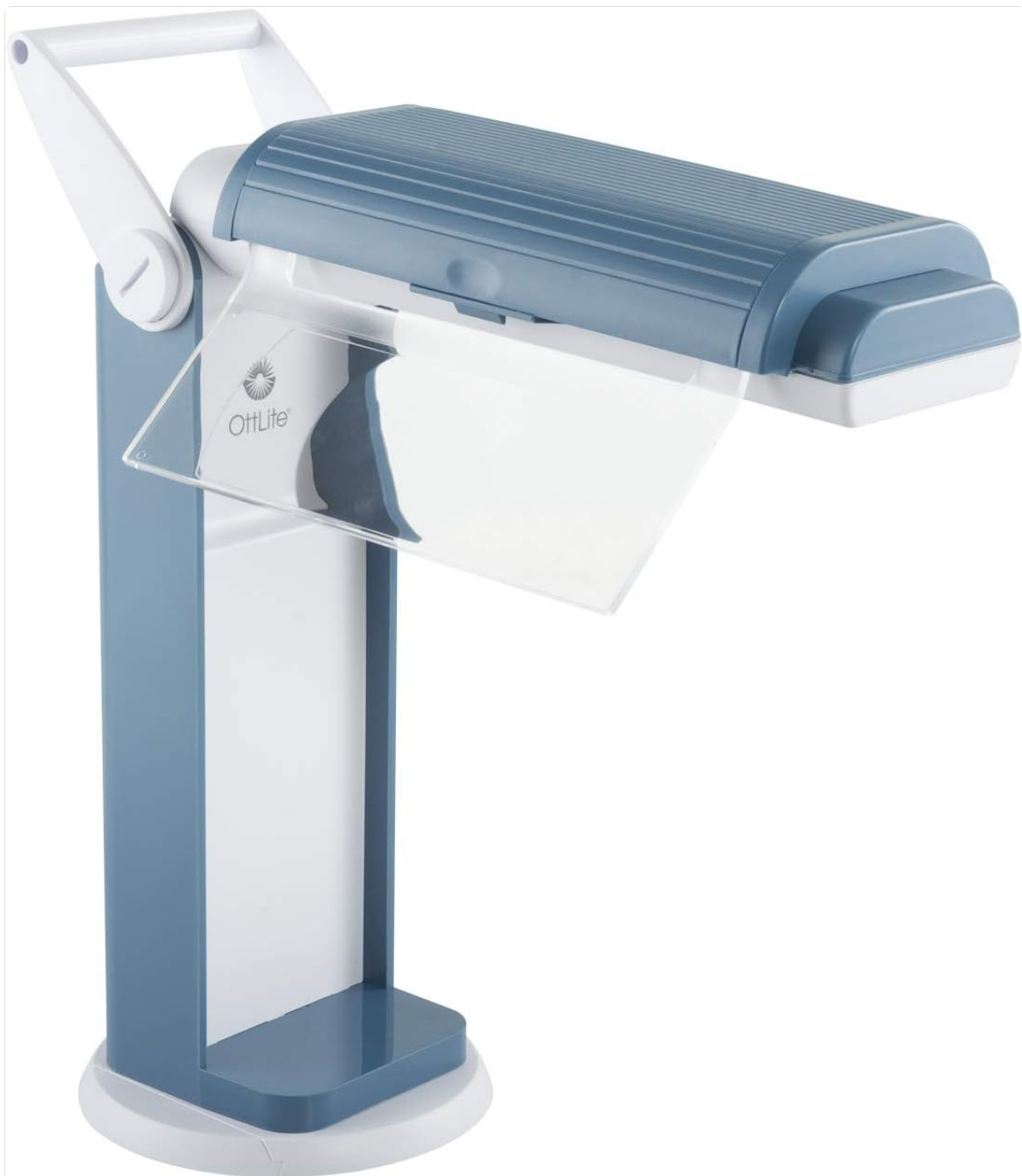
The OttLite 13 Watt Magnifier Task Lamp, shown in its fully extended position, highlighting its compact and functional design.