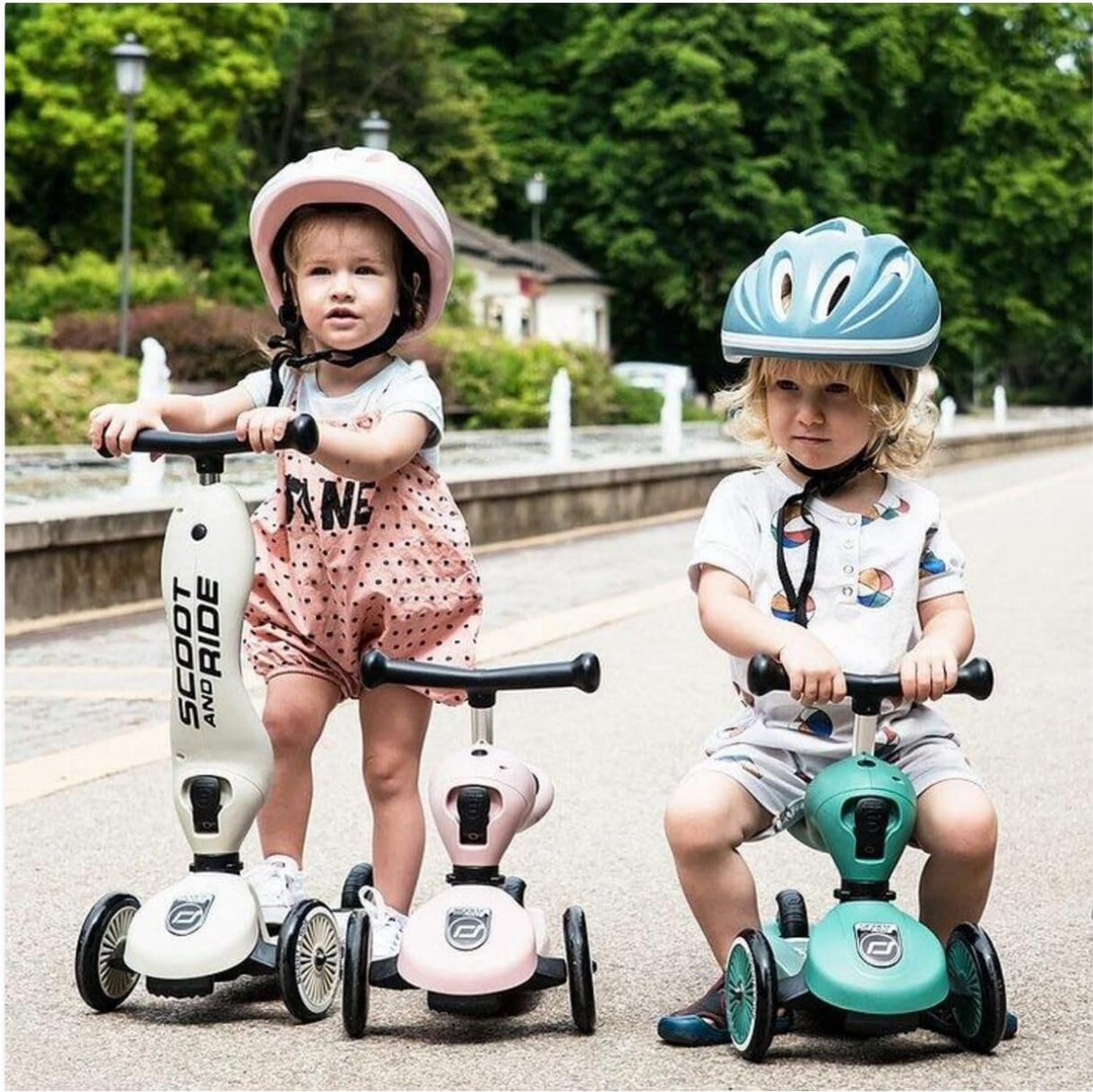
Image: Two children demonstrating the versatility of the Highwaykick 1, one using it as a stand-up scooter and the other as a ride-on.