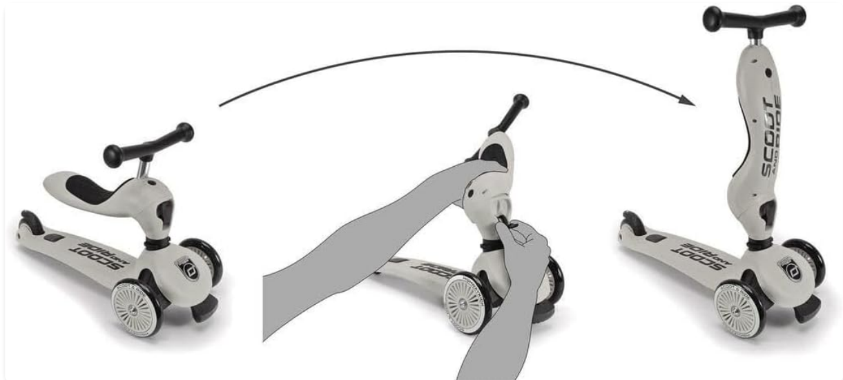
Image: A visual guide illustrating the simple, tool-free conversion process of the Highwaykick 1 from a seated ride-on to an upright kick scooter.