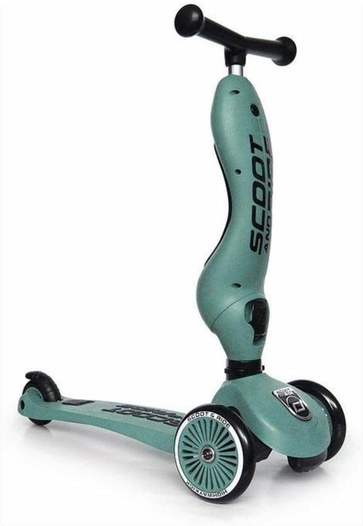
Image: The Highwaykick 1 in its stand-up scooter configuration, ready for older children to ride by pushing off the ground.