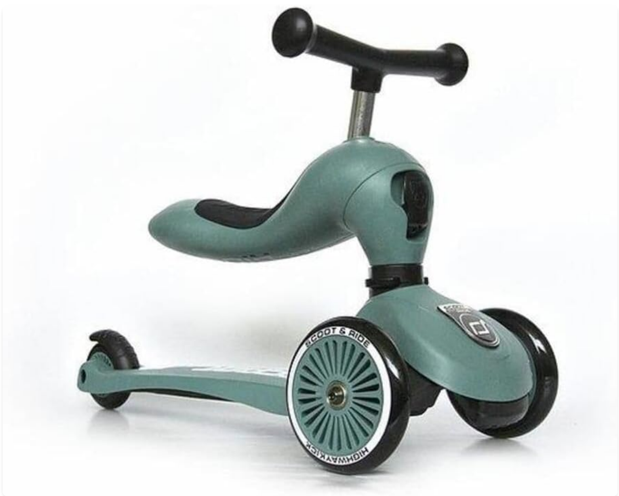
Image: The Highwaykick 1 in its ride-on configuration, designed for younger children to sit and propel themselves.