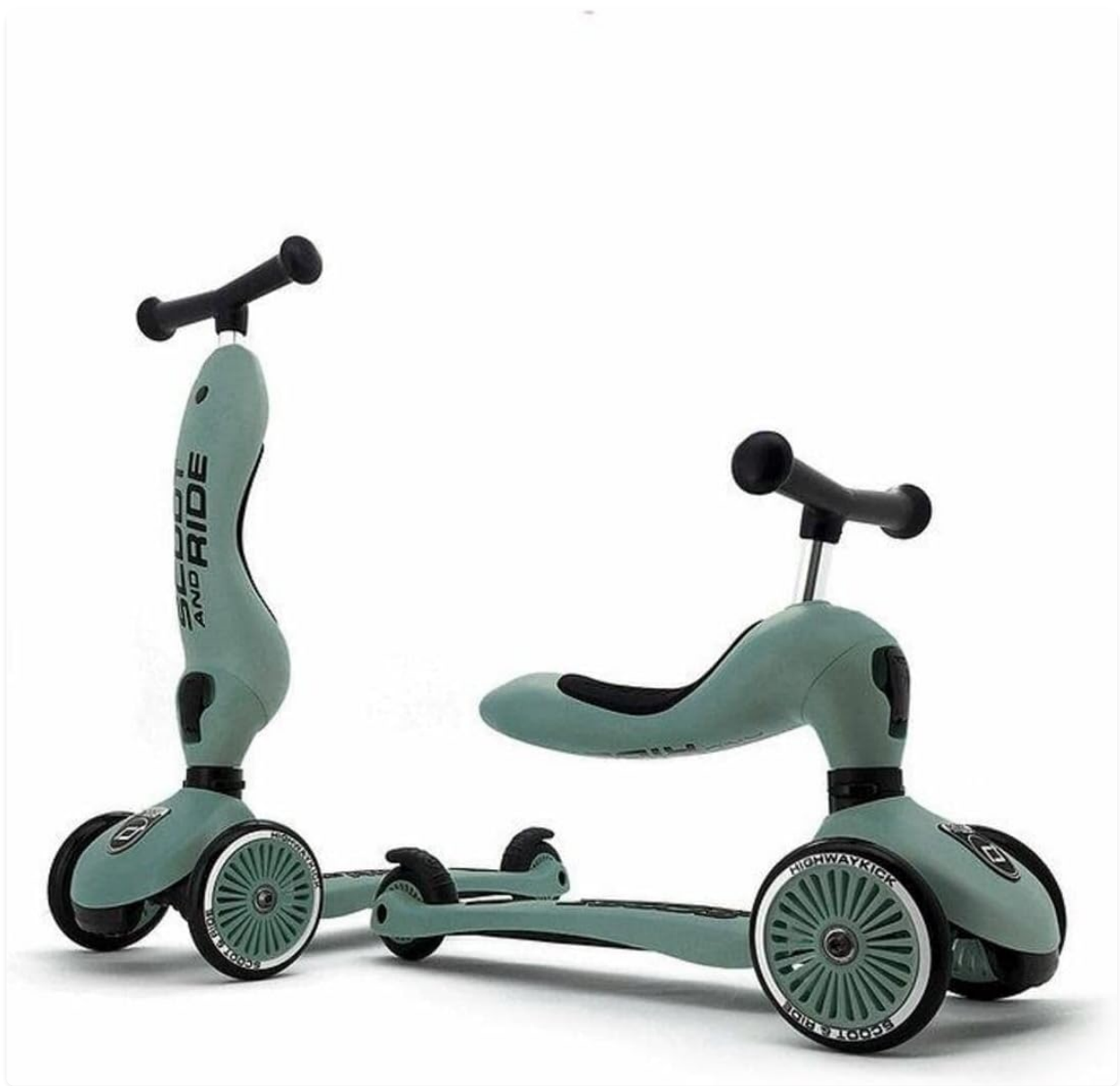
Image: The Highwaykick 1 scooter shown in both its ride-on and stand-up modes, highlighting its versatile design. The scooter is a forest green color.