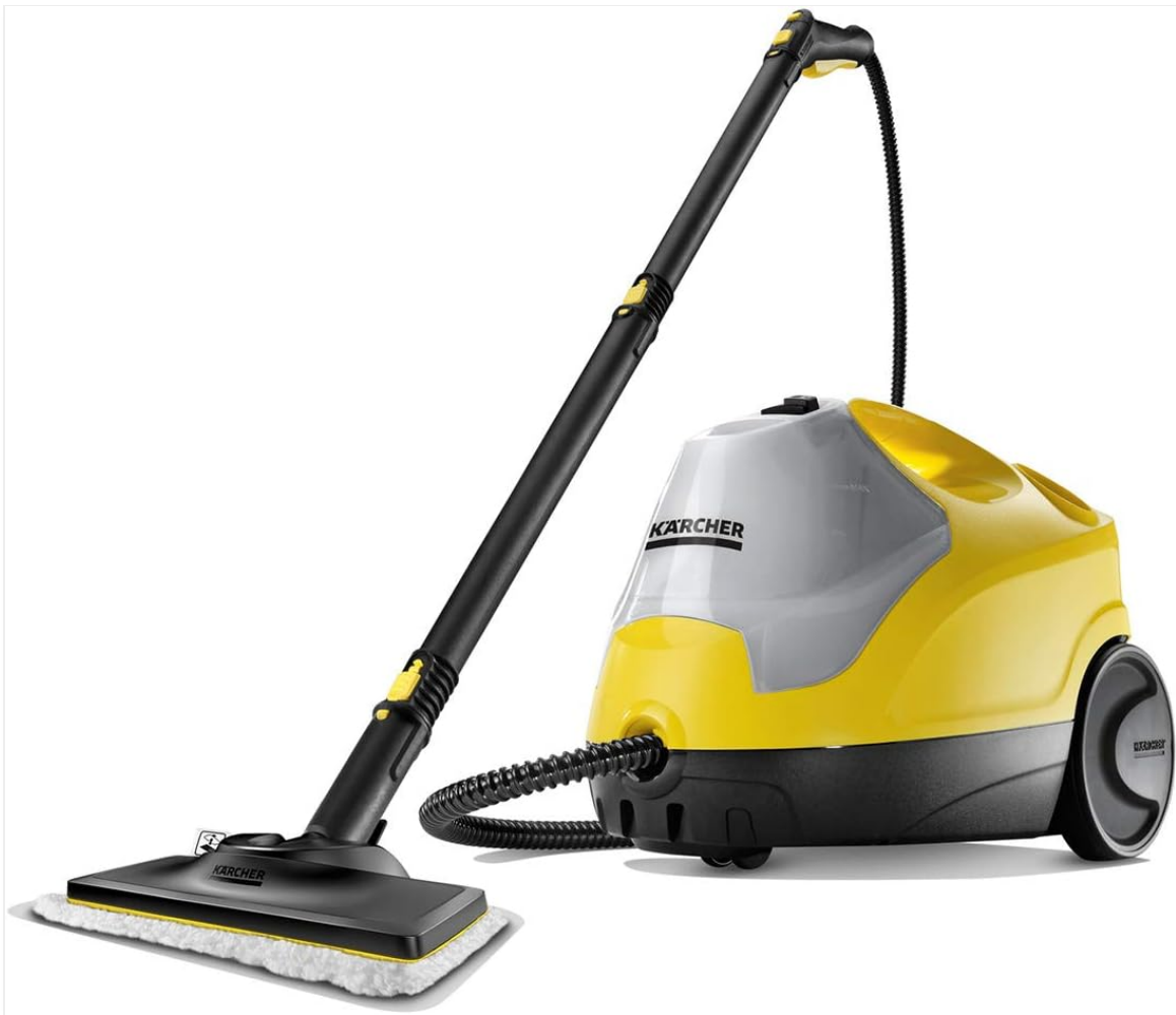
Figure 1: Kärcher SC4 Easy-Fix Steam Cleaner. This image displays the main unit of the steam cleaner, featuring its distinctive yellow and grey design, along with the attached floor nozzle and handle.