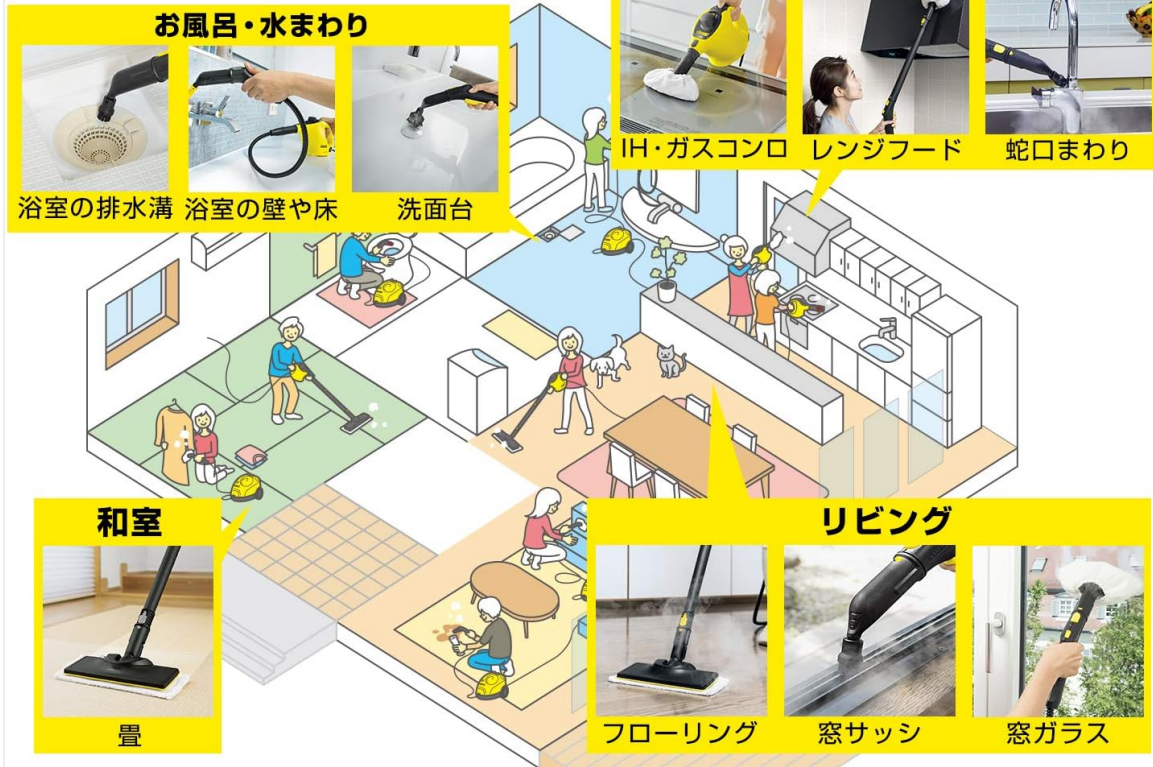
Figure 3: Versatile Cleaning Applications. This diagram illustrates the wide range of uses for the Kärcher SC4 Easy-Fix, demonstrating its effectiveness in cleaning various areas such as bathrooms, kitchens, and living spaces, including floors, tiles, and fixtures.