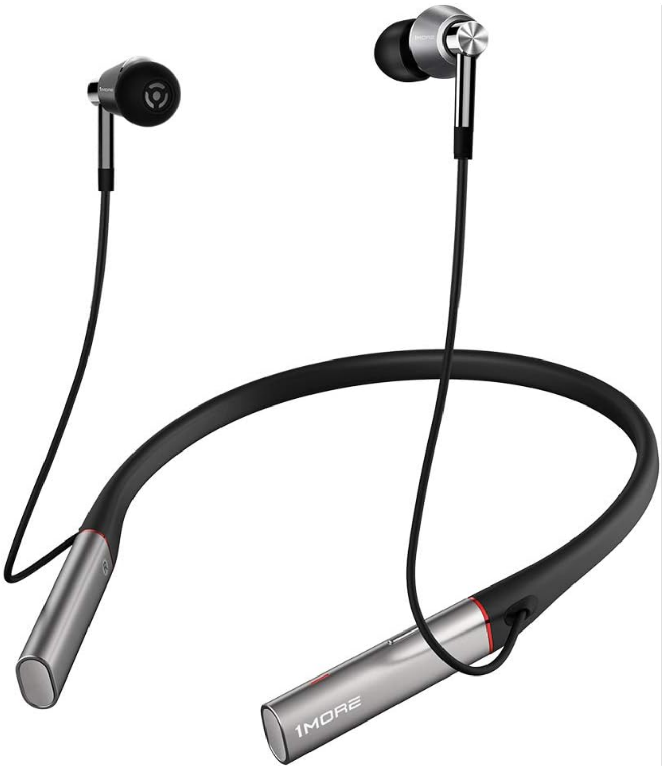
Image 1.1: The 1MORE Triple Driver BT In-Ear Headphones featuring a silver finish and neckband design.