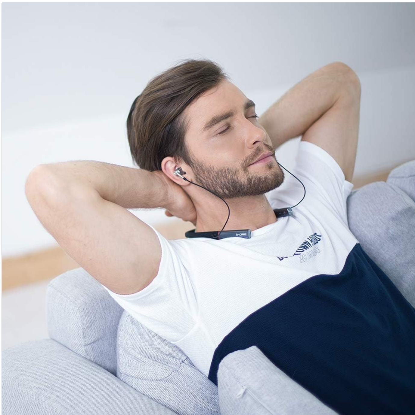
Image 5.1: Enjoying audio with the headphones in a relaxed setting.