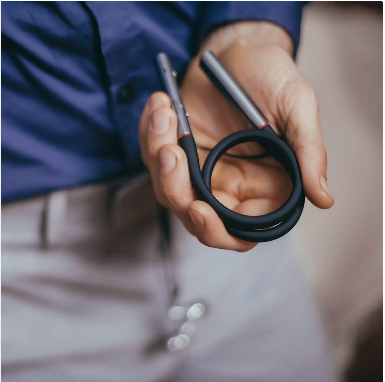
Image 3.2: The flexible neckband design allows for easy storage and comfortable wear.