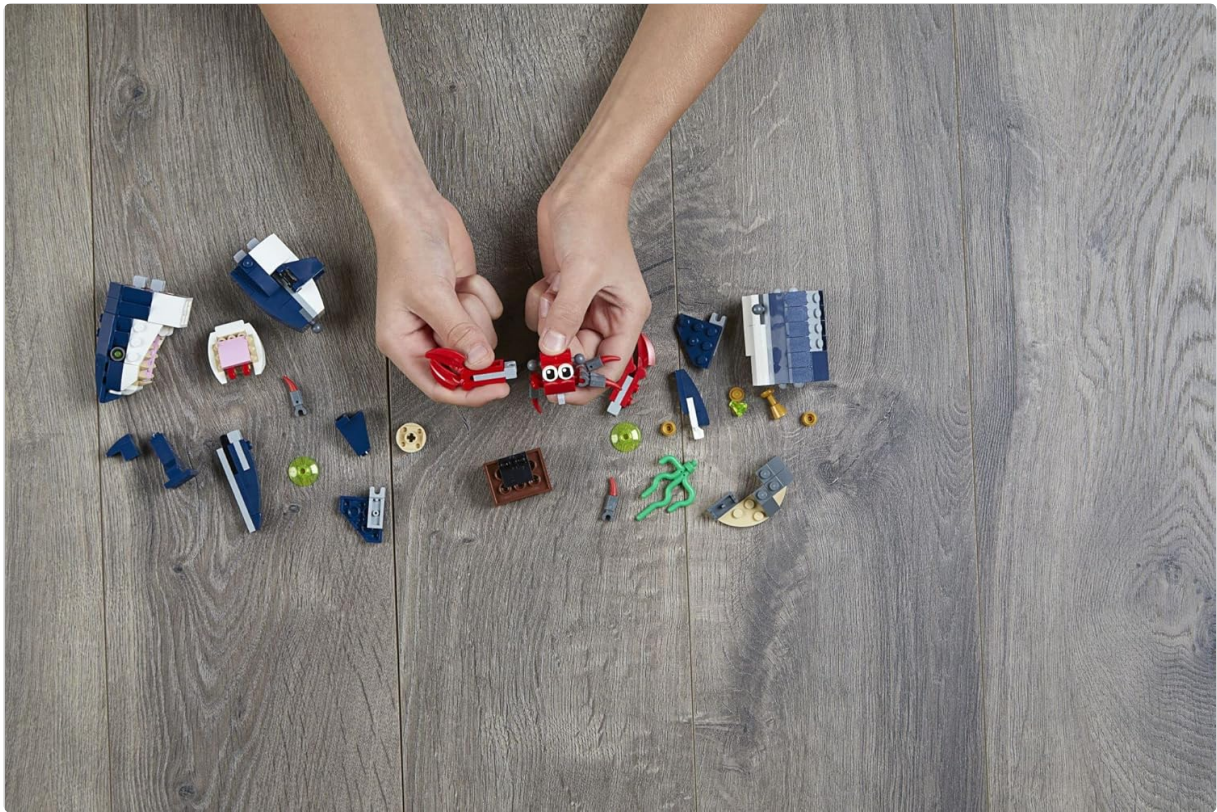
Image: A top-down view of hands assembling LEGO pieces, specifically focusing on the red crab model, with other disassembled pieces scattered around.