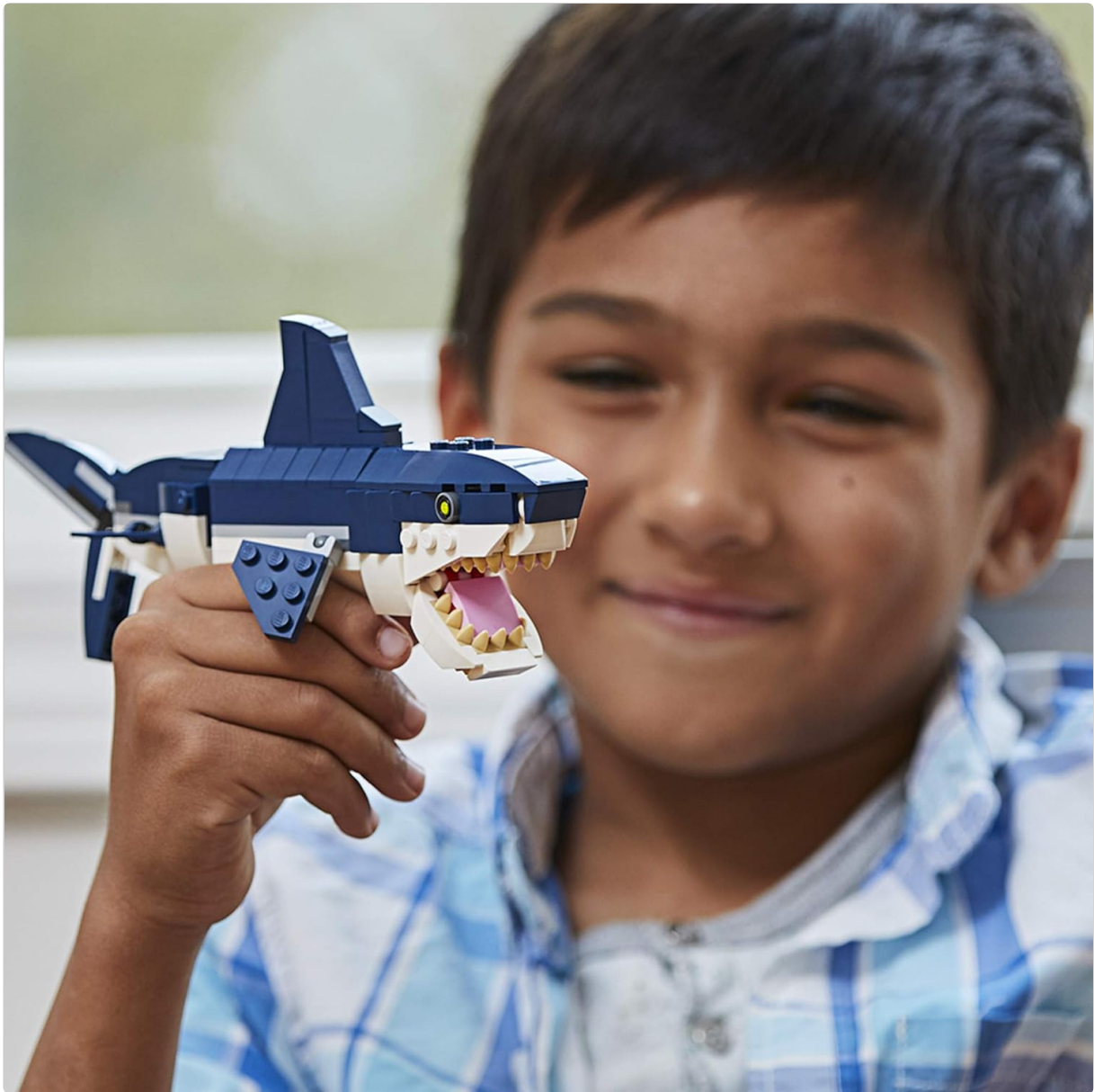
Image: A young boy holding the assembled LEGO shark model, demonstrating its open mouth and posable features, highlighting its play value.