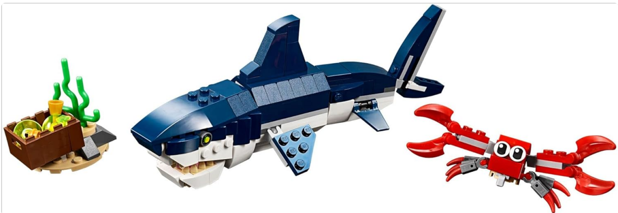
Image: The packaging for the LEGO Creator 3 in 1 Deep Sea Creatures set, displaying the three possible models: a shark and crab, a squid, and an angler fish.

The LEGO Creator 3 in 1 Deep Sea Creatures (31088) building set offers three distinct build-and-play experiences for children aged 7 years and up. This versatile set allows you to construct a scary shark with a posable crab, a flexible squid, or a wide-mouthed angler fish. Each model features movable parts, encouraging imaginative underwater adventures and creative play.