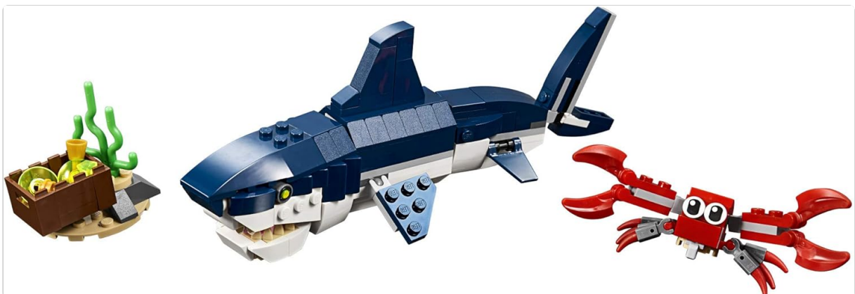
Image: The primary build of the set, showcasing a detailed dark blue and white shark with an open mouth, a red posable crab, and a small treasure chest with green seaweed elements.

Crab Dimensions: Over 1" (3cm) long and 4" (11cm) wide.