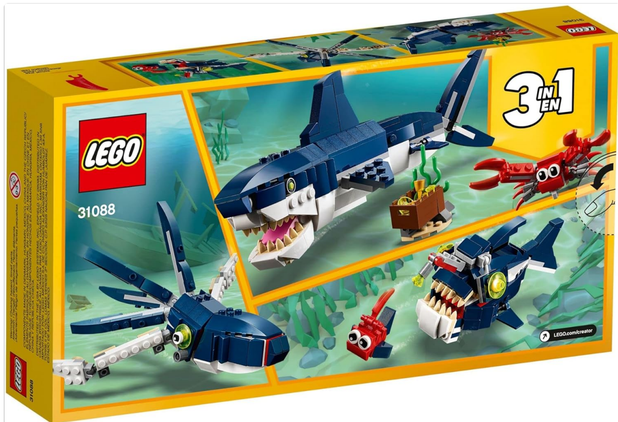
Image: The squid model from the LEGO Creator 3 in 1 set, featuring a dark blue and white body with multiple posable tentacles, designed for dynamic display.

Squid Dimensions: Over 1" (4cm) high, 7" (18cm) long, and 8" (22cm) wide.