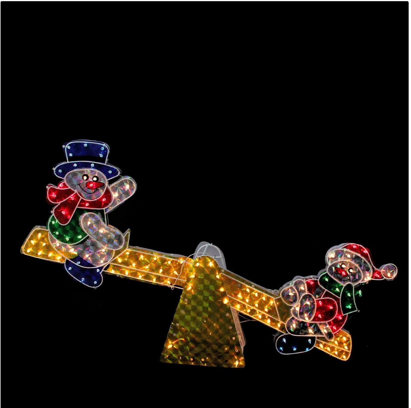
Image 2: The Lighted Holographic Snowmen on See Saw Outdoor Christmas Decoration illuminated at night, demonstrating its visual effect.