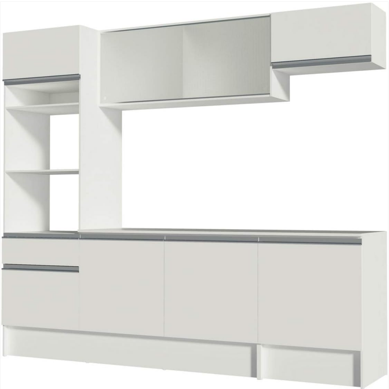
Image 7.2: A full perspective view of the Madesa Topazio Integrated Kitchen Set, emphasizing its clean lines and complete configuration.