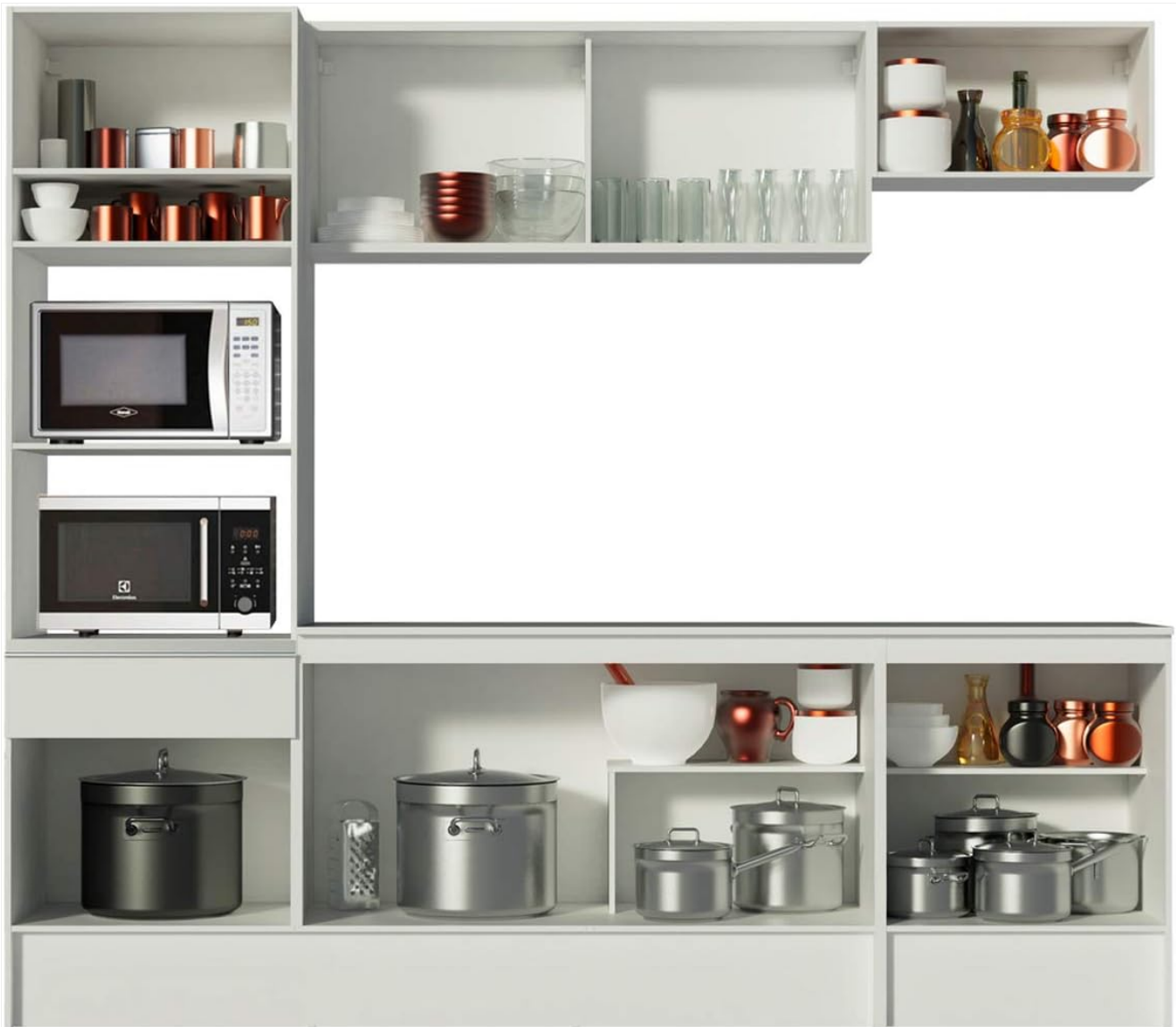
Image 4.1: Internal organization of the kitchen set, demonstrating ample space for various kitchen items and appliances.