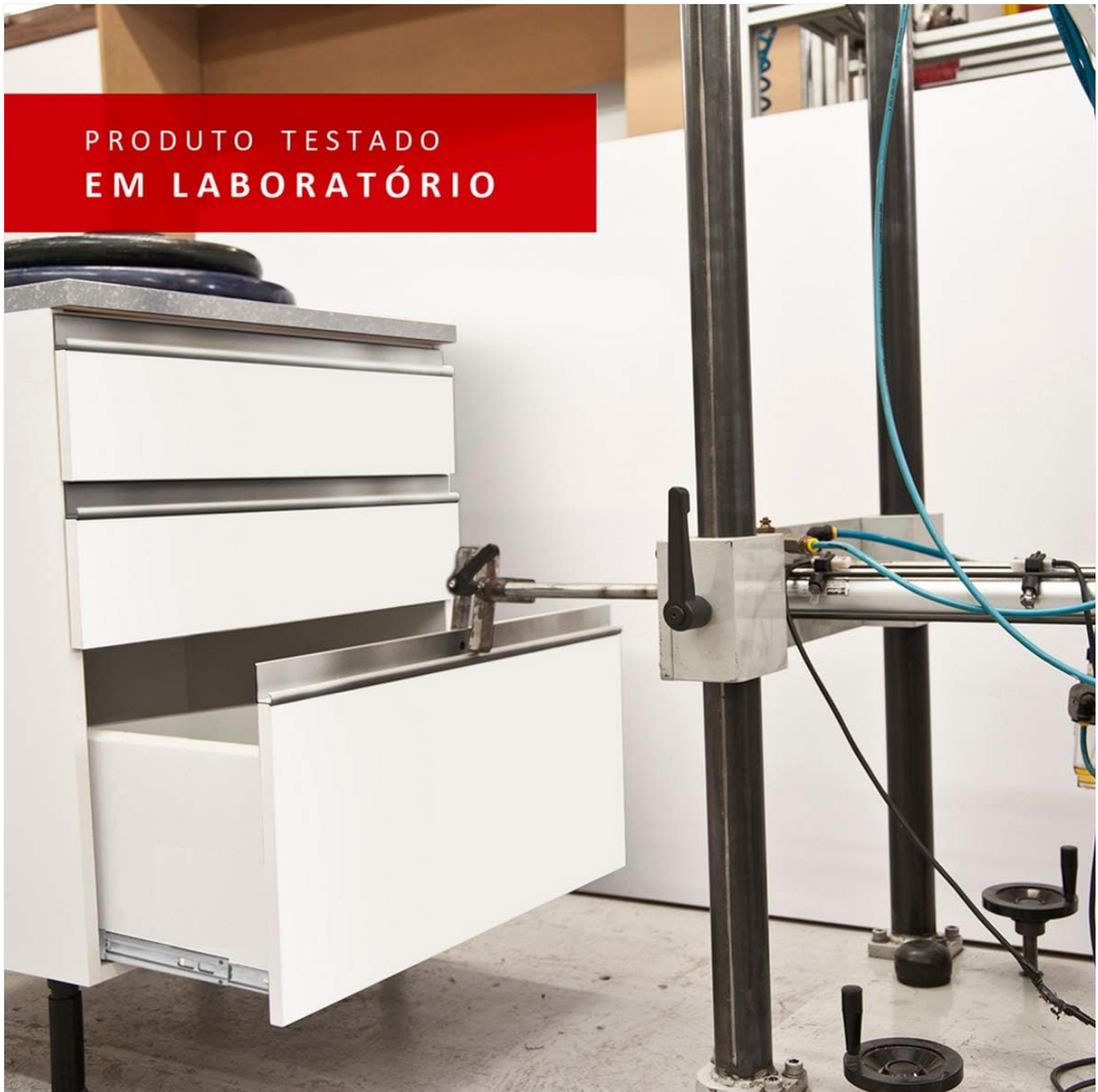
Image 5.1: The product undergoes laboratory testing to ensure durability and quality.