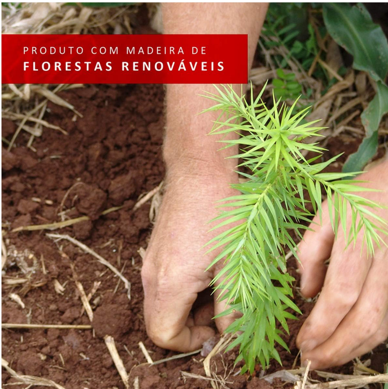
Image 5.2: Madesa utilizes wood sourced from renewable forests, reflecting an ecological and sustainable approach to furniture production.

PRODUTO COM MADEIRA DE FLORESTAS RENOVÁVEIS