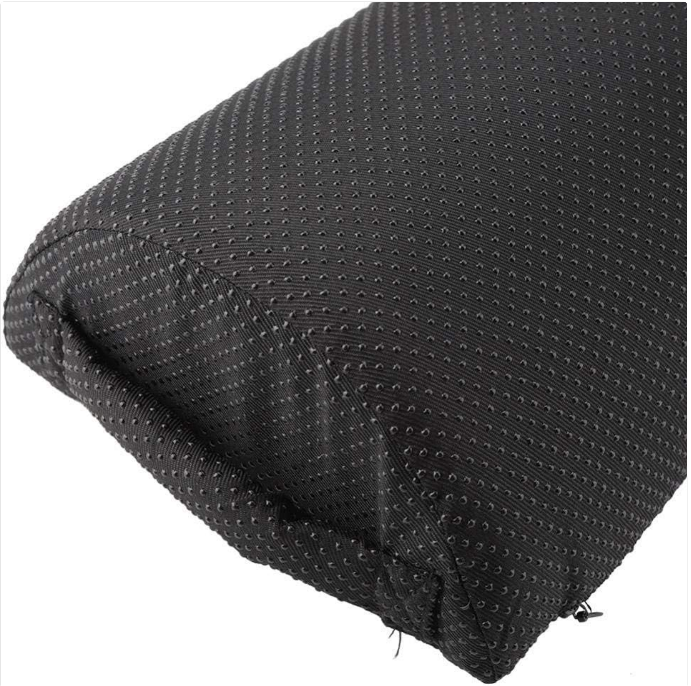
Image: Side profile of the Aramox Foot Rest Cushion, illustrating its ergonomic dome shape designed for optimal foot support.