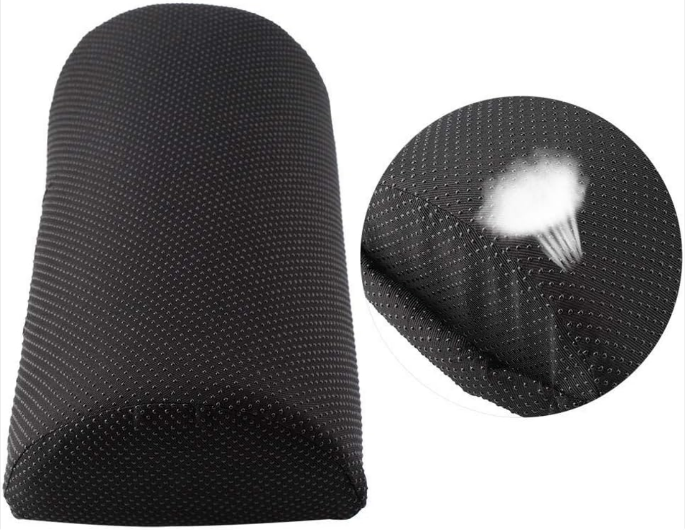
Image: A detailed view of the polyester fabric, illustrating its breathable and wear-resistant qualities.

Adopts quality polyester fabric, breathable, wear resistant and durable.