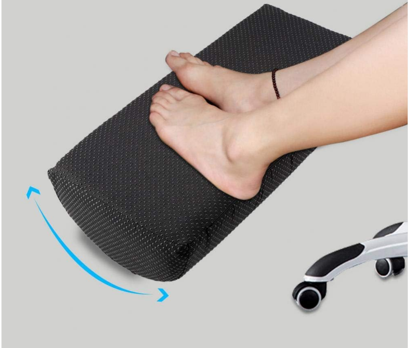
Image: A close-up of feet on the foot rest cushion, highlighting the soft, supportive surface provided by the high-density sponge.

Uses high dense sponge, super soft and provides extreme comfort to your foot.