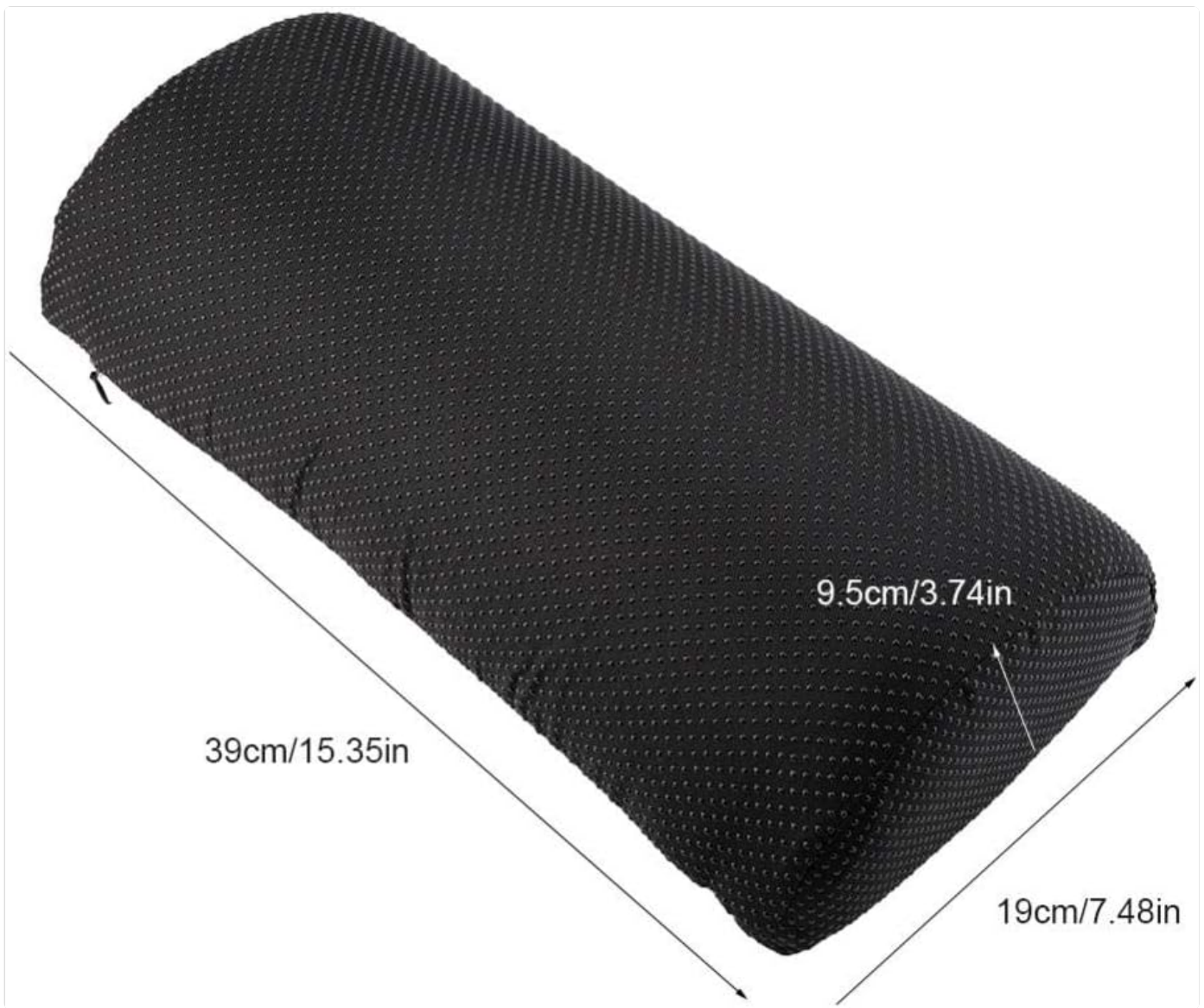
Image: The foot rest cushion displaying its approximate dimensions: 39cm (15.35in) length, 19cm (7.48in) width, and 9.5cm (3.74in) height.