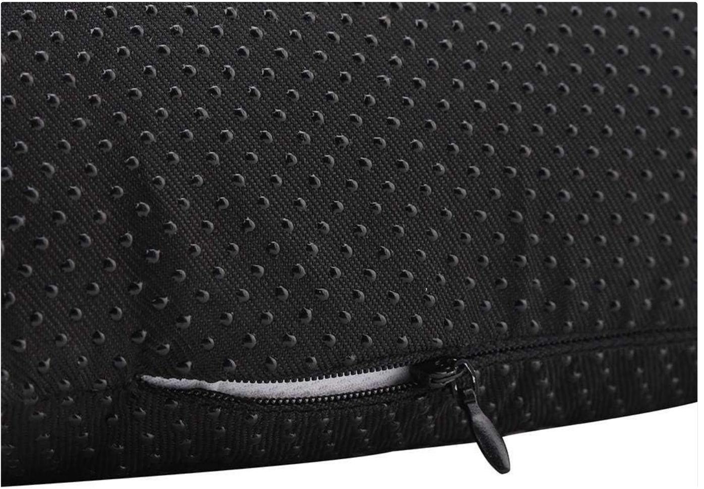
Image: A close-up view of the zipper on the foot rest cushion, indicating the removable and washable cover.