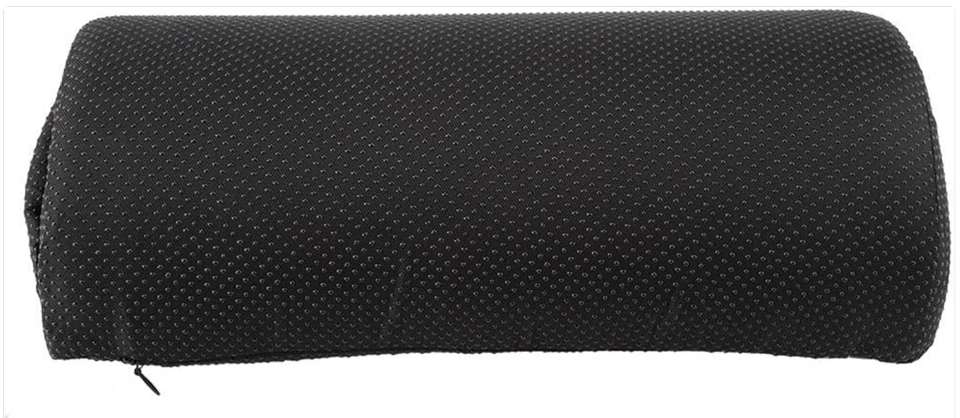
Image: Top view of the Aramox Foot Rest Cushion, showcasing its black, textured surface and ergonomic shape.

The Aramox Foot Rest Cushion is a versatile support pillow made from high-density sponge and covered with durable polyester fabric. Its ergonomic, dome-shaped design is intended to distribute weight evenly, providing comfort and promoting better posture.