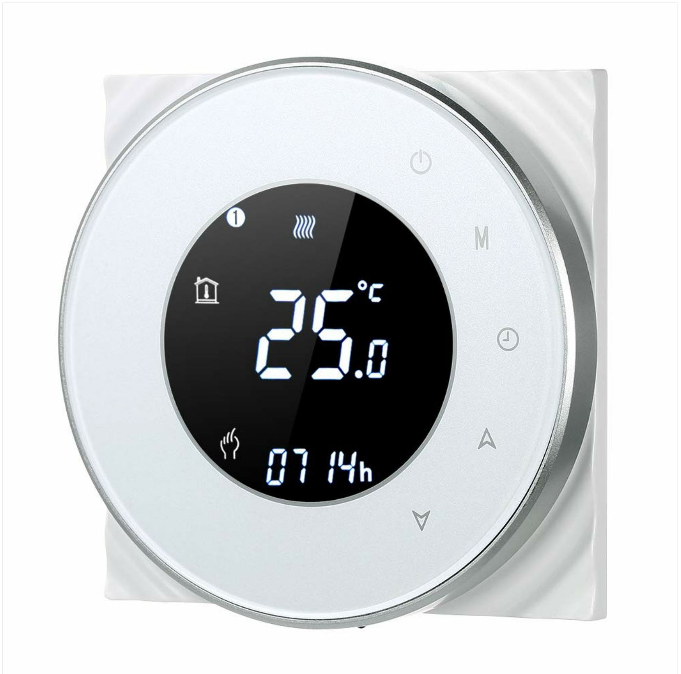
Figure 1: Decdeal Wi-Fi Programmable Smart Thermostat (White Model)