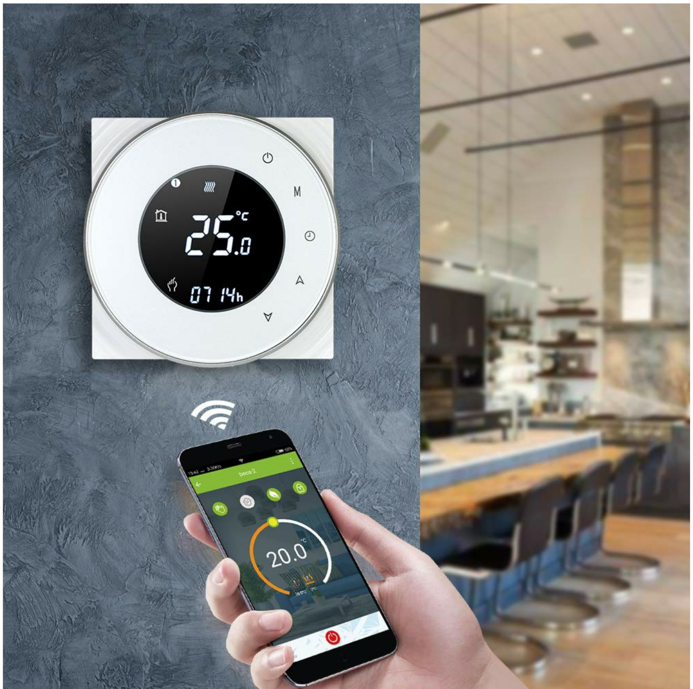
Figure 8: App Control Interface