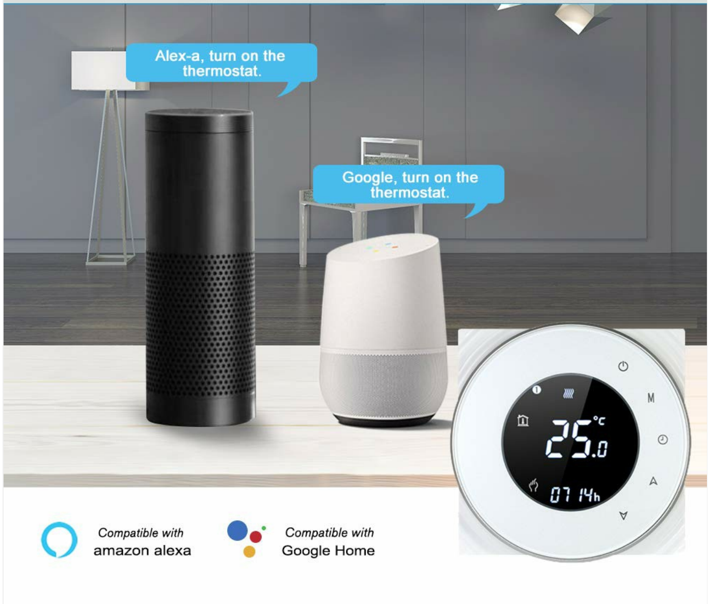
Figure 4: Voice Control Functionality

compatible with Amazon Echo/Google Home/Tmall Genie/IFTTT.