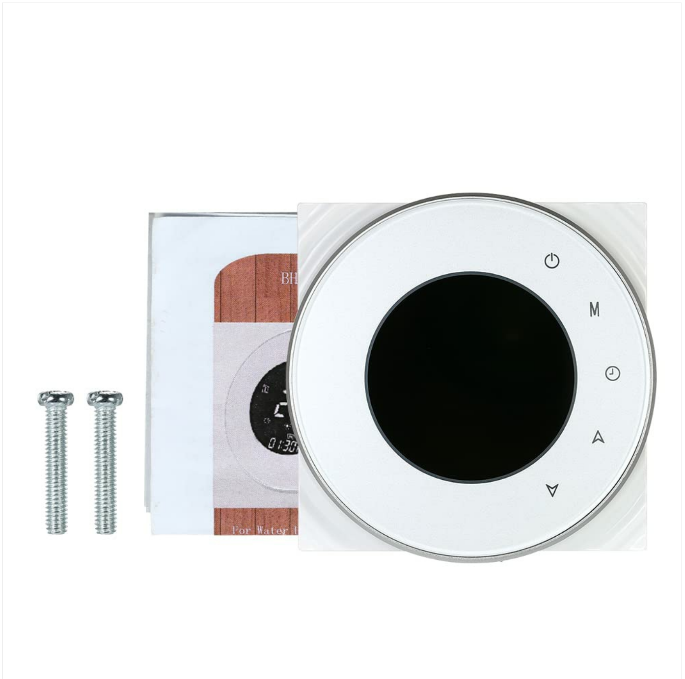
Figure 5: Package Contents