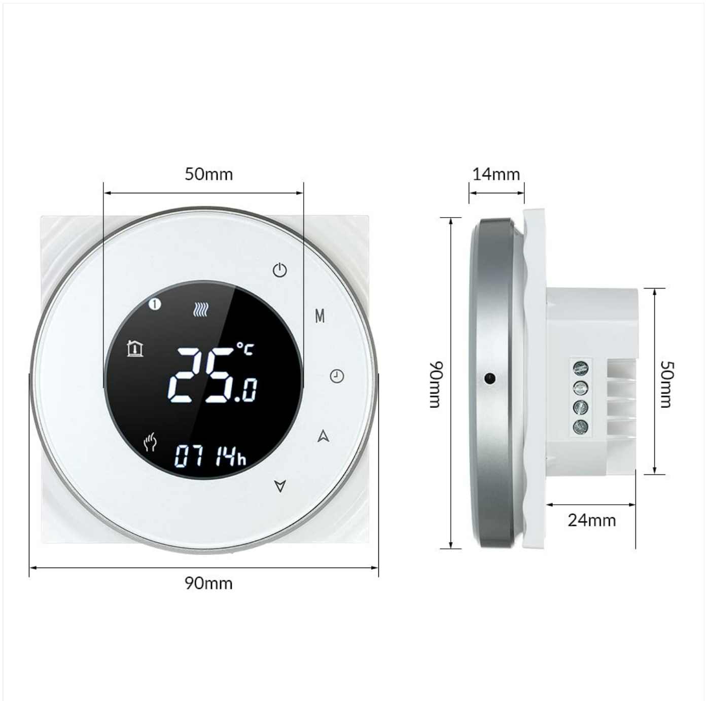
Figure 6: Product Dimensions