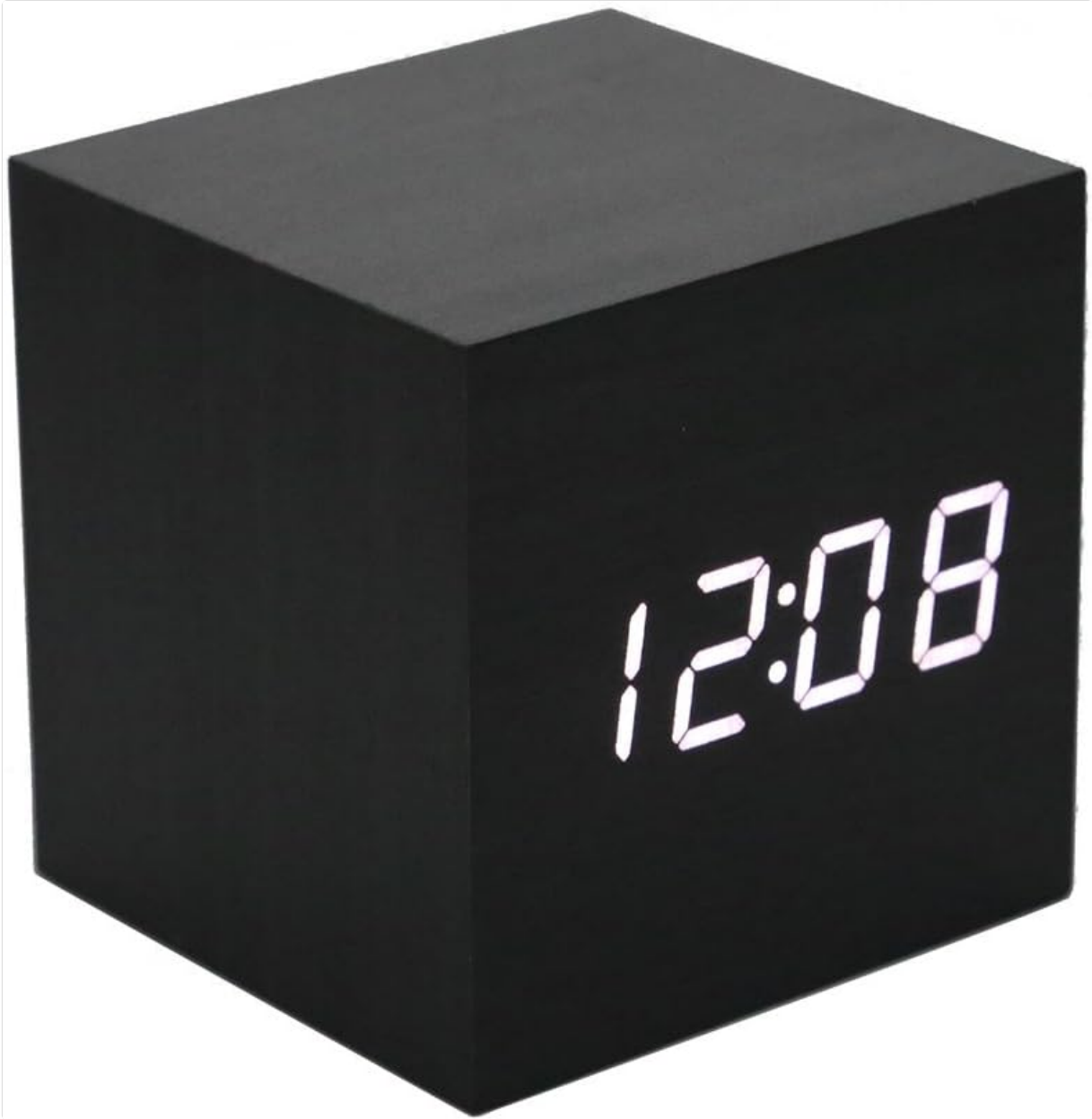
Image 1.1: Front view of the Lancoon Wooden Alarm Clock displaying the time.