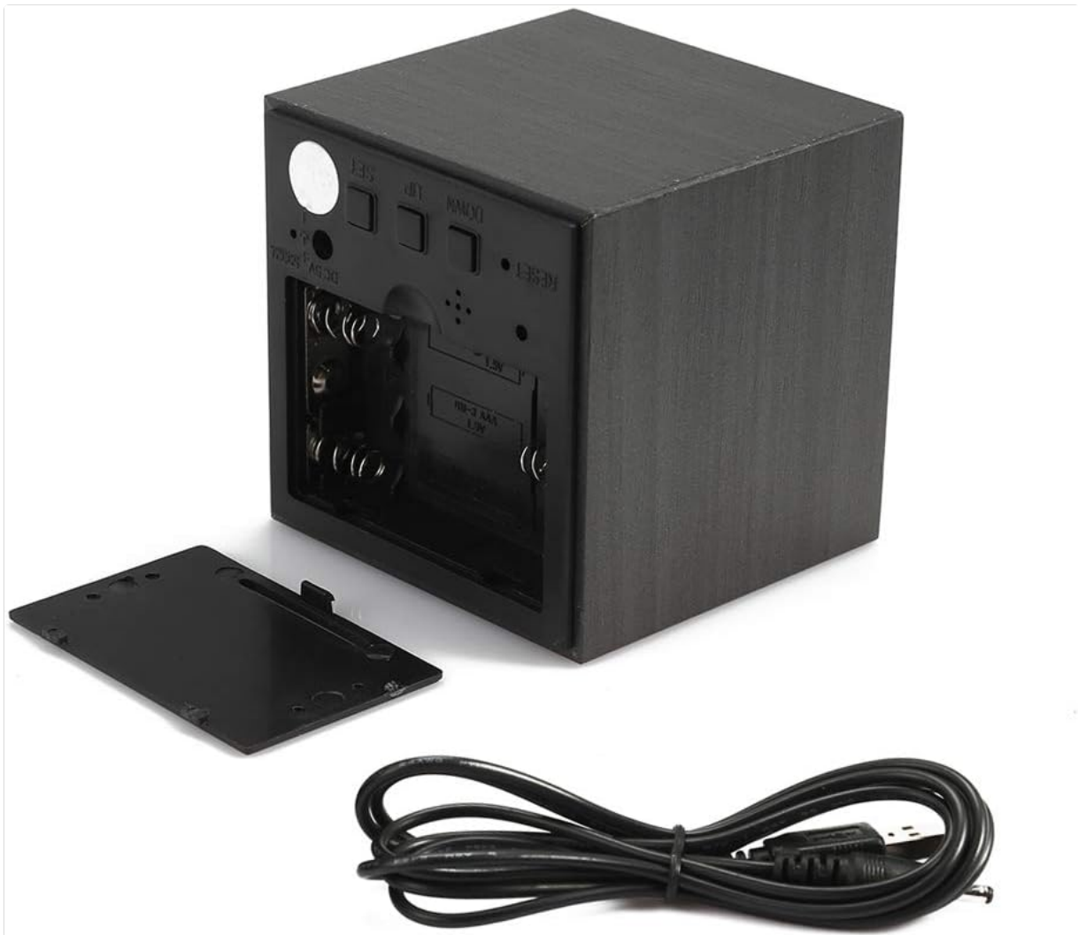
Image 4.1: Rear view of the alarm clock, highlighting the battery compartment, USB power input, and control buttons.