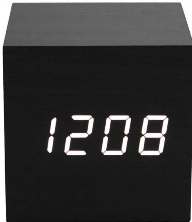
Image 2.1: The alarm clock displaying time, accompanied by icons representing its various functions.