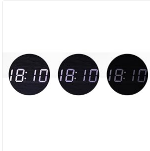
Image 6.1: Examples of time, date, and temperature displays on the clock.