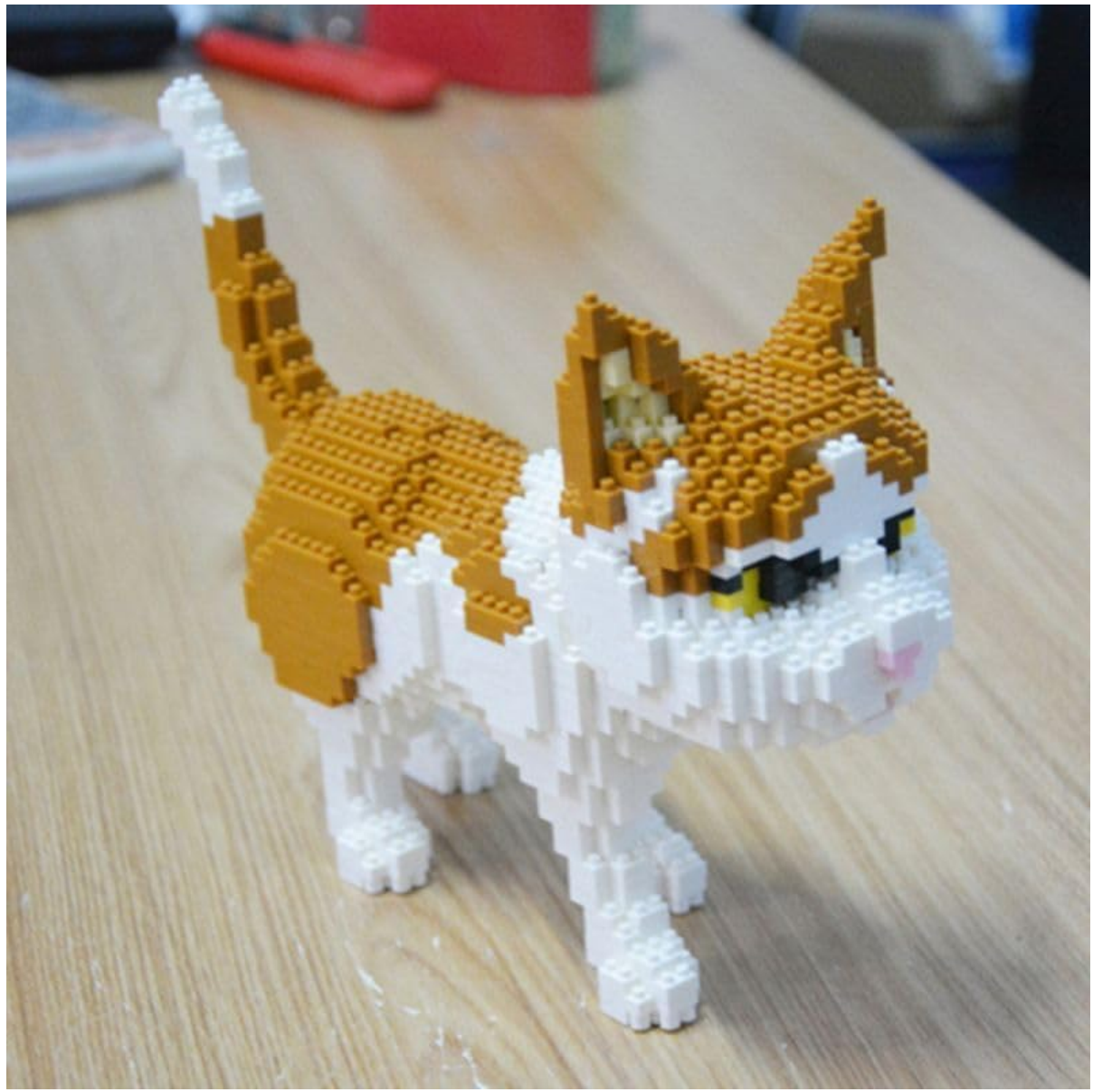
Figure 4.4: Side view of the assembled cat.