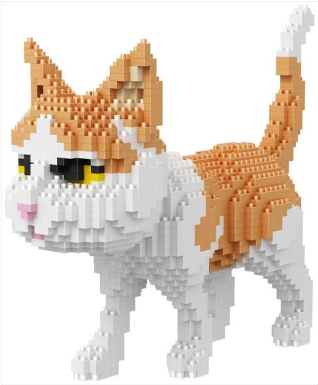
Figure 4.2: Assembled Standing Cat with dimensions.