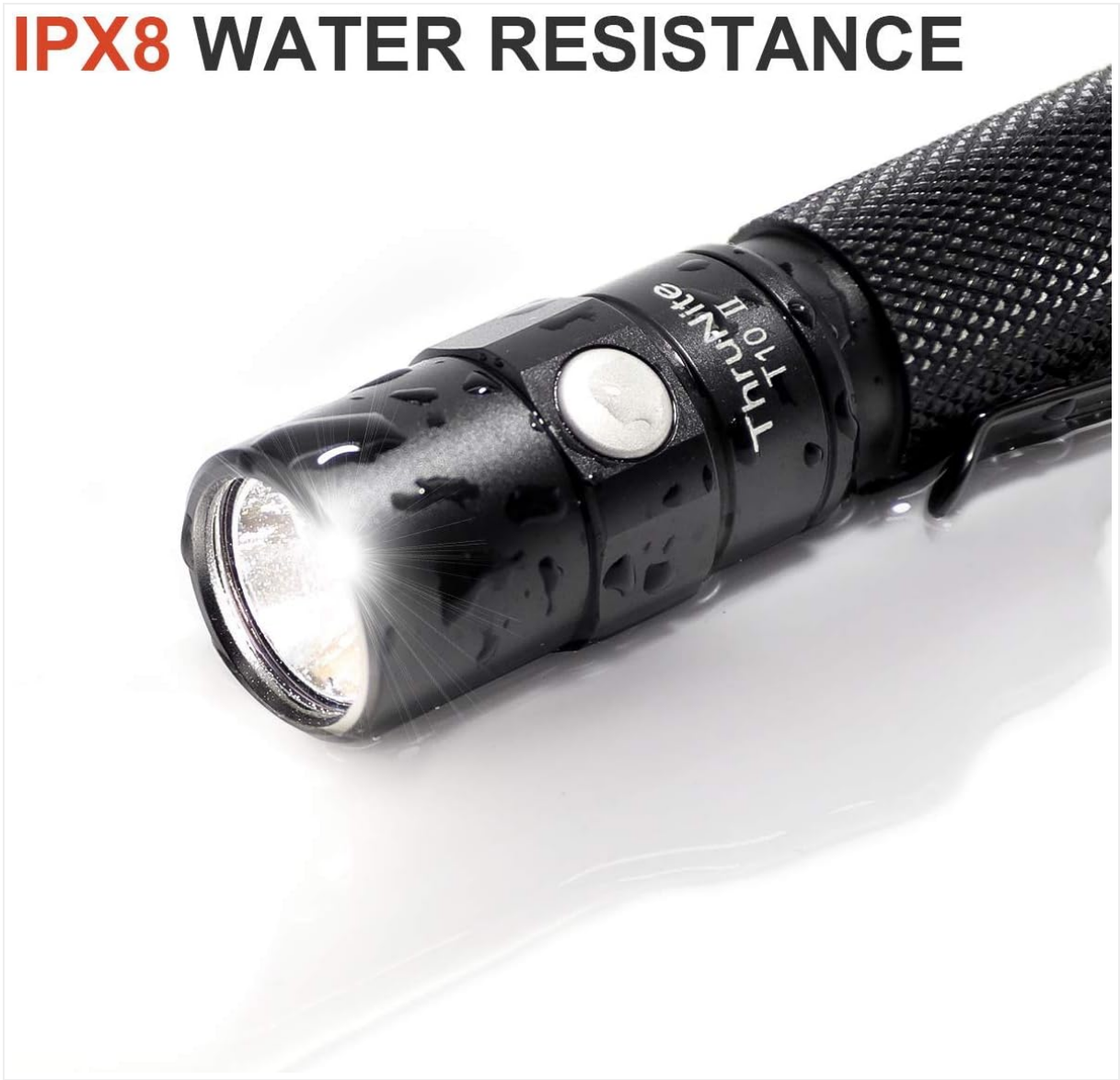
Image 6: The ThruNite T10 II demonstrating its IPX8 water resistance.