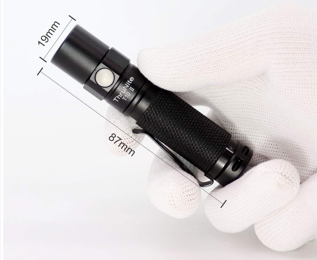
Image 5: The compact size of the ThruNite T10 II, showing its 87mm length and 19mm head diameter.