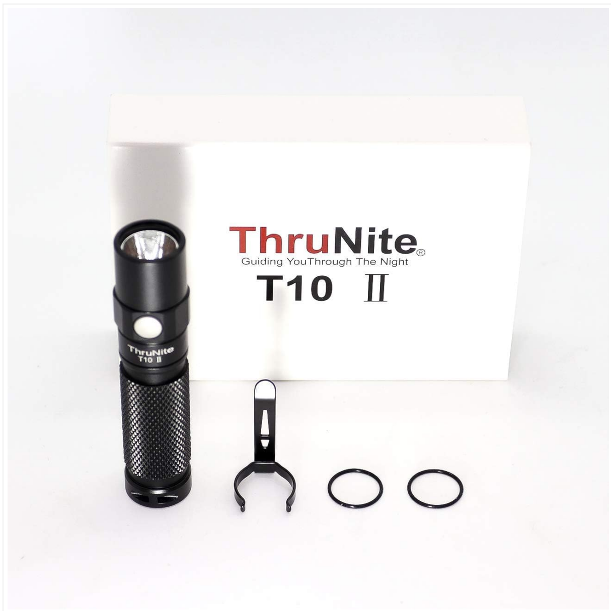
Image 2: Contents of the ThruNite T10 II package, including the flashlight, spare O-rings, and pocket clip.