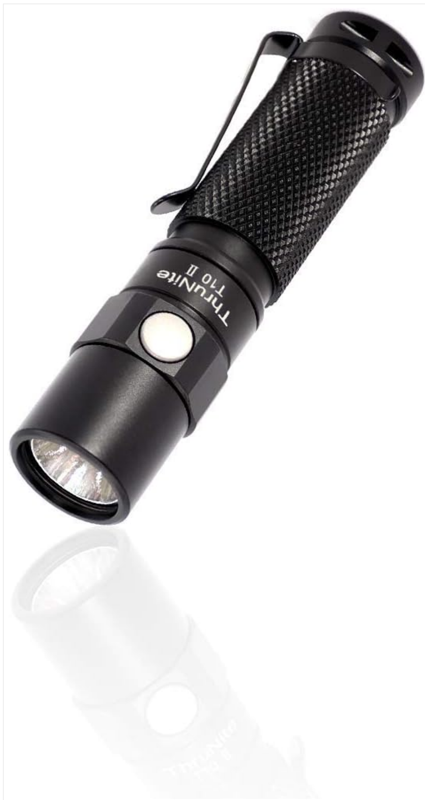
Image 1: ThruNite T10 II EDC Flashlight, showcasing its compact design and side switch.