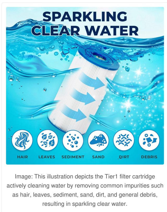
Image: This illustration depicts the Tier1 filter cartridge actively cleaning water by removing common impurities such as hair, leaves, sediment, sand, dirt, and general debris, resulting in sparkling clear water.