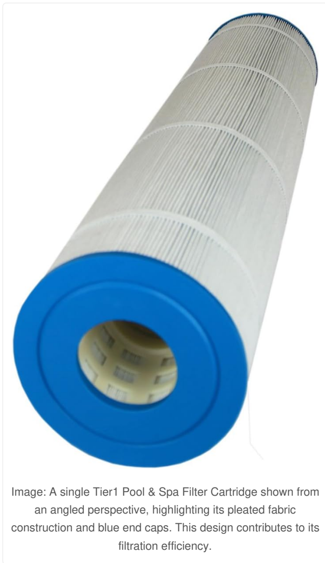
Image: A single Tier1 Pool & Spa Filter Cartridge shown from an angled perspective, highlighting its pleated fabric construction and blue end caps. This design contributes to its filtration efficiency.

The filter's durable and washable 137 sq ft fabric is engineered with tight porosity and a dense weave to effectively sift out unwanted hair, leaves, dust, sediment, and sand. Its high-strength, high-flow design ensures optimal performance with less wear and tear on your pump.