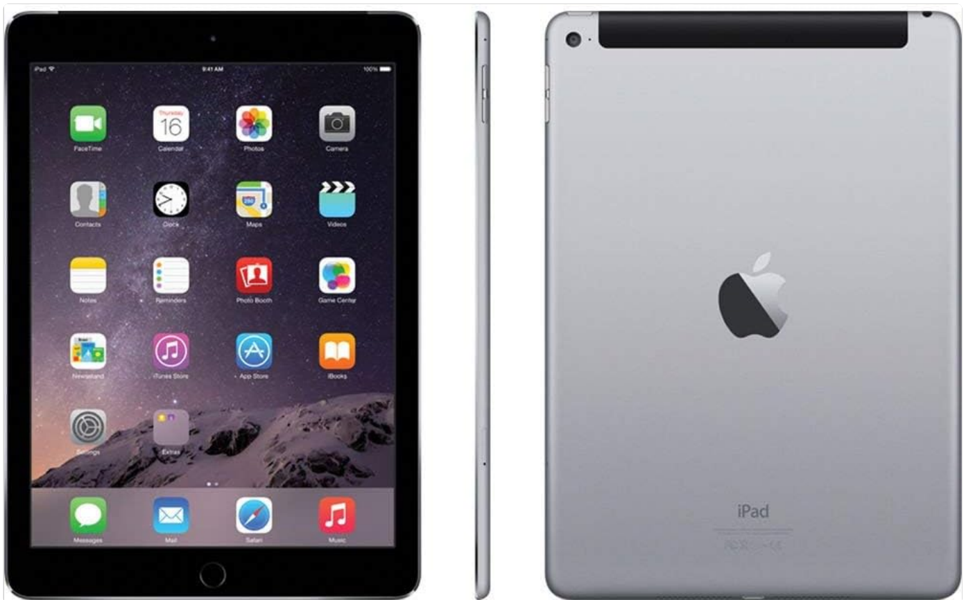
Figure 3: A comprehensive view of the Apple iPad Air 2, illustrating its front, back, and thin side profile.