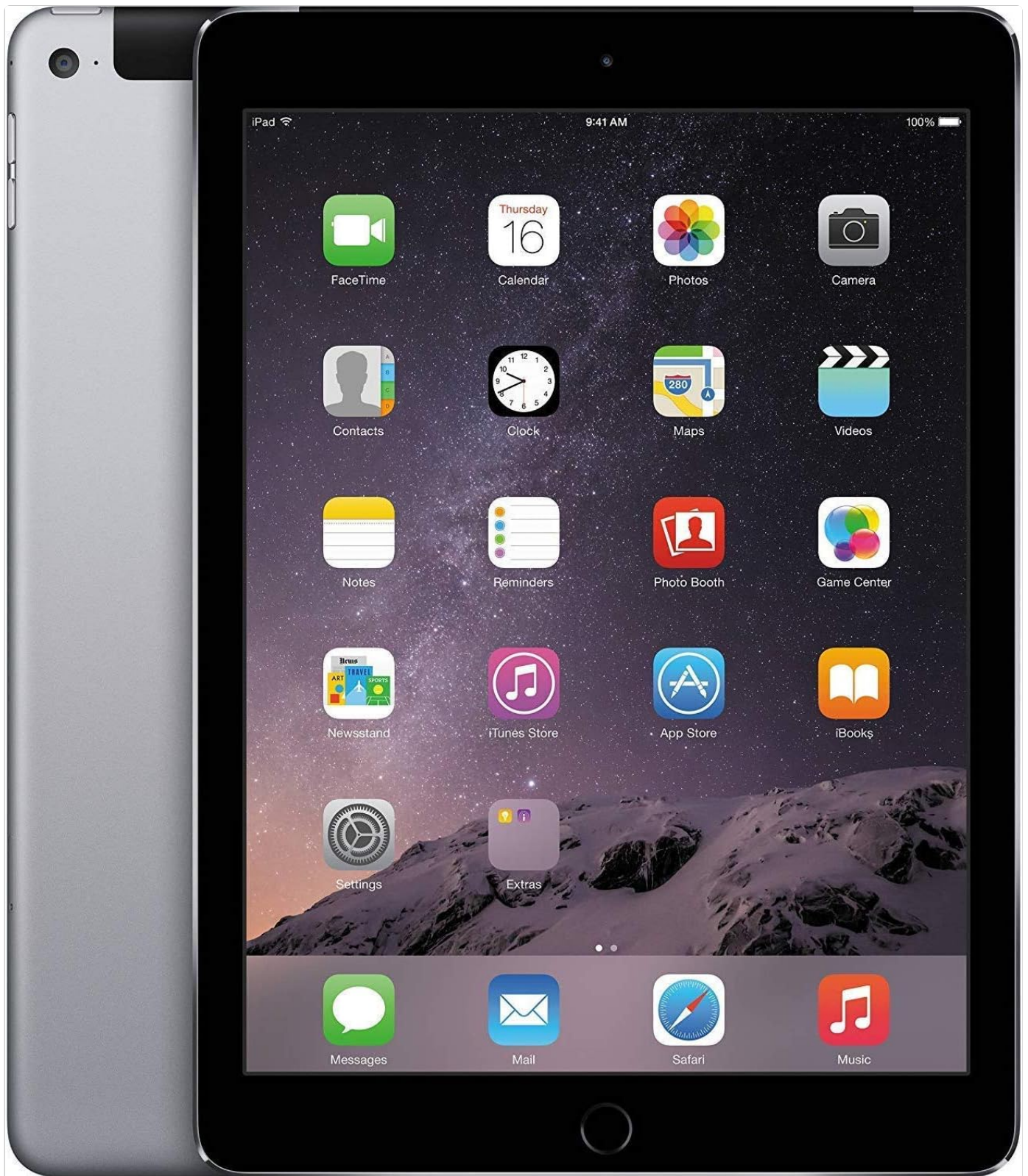
Figure 1: Front view of the Apple iPad Air 2 displaying the home screen with various application icons.