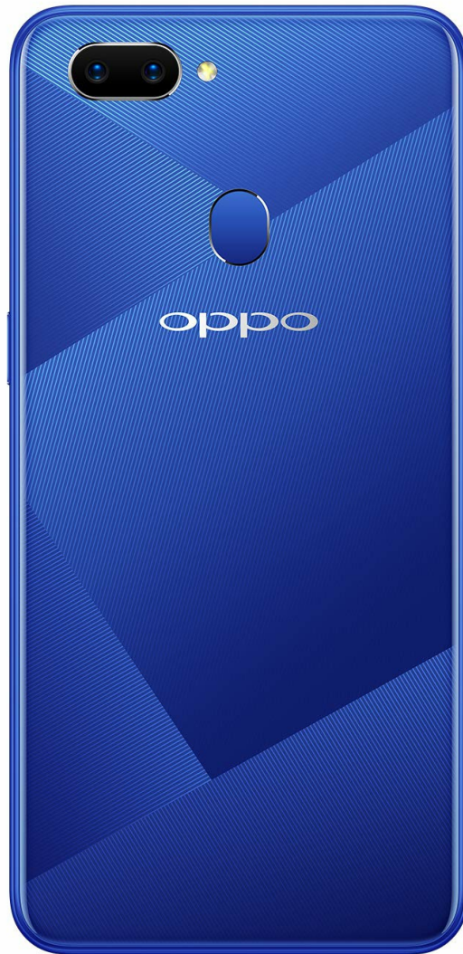
Image: Back view of the OPPO A5, displaying the dual camera module and the circular fingerprint sensor.

The OPPO A5 is equipped with a 13MP+2MP primary camera and an 8MP front-facing camera. Open the Camera app to capture photos and videos. Features include AI face beauty, gender detection, AR stickers, face beauty video, camera filters, and HDR.