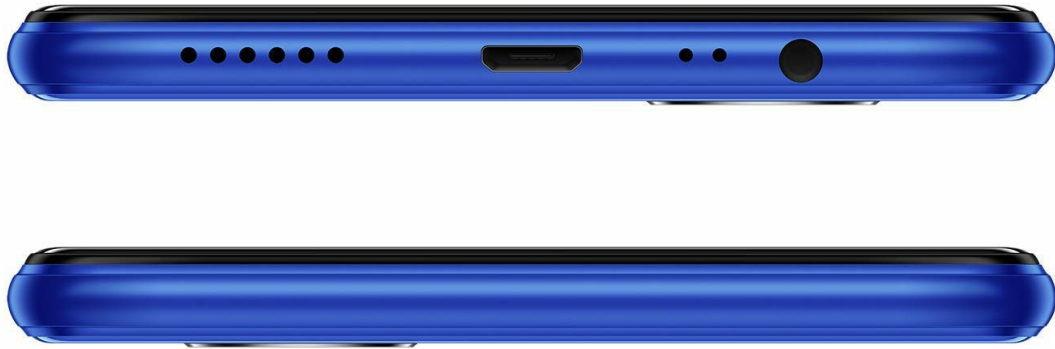
Image: Bottom view of the OPPO A5, highlighting the microUSB charging port, speaker grille, and microphone.