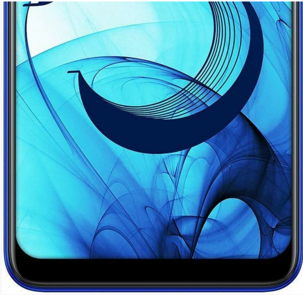
Image: Front view of the OPPO A5 smartphone, showcasing its display.