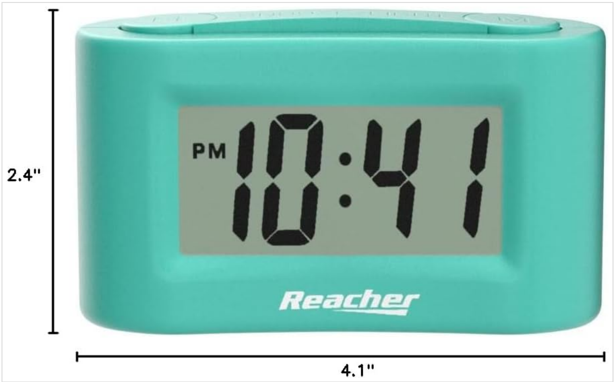
Figure 6: Image illustrating the compact dimensions of the alarm clock.