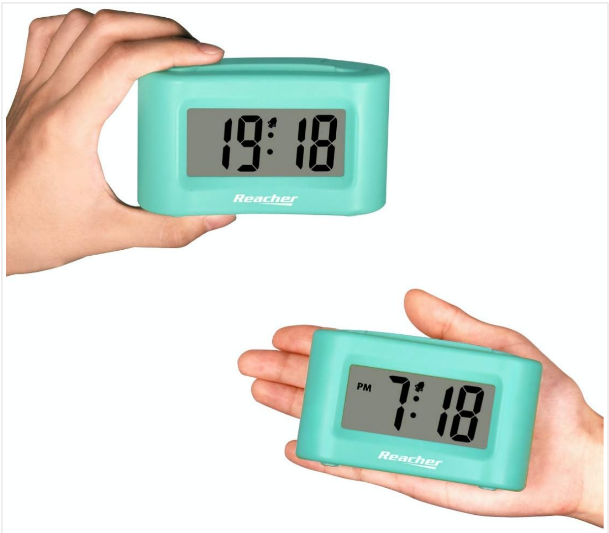
Figure 1: Front view of the REACHER Mini Battery Operated Alarm Clock, showing the digital display and compact size.