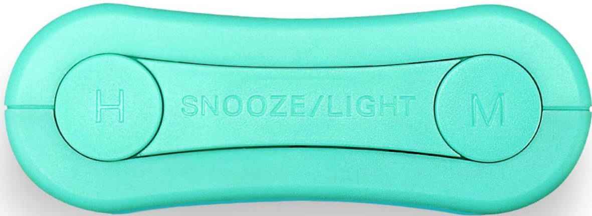
Figure 2: Top view of the clock, highlighting the 'H' (Hour), 'SNOOZE/LIGHT', and 'M' (Minute) buttons.