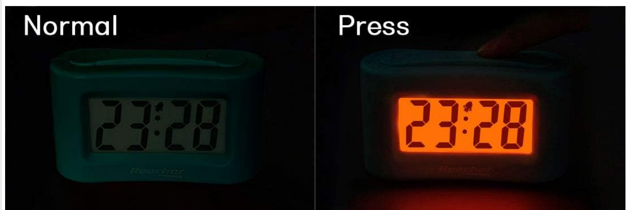
Figure 4: The clock display with its backlight activated for improved visibility in low light conditions.