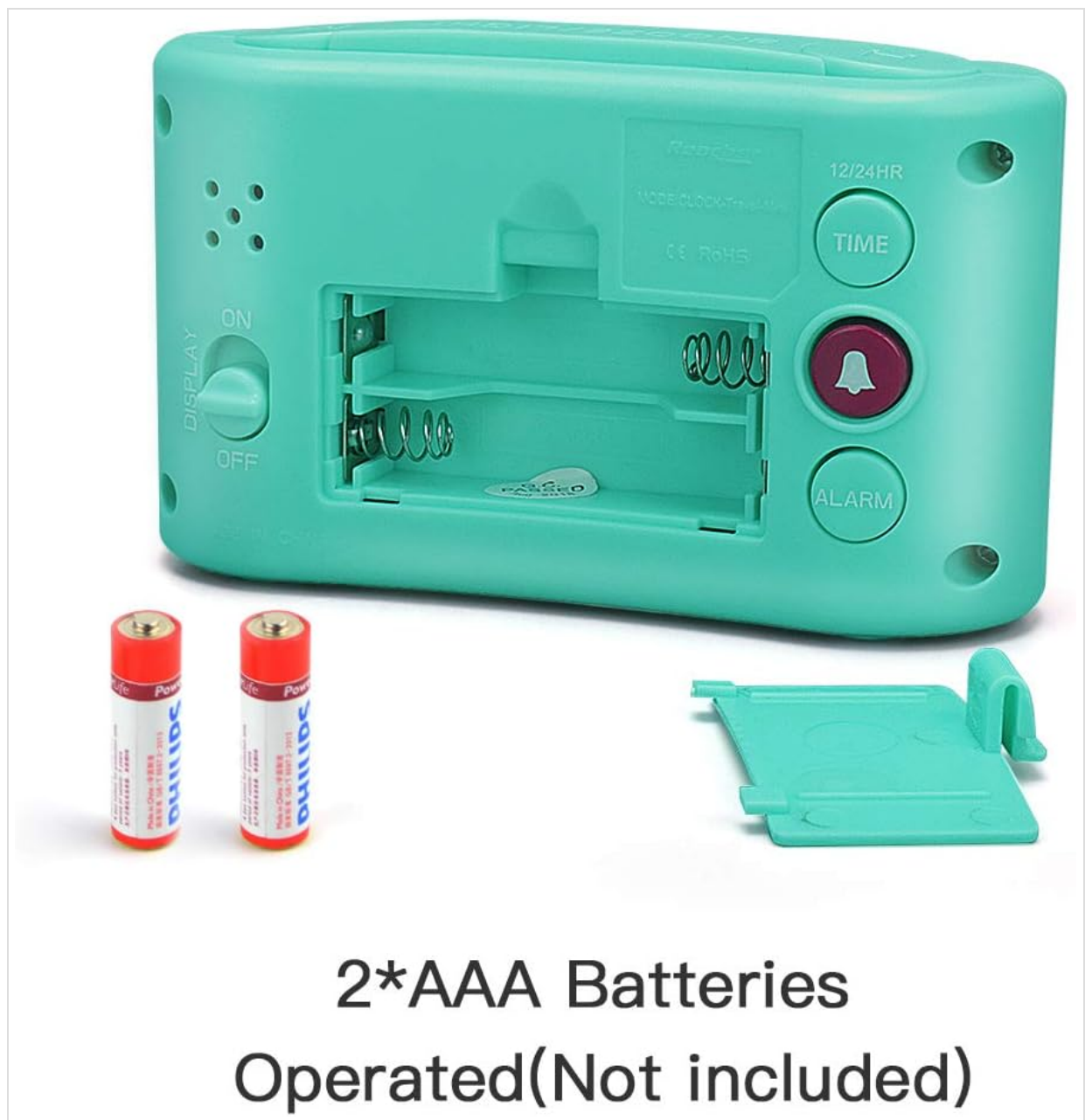
Figure 3: Rear view of the clock, showing the battery compartment and various setting buttons.