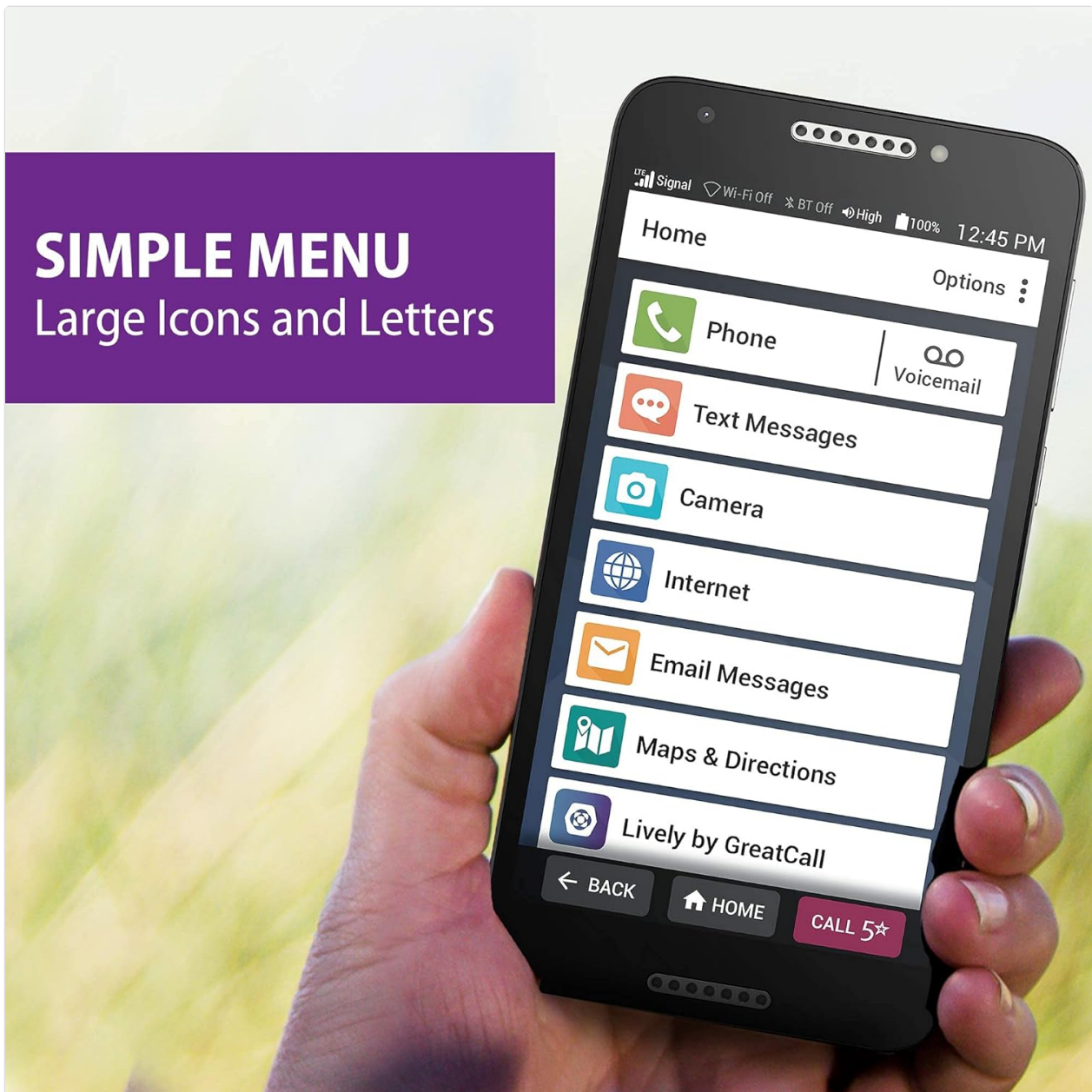
Image: The Jitterbug Smart2's home screen showing its simple menu with large, easy-to-read icons and text for core functions.

The Jitterbug Smart2 features a simplified menu with large icons and letters, making navigation straightforward. The home screen displays essential functions like Phone, Text Messages, Camera, Internet, Email Messages, and Maps & Directions. Tap on an icon to open the corresponding application.