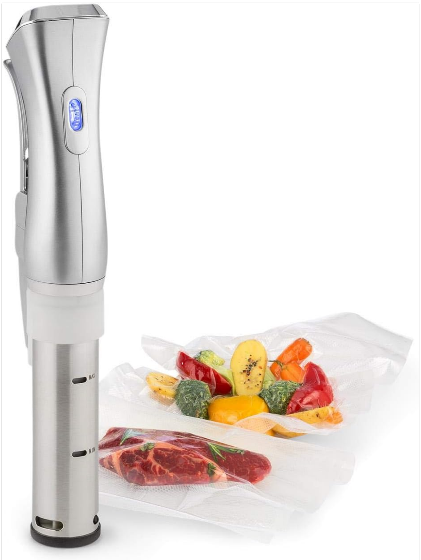
Image: The Klarstein Quickstick Sous Vide Cooker shown alongside vacuum-sealed bags of meat and vegetables, illustrating its primary use.