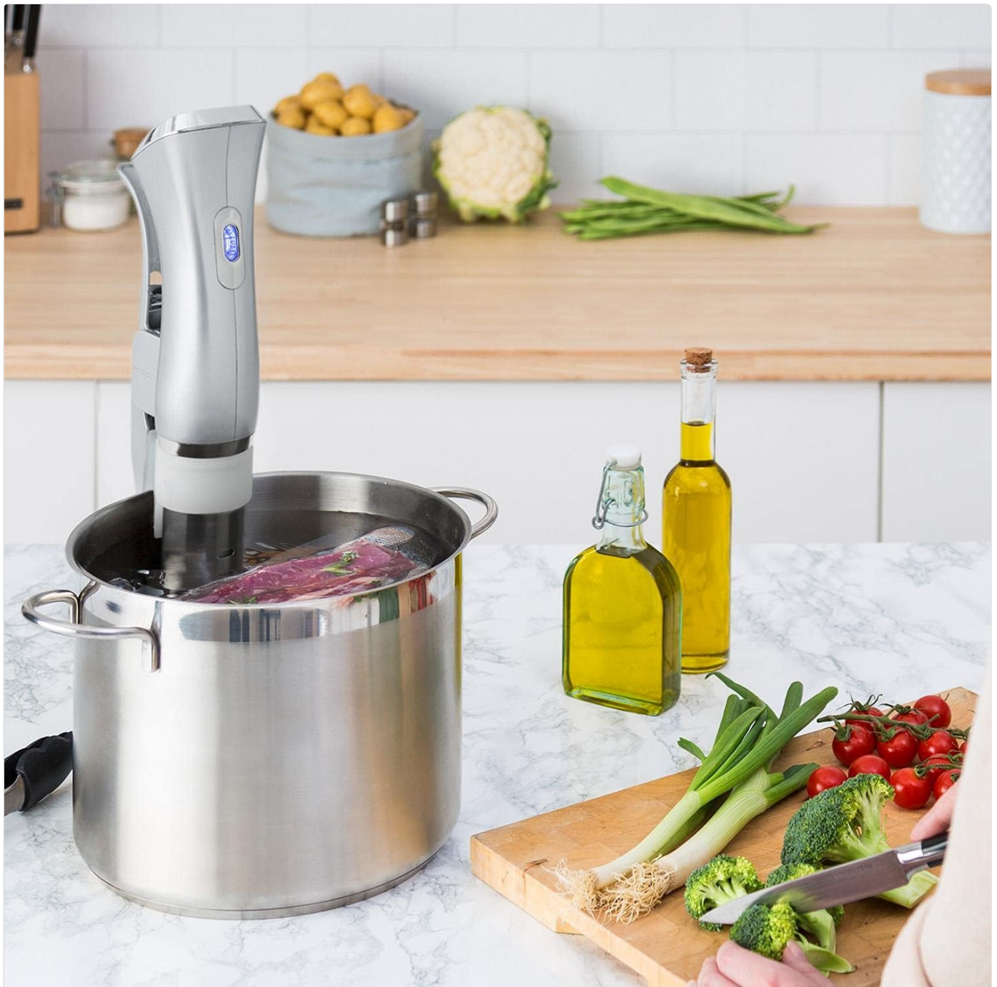
Image: The Klarstein Quickstick Sous Vide Cooker immersed in a pot of water, with vacuum-sealed food cooking, demonstrating a typical setup in a kitchen environment.