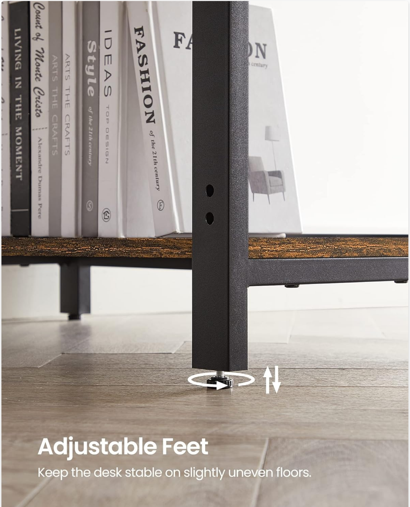
An image focusing on the adjustable feet located at the base of the desk legs. These feet allow for leveling the desk on uneven floors and protect the floor from scratches.