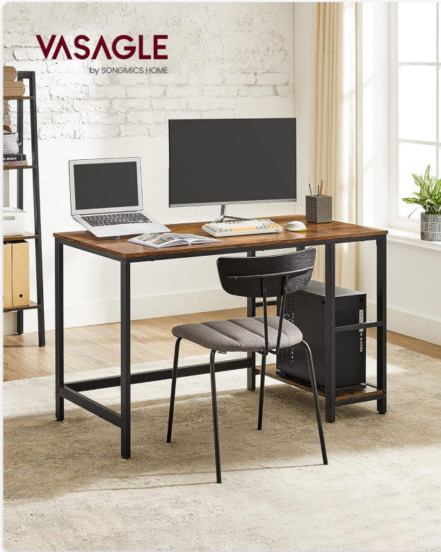
The VASAGLE ALINRU Computer Desk positioned in a home office, featuring a laptop, monitor, and a chair. The shelves are configured on the right side, holding a computer tower and other items.