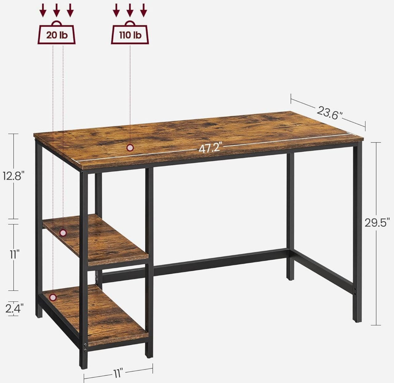
A diagram illustrating the key dimensions of the desk: 47.2 inches wide, 23.6 inches deep, and 29.5 inches high. It also indicates the weight capacity for the desktop (110 lb) and shelves (20 lb each).