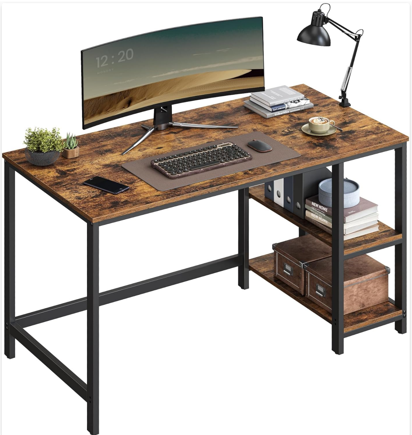
An overview of the VASAGLE ALINRU Computer Desk, showcasing its spacious desktop, integrated shelves, and industrial design. The desk is set up with a computer monitor, keyboard, mouse, and various office items.