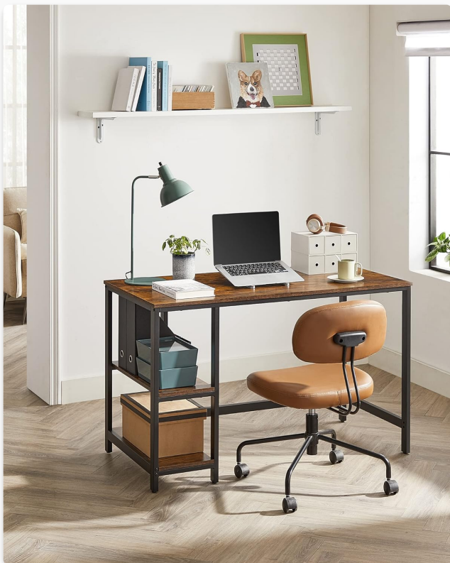
The VASAGLE ALINRU Computer Desk arranged in a contemporary office space, with the storage shelves positioned on the left side, holding office organizers and a laptop on the desktop.