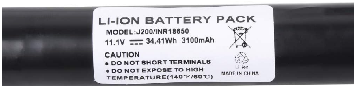
Image: Close-up of the battery label showing model number, voltage, capacity, and caution warnings.