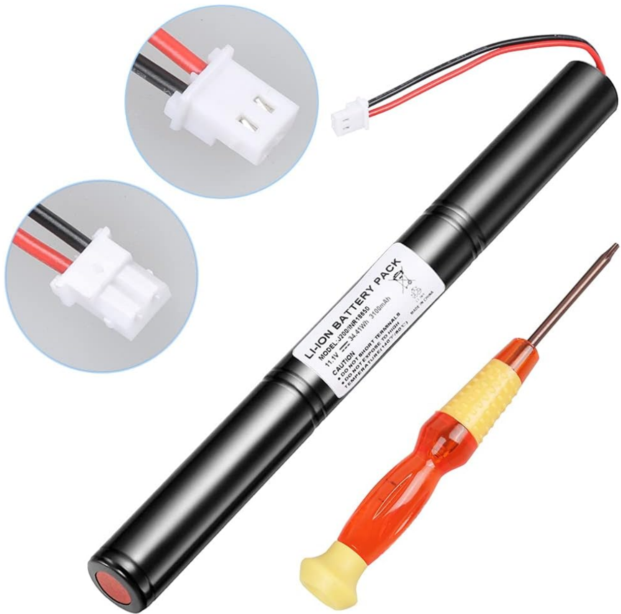
Image: Kratax replacement battery and included screwdriver tool.