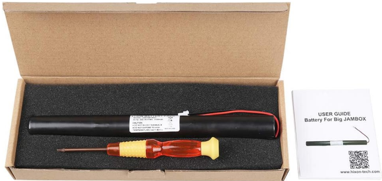
Image: The Kratax replacement battery, screwdriver, and a user guide as packaged.