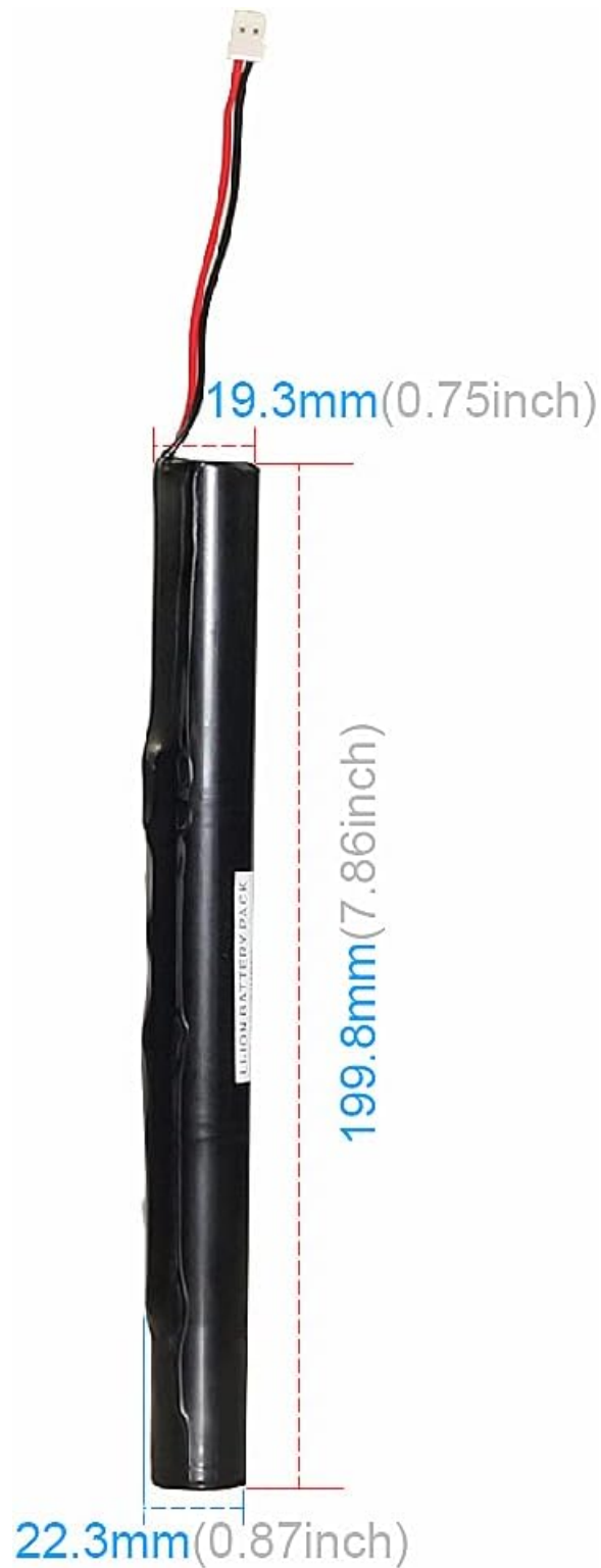
Image: Diagram illustrating the physical dimensions of the Kratax replacement battery.