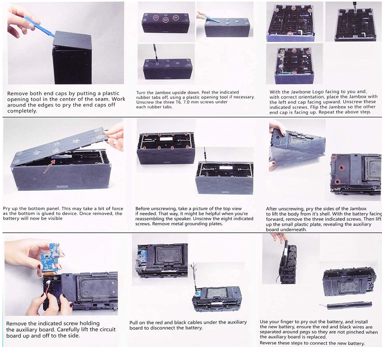
Image: Visual guide illustrating the battery replacement process for the Jawbone Big Jambox speaker.