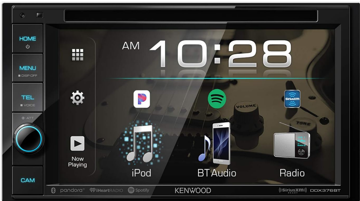
Figure 2.1: Front view of the Kenwood DDX376BT unit, showing the main menu with icons for iPod, BT Audio, and Radio, along with the current time.