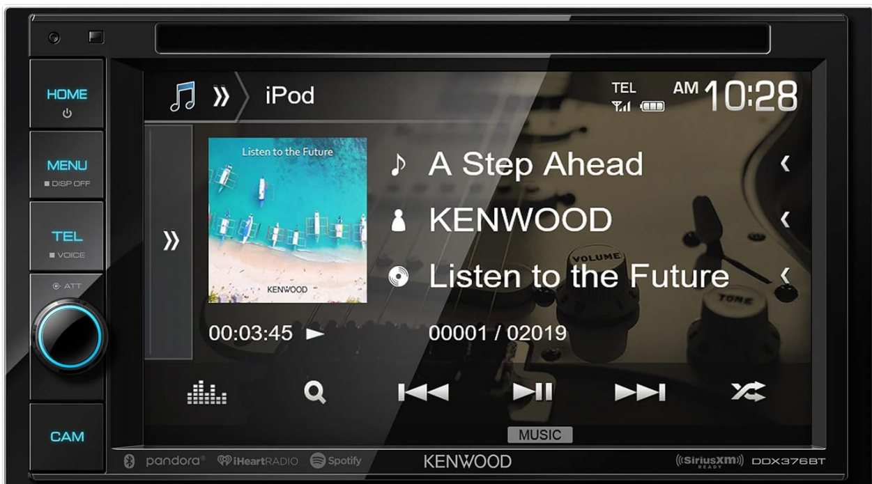
Figure 5.1: The Kenwood DDX376BT screen showing the interface for iPod music playback, including album art and track information.

Connect your iPod or iPhone via USB. The unit will recognize the device and allow you to browse and play music directly from the touch screen. For certain apps, Bluetooth connection may also be used.