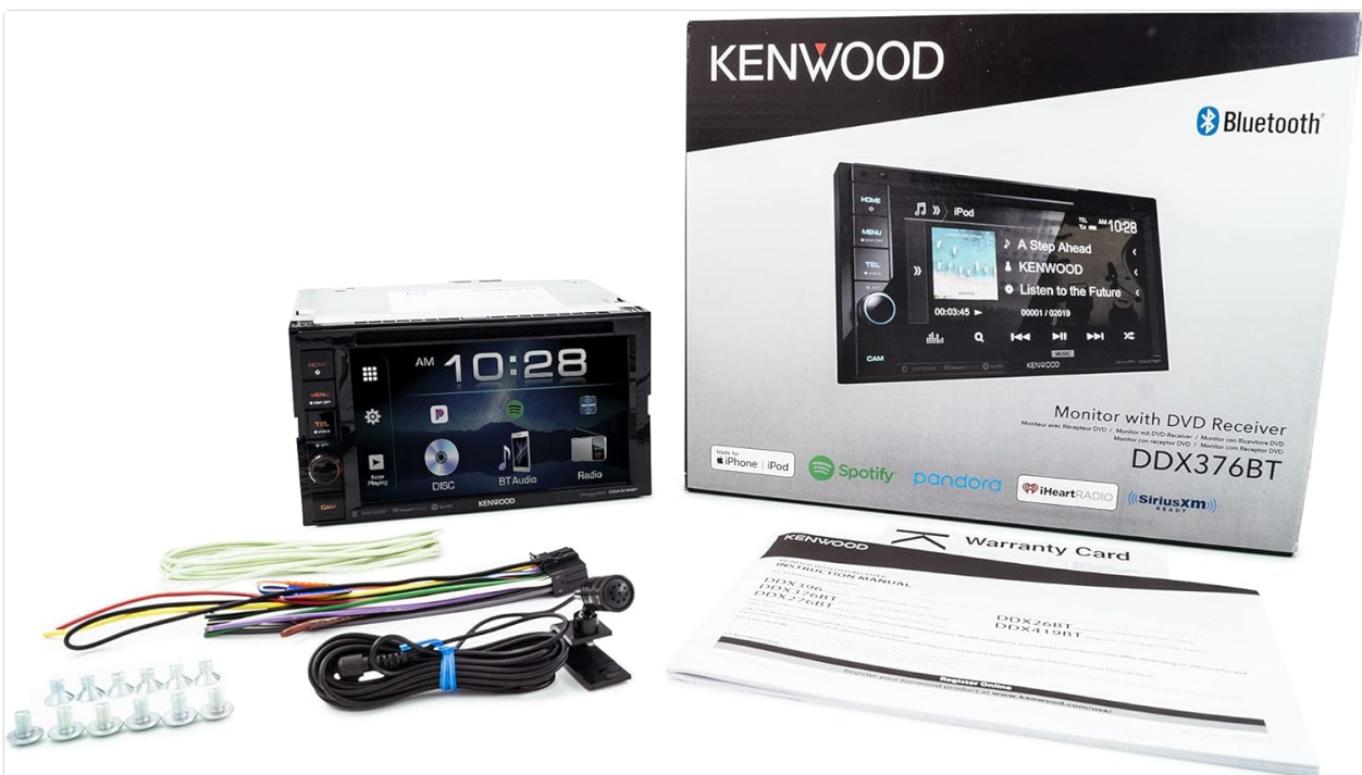
Figure 3.1: The package includes the Kenwood DDX376BT head unit, wiring harness, external microphone, mounting screws, and the instruction manual.

Before installation, verify that all components are present: