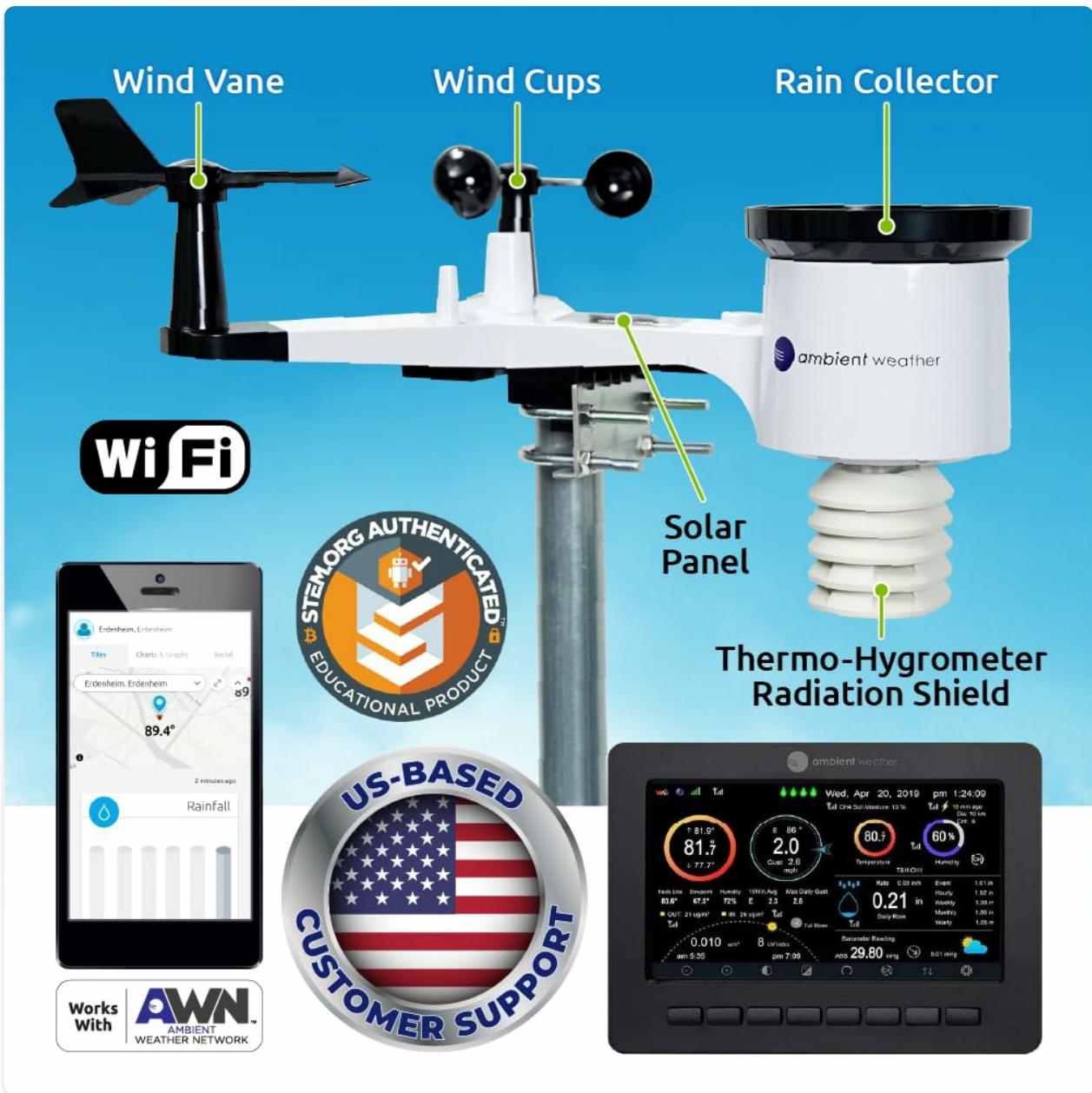
Figure 2.1: Key components of the integrated sensor array, including the wind vane, wind cups, rain collector, solar panel, and thermo-hygrometer radiation shield.