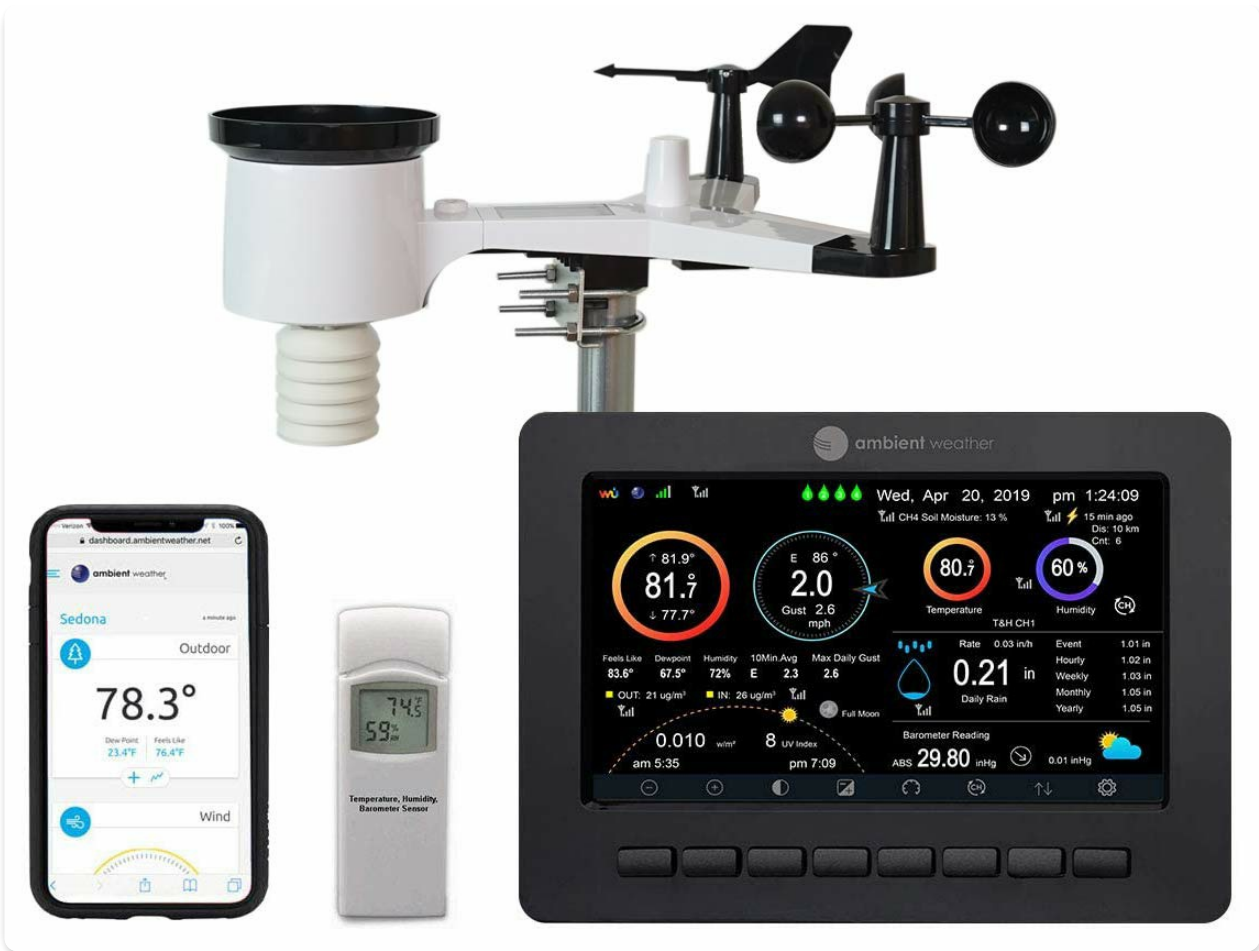
Figure 1.1: Ambient Weather WS-2000 Smart Weather Station components including the console, integrated sensor array, and a mobile application interface.