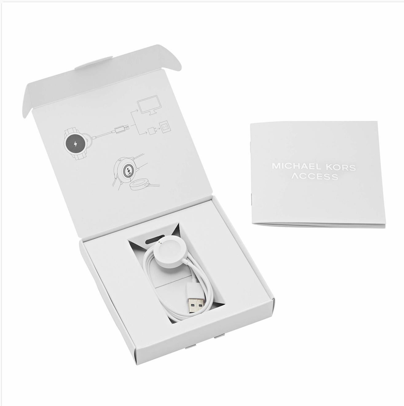
Image: The Michael Kors Access Smartwatch Charger neatly packaged in its white box, alongside a small instruction booklet.