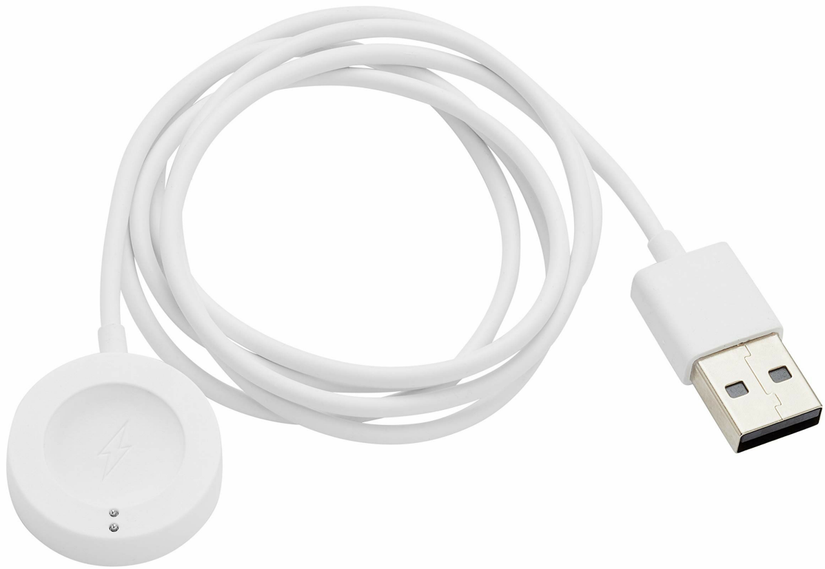
Image: The Michael Kors Access Smartwatch Charger, featuring a white USB cable coiled around a white magnetic charging puck.

The charger features a magnetic puck that securely attaches to the back of your smartwatch, ensuring proper alignment for charging. The USB connector allows for versatile power source options.