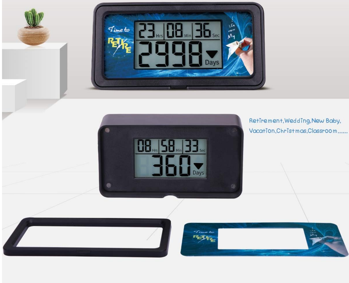
Figure 6: The timer with its removable frame and various background card options.