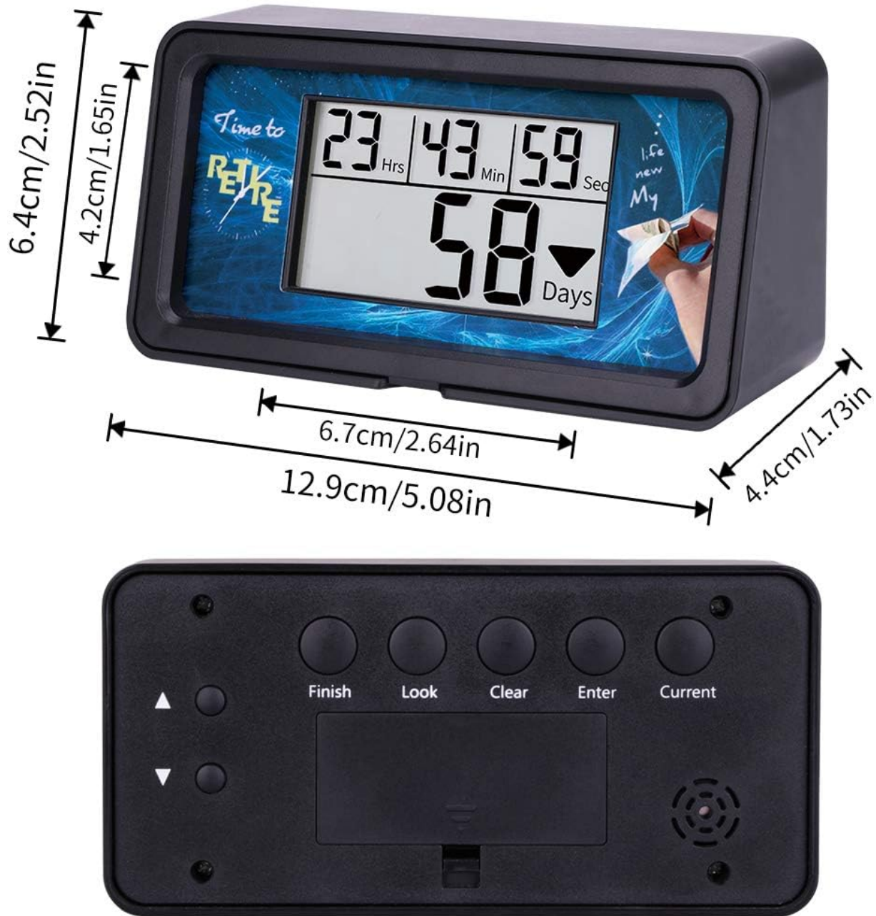
Figure 2: Back view showing control buttons (Finish, Look, Clear, Enter, Current) and dimensions.