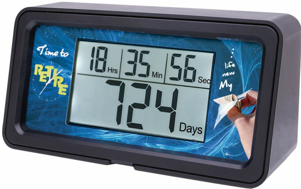
Figure 1: Front view of the AIMILAR Digital Countdown Timer.