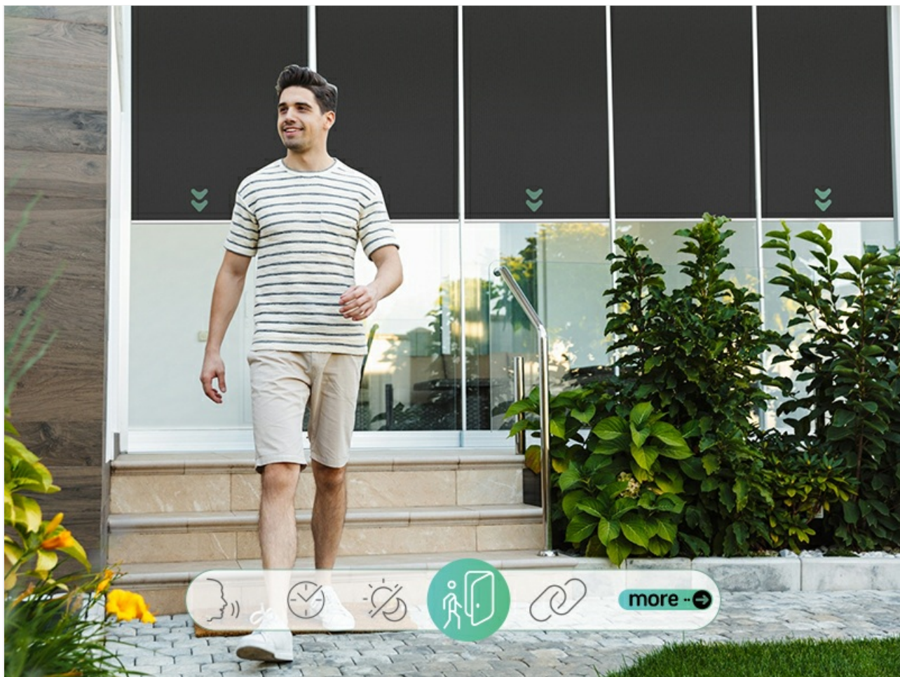
Image: A user operating Yoolax motorized blinds with the Lightwirl remote control, highlighting its multi-blind control and precise adjustment features.