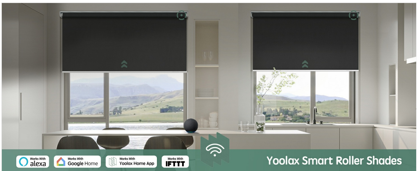
Image: An illustration of Yoolax Smart Roller Shades compatibility with various smart home platforms including Alexa, Google Home, the Yoolax Home App, and IFTTT.