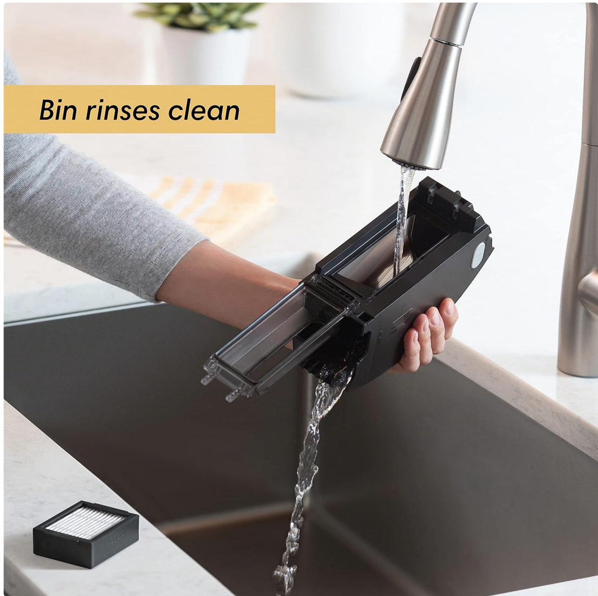
A hand rinsing the Roomba i7's dust bin under a faucet, demonstrating its washable design.