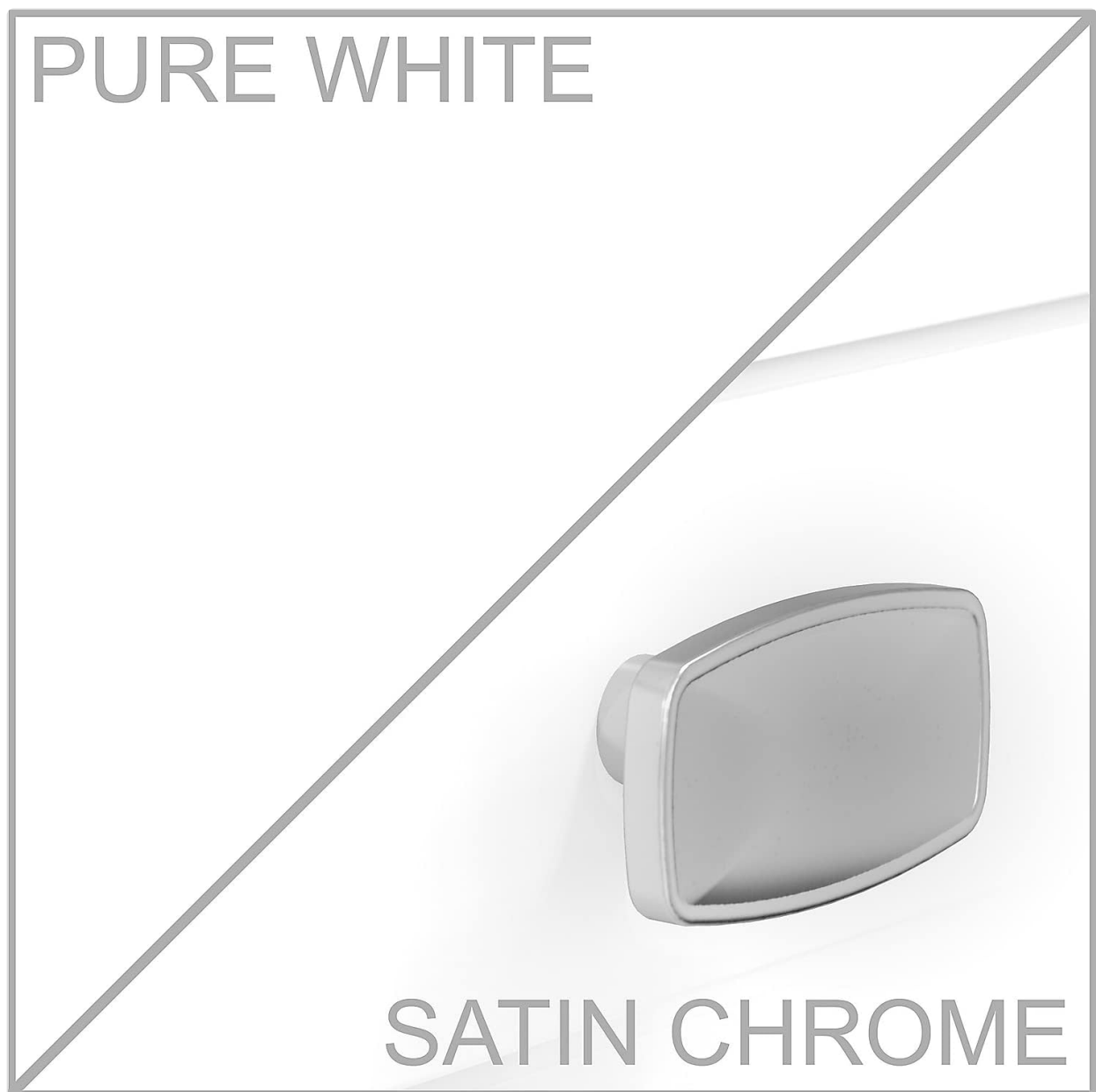
Image 8.2: Visual representation of the Pure White finish and Satin Chrome hardware details.