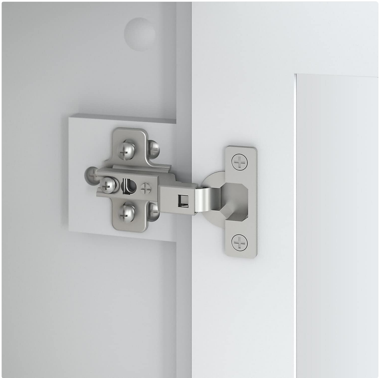
Image 4.1: Detail of the door hinge mechanism, illustrating the hardware used for door attachment.