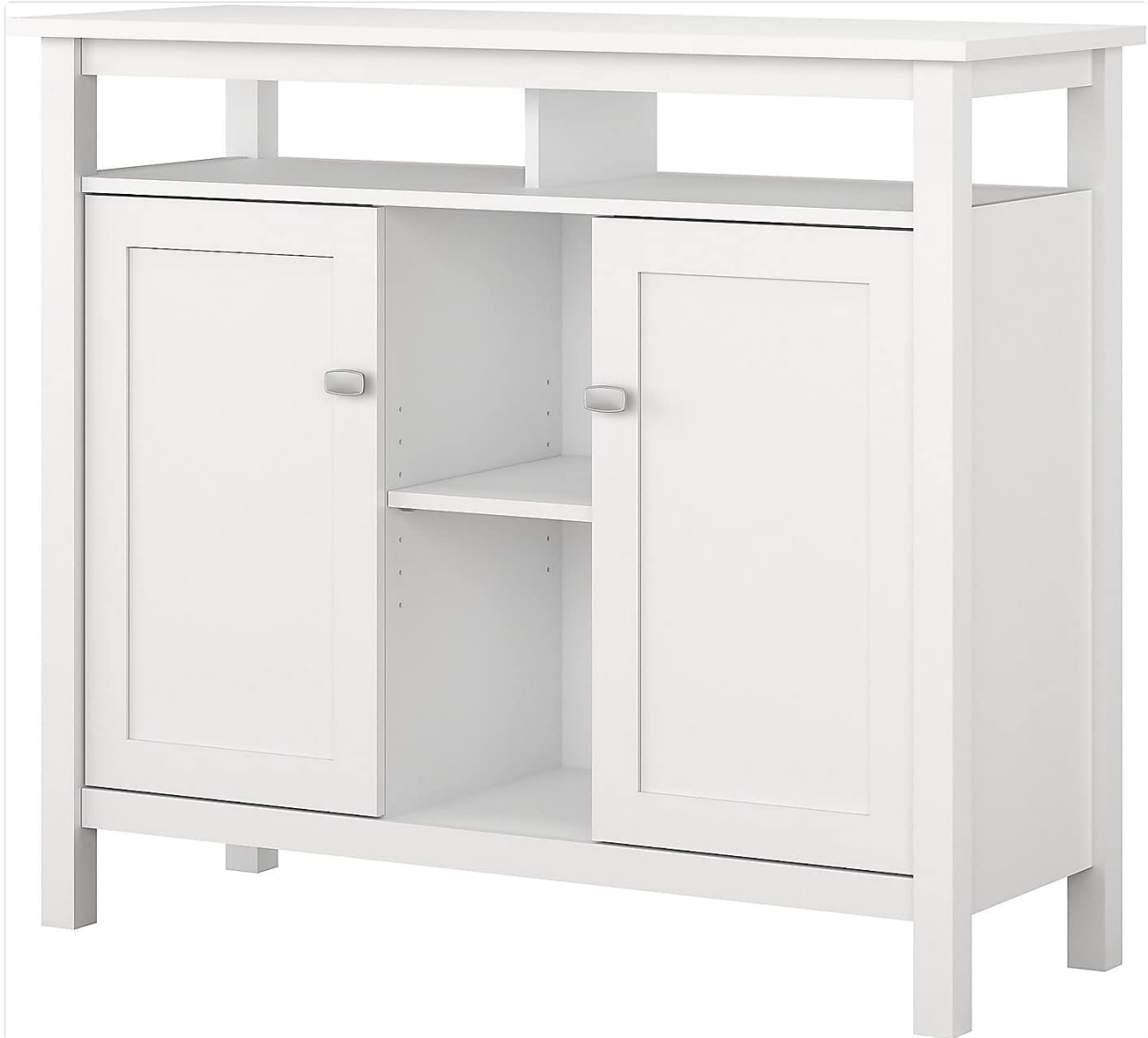
Image 3.1: Front view of the Bush Furniture Broadview Console Table, showcasing its two doors and open shelving.

Before beginning assembly, verify that all parts and hardware listed in the included assembly guide are present. If any items are missing or damaged, contact customer support immediately.