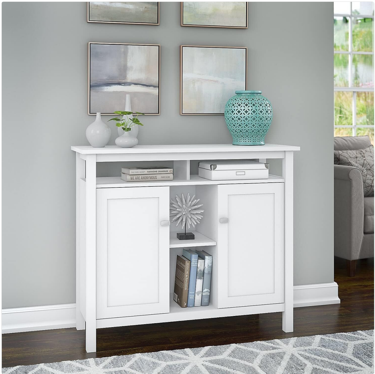
Image 1.1: The Bush Furniture Broadview Console Table with Storage, shown in a living room environment, demonstrating its functional and aesthetic integration.

The Broadview Console Table is designed to offer both style and practical storage solutions for your entryway, living room, or home office. It features closed storage with adjustable shelves, an open center storage area, and a spacious top surface.