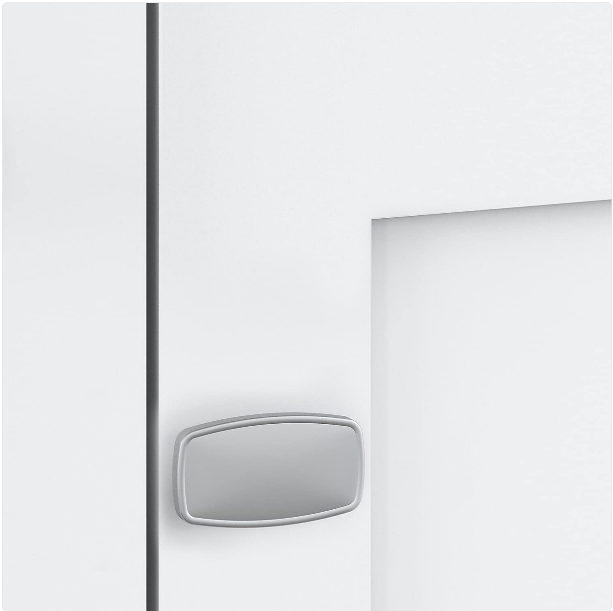
Image 4.2: Close-up of the satin chrome door pull, highlighting the design and finish of the hardware.