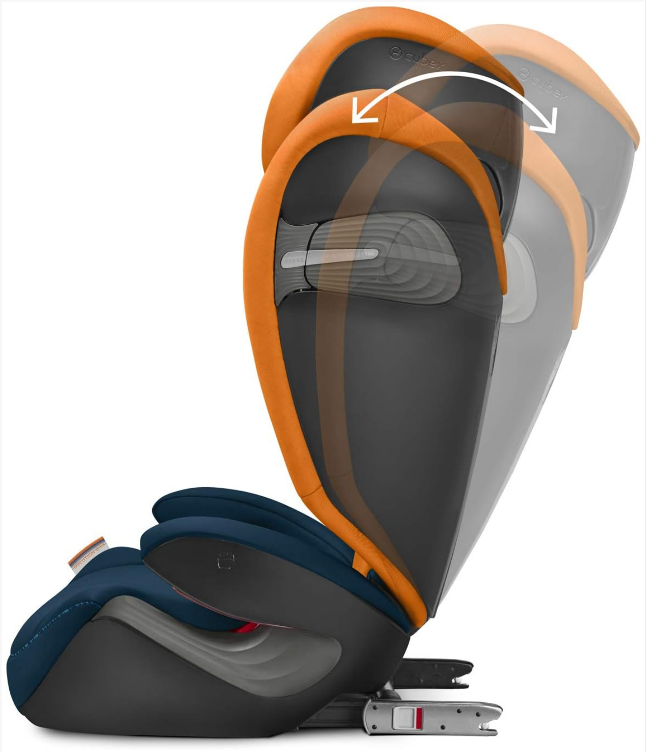
Image: Close-up view of the ISOFIX connectors extended from the car seat base, ready for installation into a vehicle's ISOFIX anchor points.