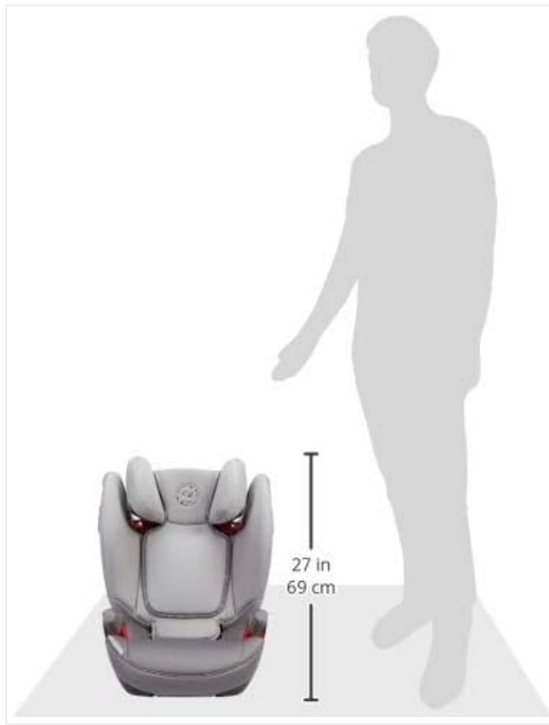
Image: Diagram illustrating the approximate dimensions of the car seat, with a height of 69 cm (27 inches).