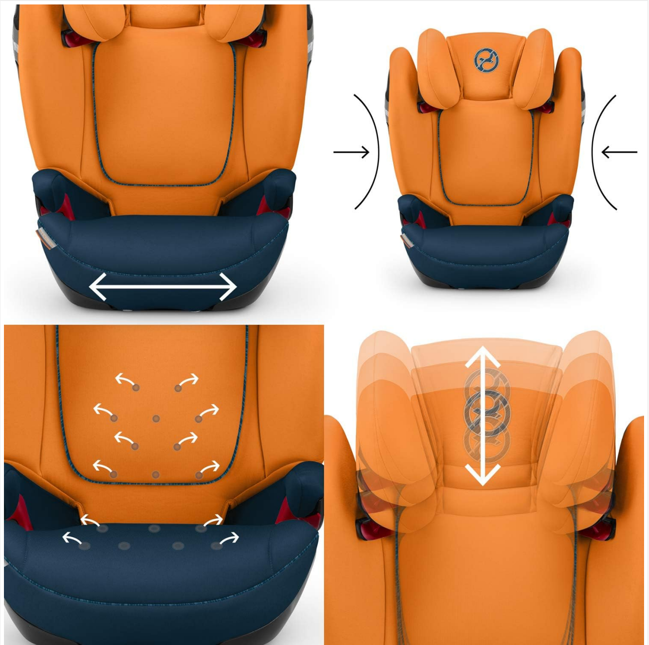
Image: A composite image showing the adjustable width of the seat, the height adjustment of the headrest, and the ventilation points within the car seat for enhanced comfort.