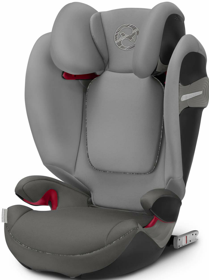
Image: Front view of the Cybex Solution S-Fix car seat, highlighting its ergonomic design and adjustable components.