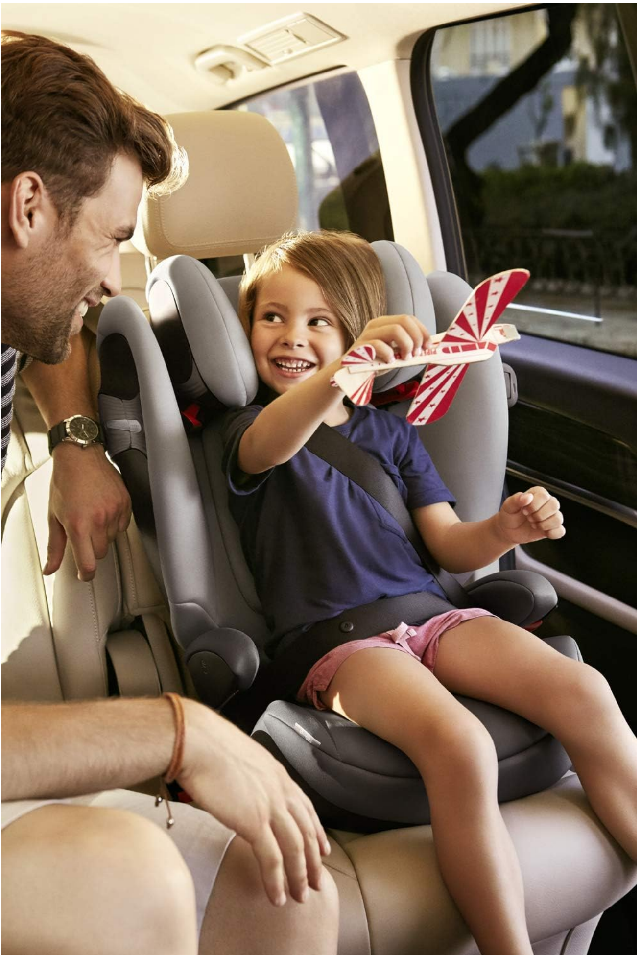
Image: A child sitting comfortably and securely in the Cybex Solution S-Fix car seat, demonstrating the spacious and ergonomic design.