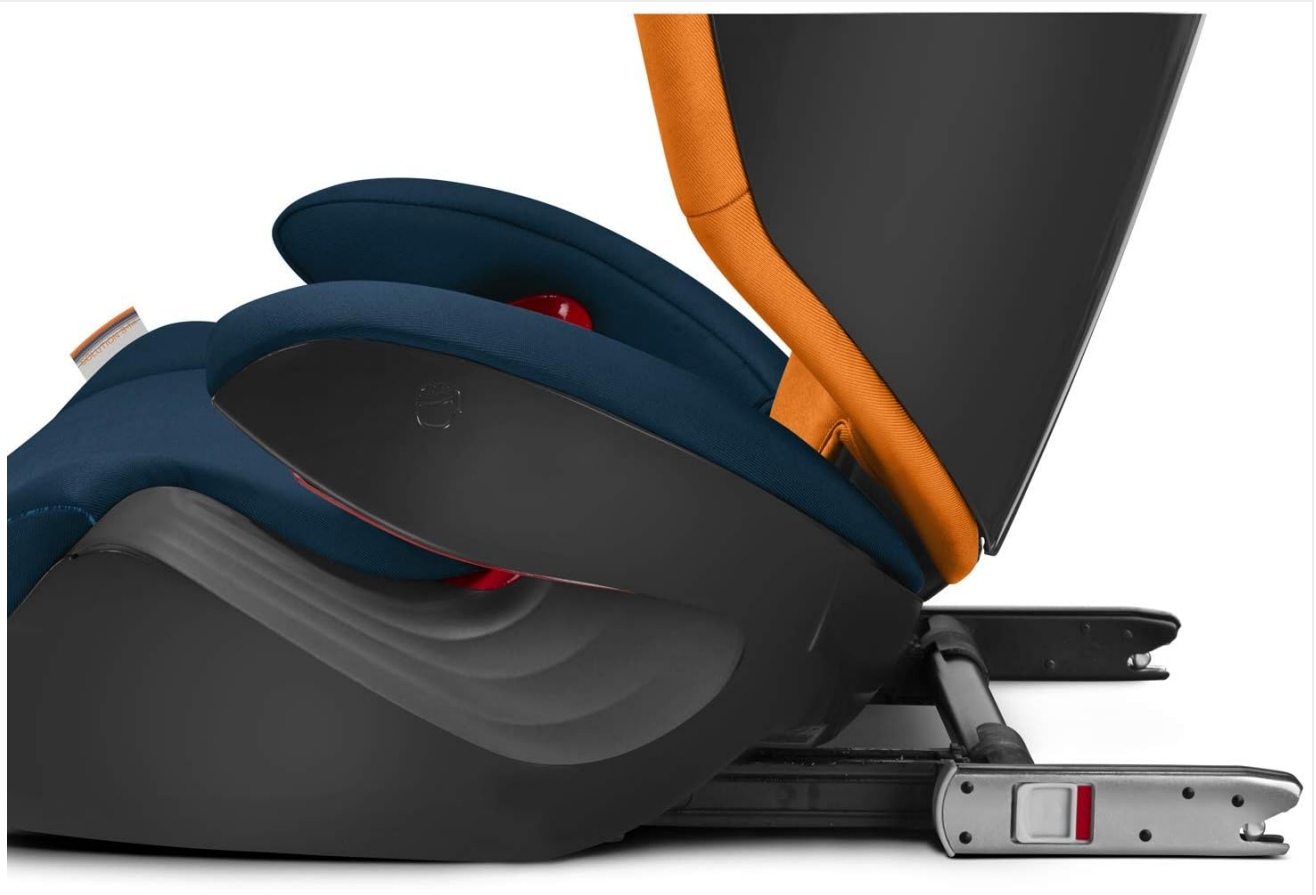
Image: Side view of the Cybex Solution S-Fix car seat illustrating the reclining backrest feature, showing how it can be angled for comfort.

The car seat features a reclining backrest that adapts to the angle of the vehicle seat, providing a comfortable and secure position for your child. This helps prevent the child's head from falling forward when sleeping.