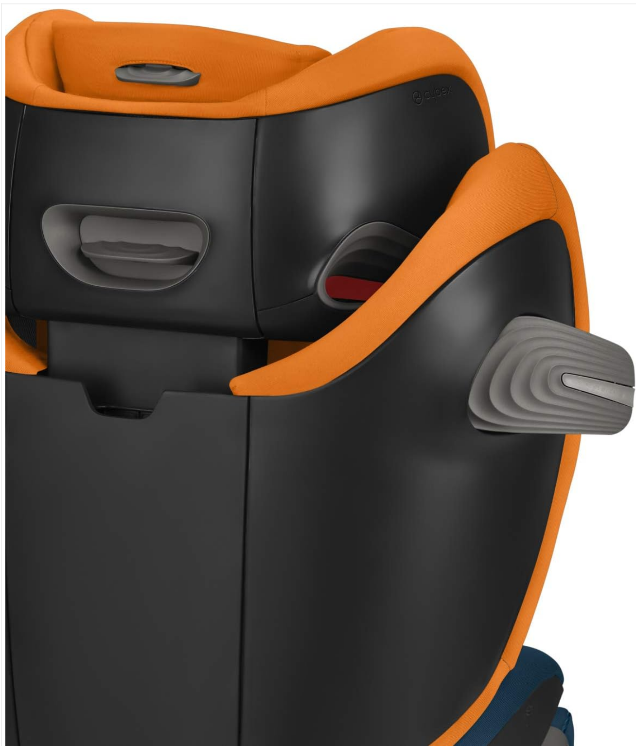
Image: Close-up of the headrest adjustment mechanism on the Cybex Solution S-Fix car seat, showing the handle used to raise or lower the headrest.

The headrest can be adjusted to 12 different height positions to perfectly fit your child's height. To adjust, squeeze the adjustment handle at the back of the headrest and slide it up or down. Ensure the headrest is positioned so that the child's shoulders are level with the bottom edge of the headrest.