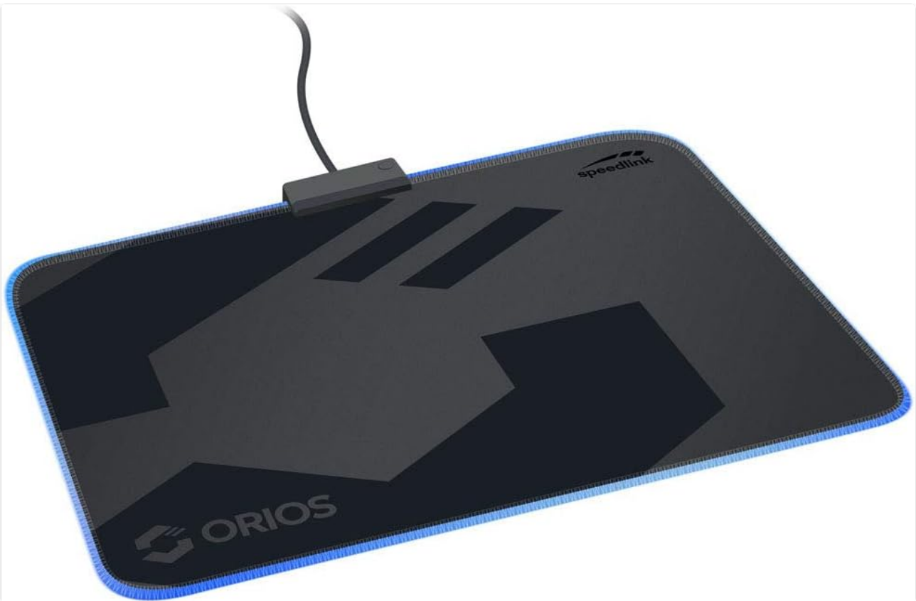
Image: Angled view of the mousepad showcasing its blue LED illumination.