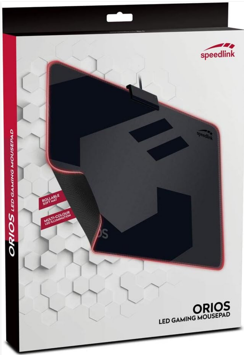
Image: The retail packaging for the Orios LED Gaming Mousepad, showing the product inside.