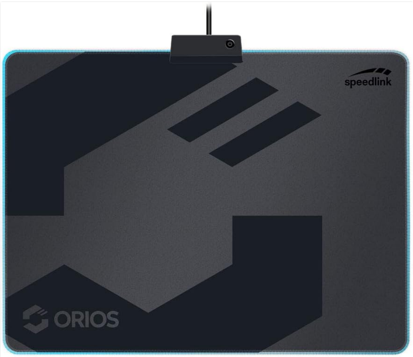
Image: Top-down view of the Orrios LED Gaming Mousepad with its USB cable connected, showing the blue LED illumination.