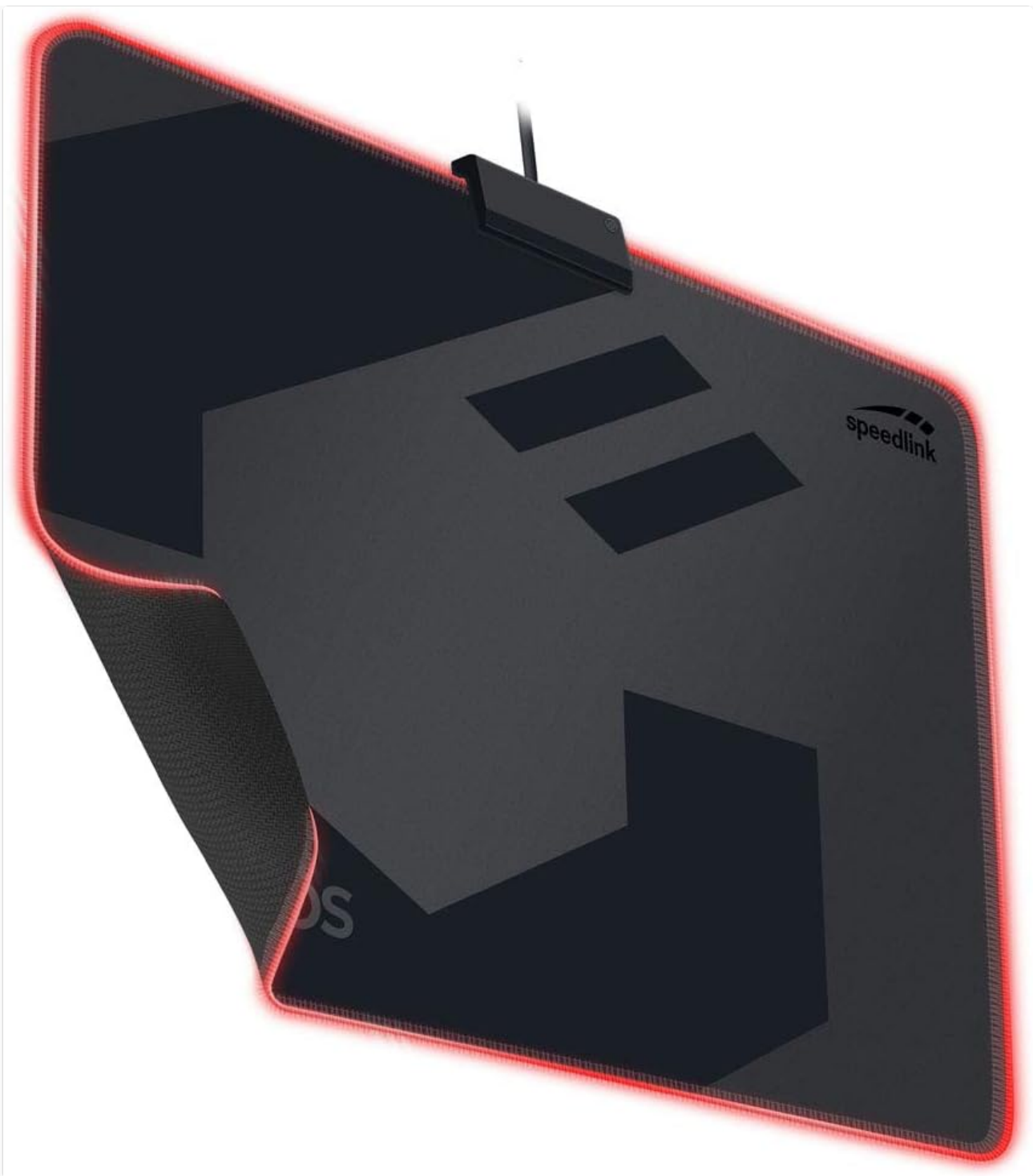
Image: Angled view of the mousepad showcasing its red LED illumination.