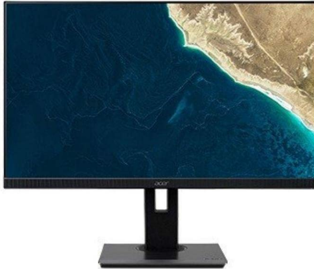
Figure 3.2.1: Acer B247Y Monitor with Stand. This image illustrates the overall appearance of the monitor when fully assembled on its stand.