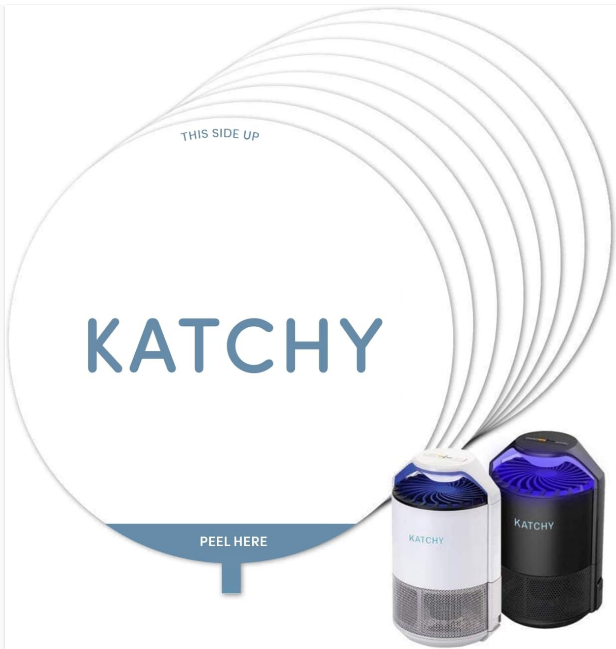
Image 1.1: Katchy Glue Board Refills shown with compatible Katchy Original and Midnight insect traps. These circular glue boards are designed to fit perfectly within the base of the specified Katchy devices.