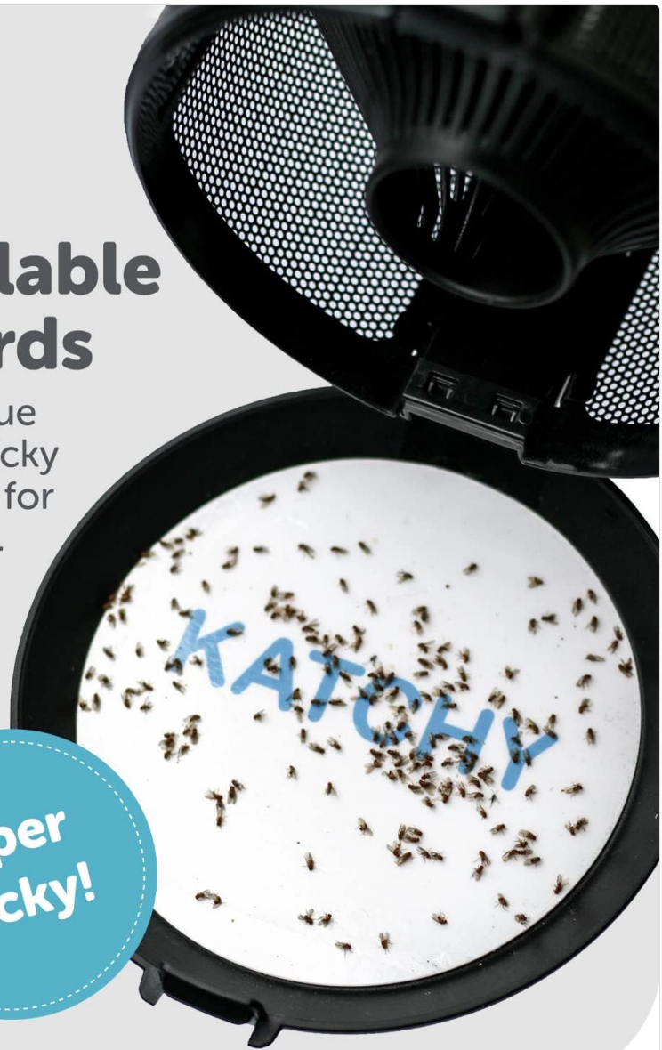
Image 3.1: A Katchy glue board after use, showing numerous small insects trapped on its sticky surface, demonstrating its effectiveness.