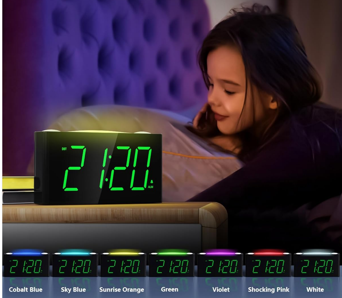
Figure 5: The 7-color night light feature.

Video 1: Demonstration of the 7-color night light and large LED display.