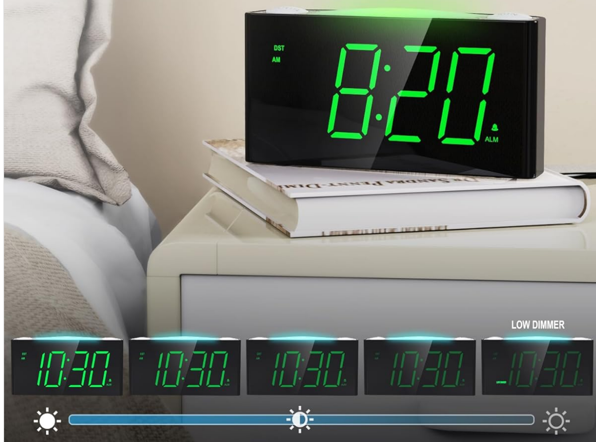
Figure 6: Adjusting the 5-level display dimmer.

Video 2: Overview of clock features, including dimmer and USB ports.