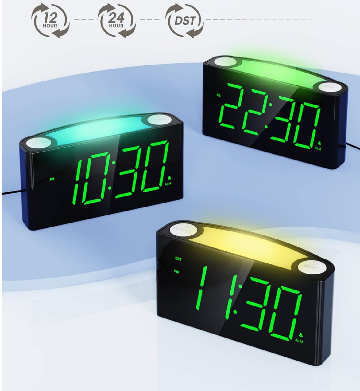
Figure 2: Switching between 12H and 24H time formats.