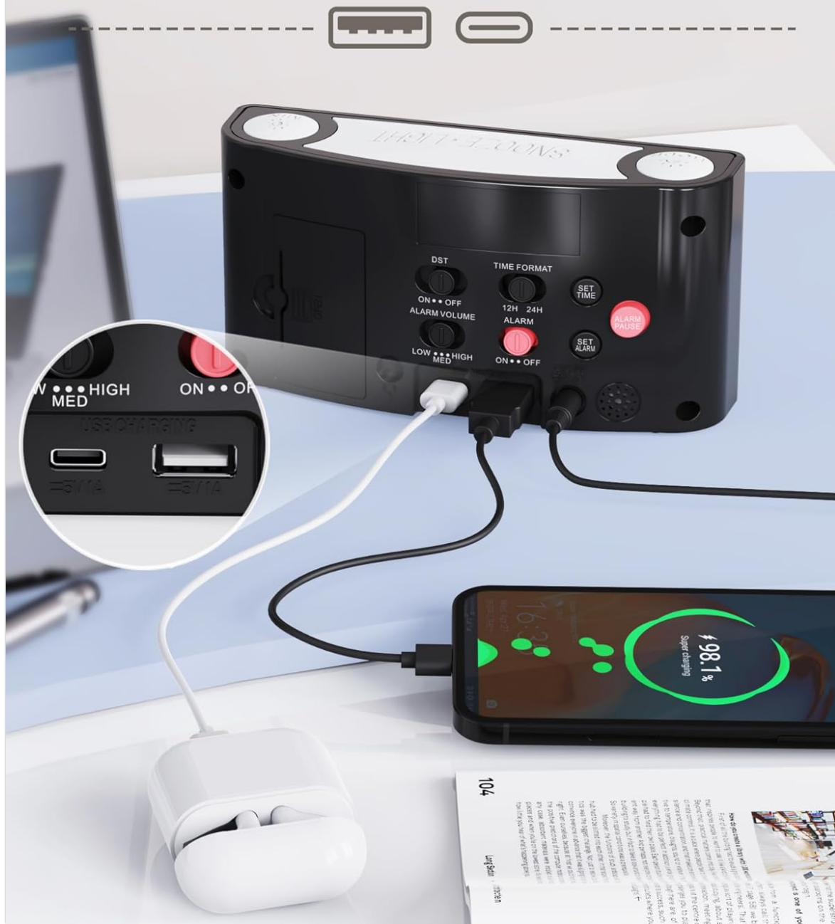
Figure 7: USB and Type-C charging ports.