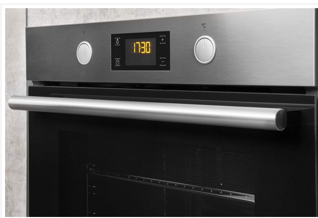
Figure 2.2: Close-up of the control panel with rotary knobs and digital display.