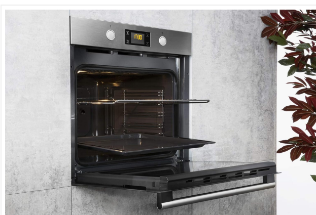
Figure 2.3: Oven interior with door open, showing rack and tray.