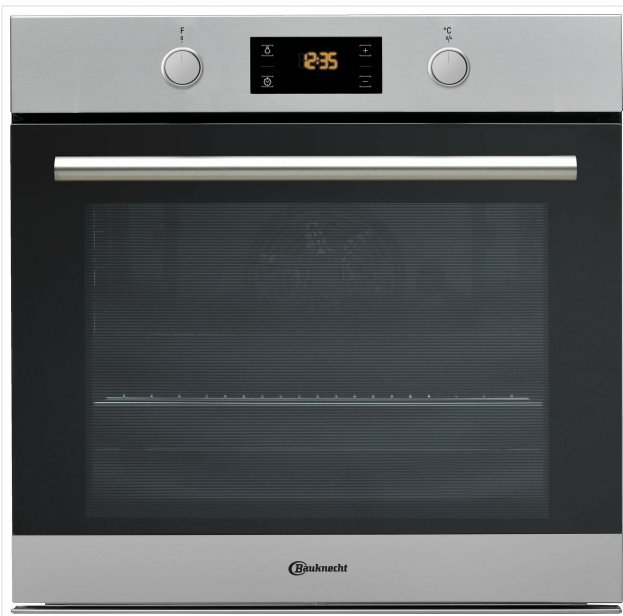
Figure 2.1: Front view of the Bauknecht BAR2 KP8V2 IN electric built-in oven.