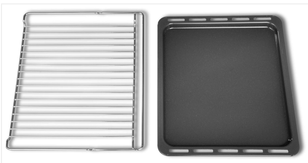
Figure 2.4: Standard wire oven rack and baking tray.