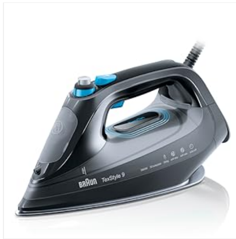
Figure 1: Key features of the TexStyle 9 iron, including the ElloxalPlus soleplate, FreeGlide 3D technology, precision tip, and anti-drip system.