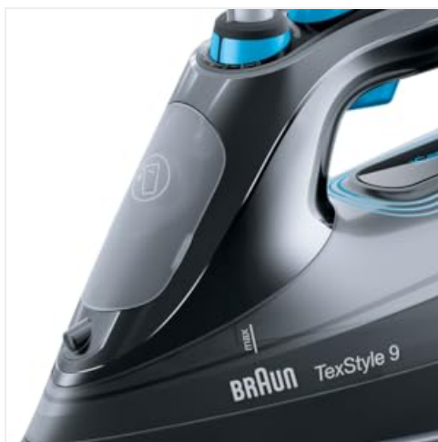
Figure 3: Smart iCare Technology ensures safe temperatures for all fabrics.