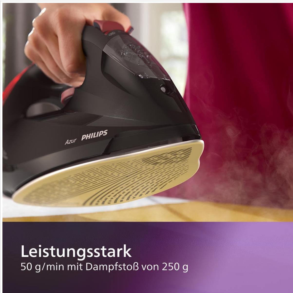
Figure 3.3: The iron in action, demonstrating the powerful steam output during use.