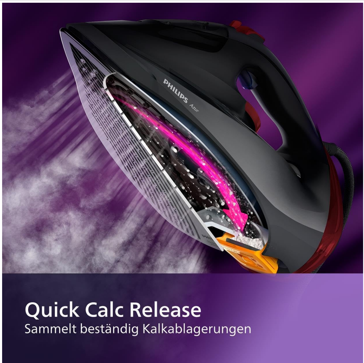
Figure 3.4: An internal view of the iron, illustrating the steam generation and the integrated Quick Calc Release system.