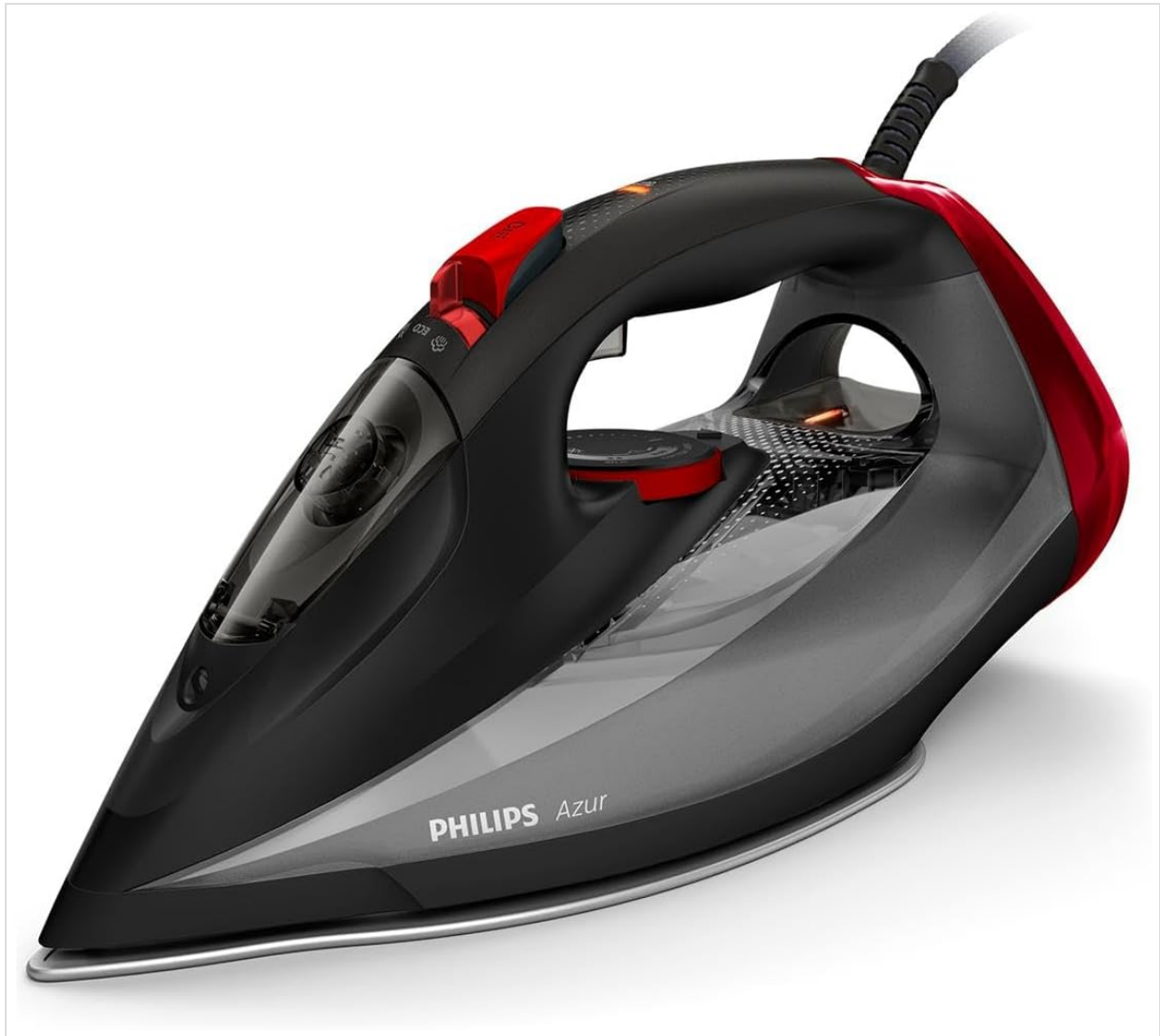
Figure 3.1: Front view of the Philips Azur Steam Iron GC4567/80, showcasing its sleek black and red design.

The Philips Azur Steam Iron GC4567/80 is engineered for powerful and efficient ironing. Below are its key components and features: