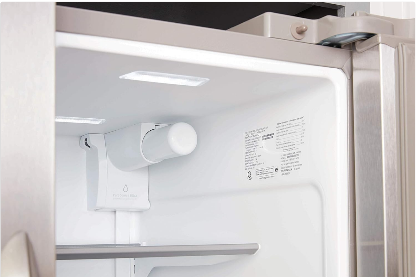
Image: PureSource Ultra water filter installed in the refrigerator.