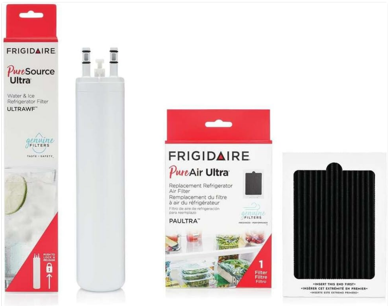
Image: Frigidaire Water and Air Filter Combo Pack, featuring both the water and air filters.