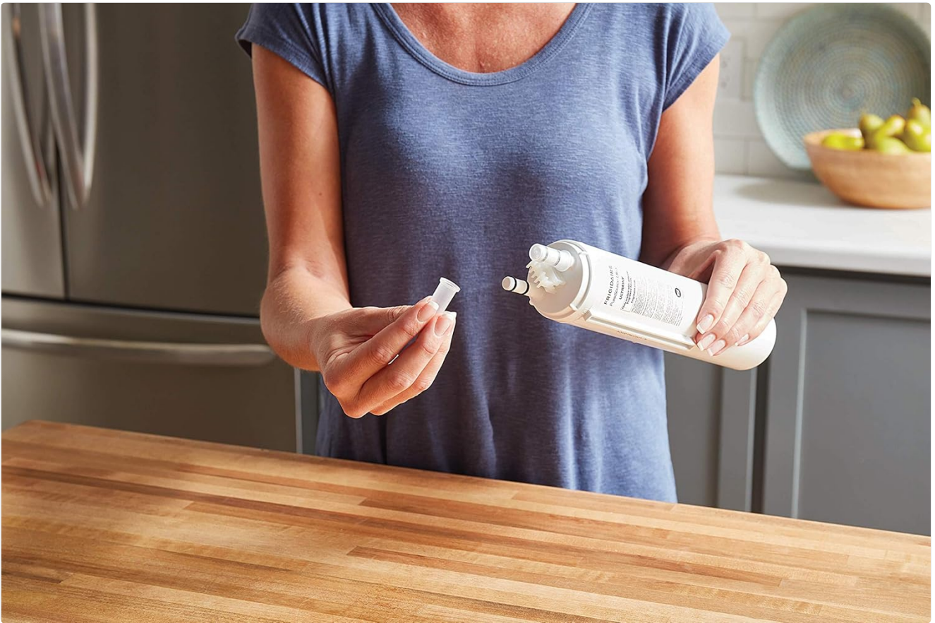
Image: Preparing the PureSource Ultra water filter for installation.