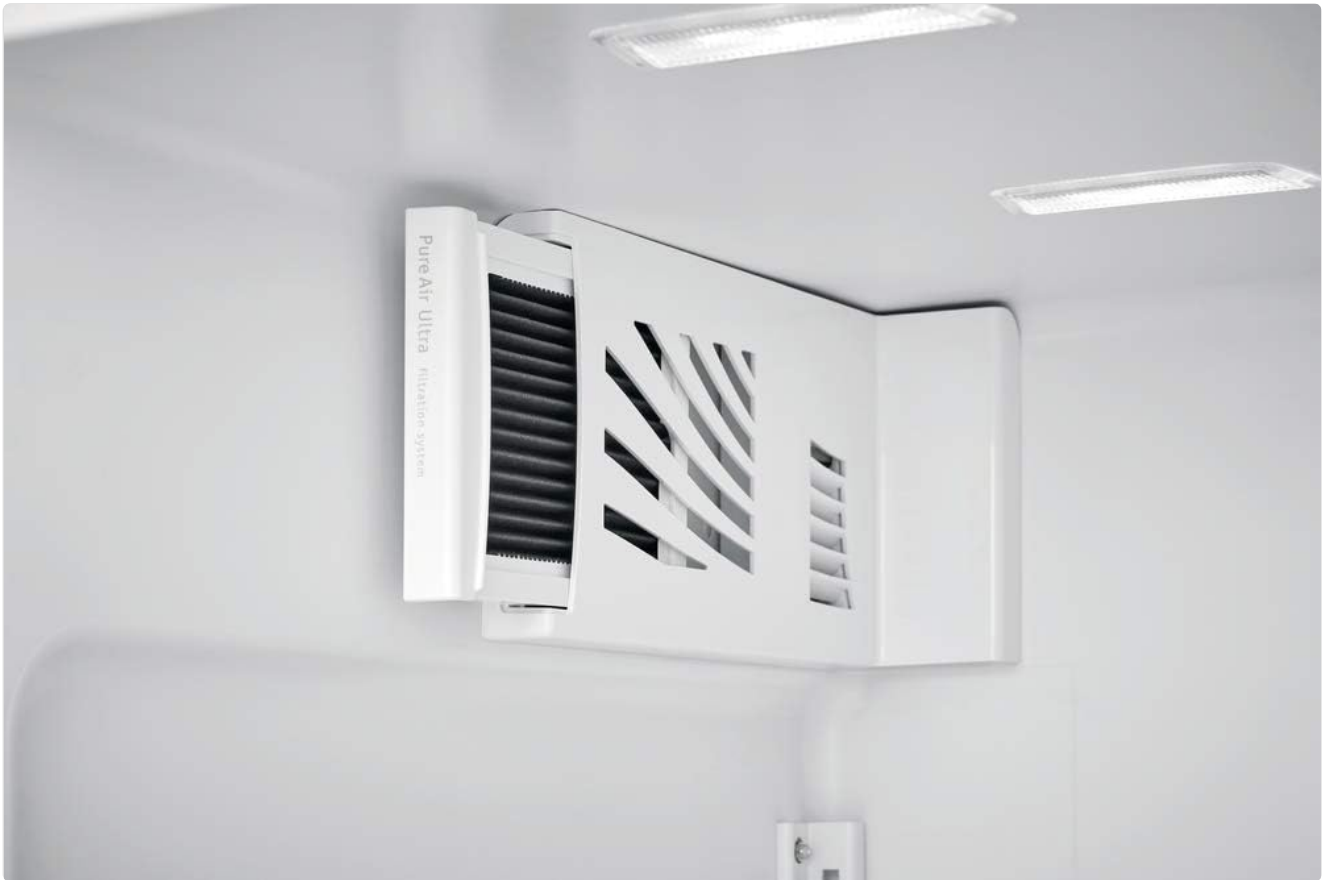
Image: PureAir Ultra air filter installed in the refrigerator.