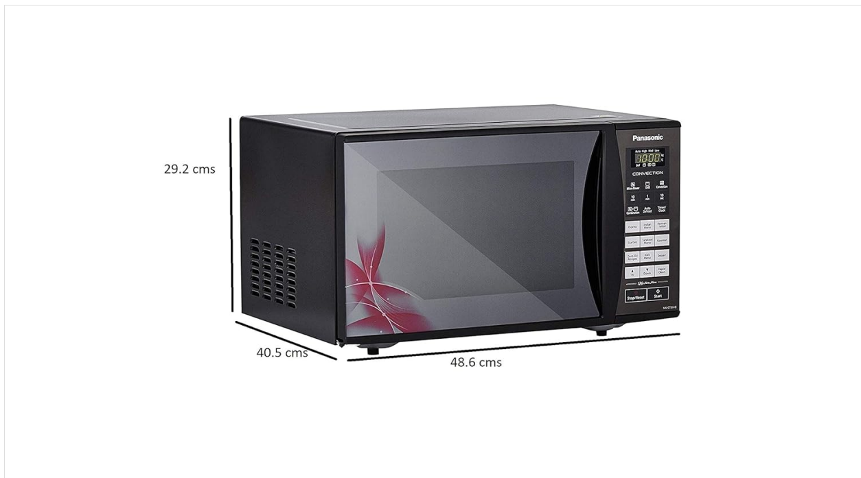
Image: Detailed view of the control panel, featuring a digital display, buttons for Micro Power, Grill, Convection, Combination, Auto Defrost, Timer/Clock, and various auto-cook menus like Indian Menu, Zero Oil Recipes, and Vapor Clean.