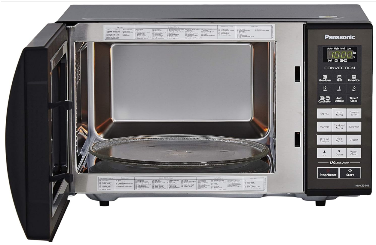
Image: Interior view of the Panasonic microwave oven with the door open, revealing the glass turntable and internal cavity. The control panel is visible on the right.