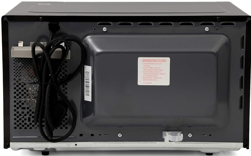
Image: Rear view of the microwave oven, displaying a high voltage warning label and power cord.