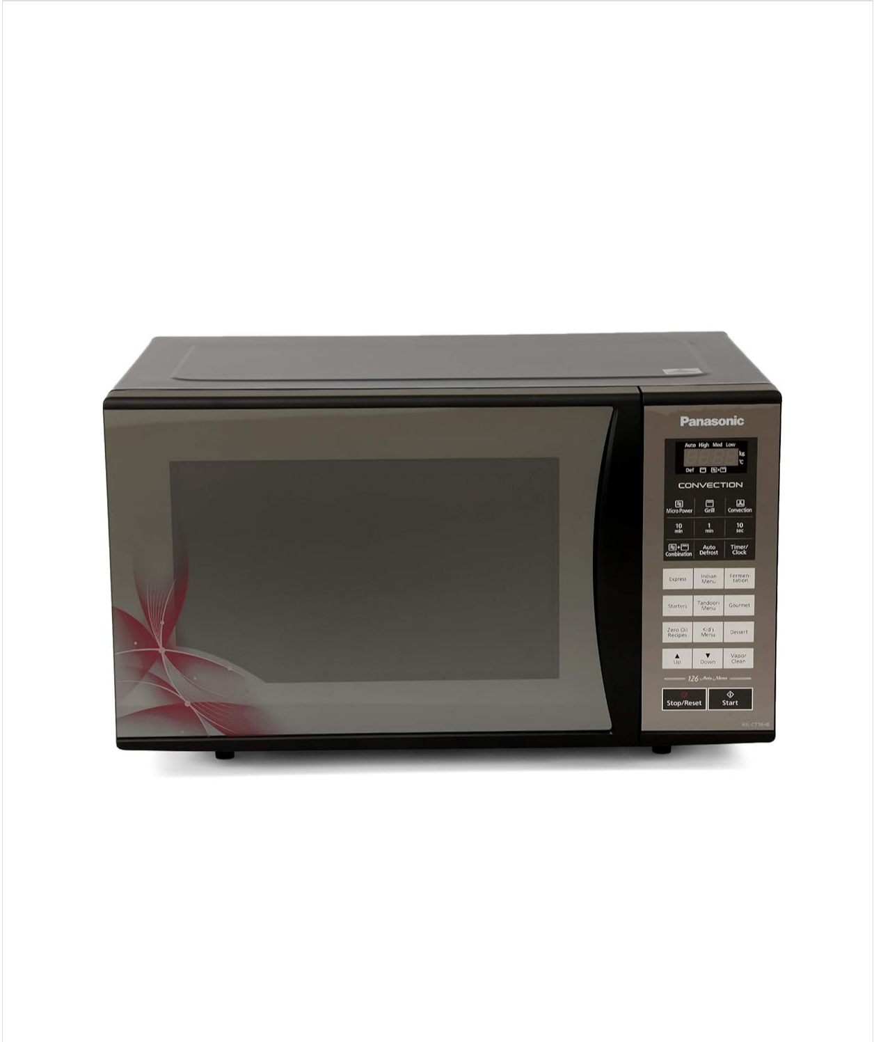
Image: Front view of the Panasonic 23L Convection Microwave Oven in black, featuring a dark glass door with a floral design and a control panel on the right.