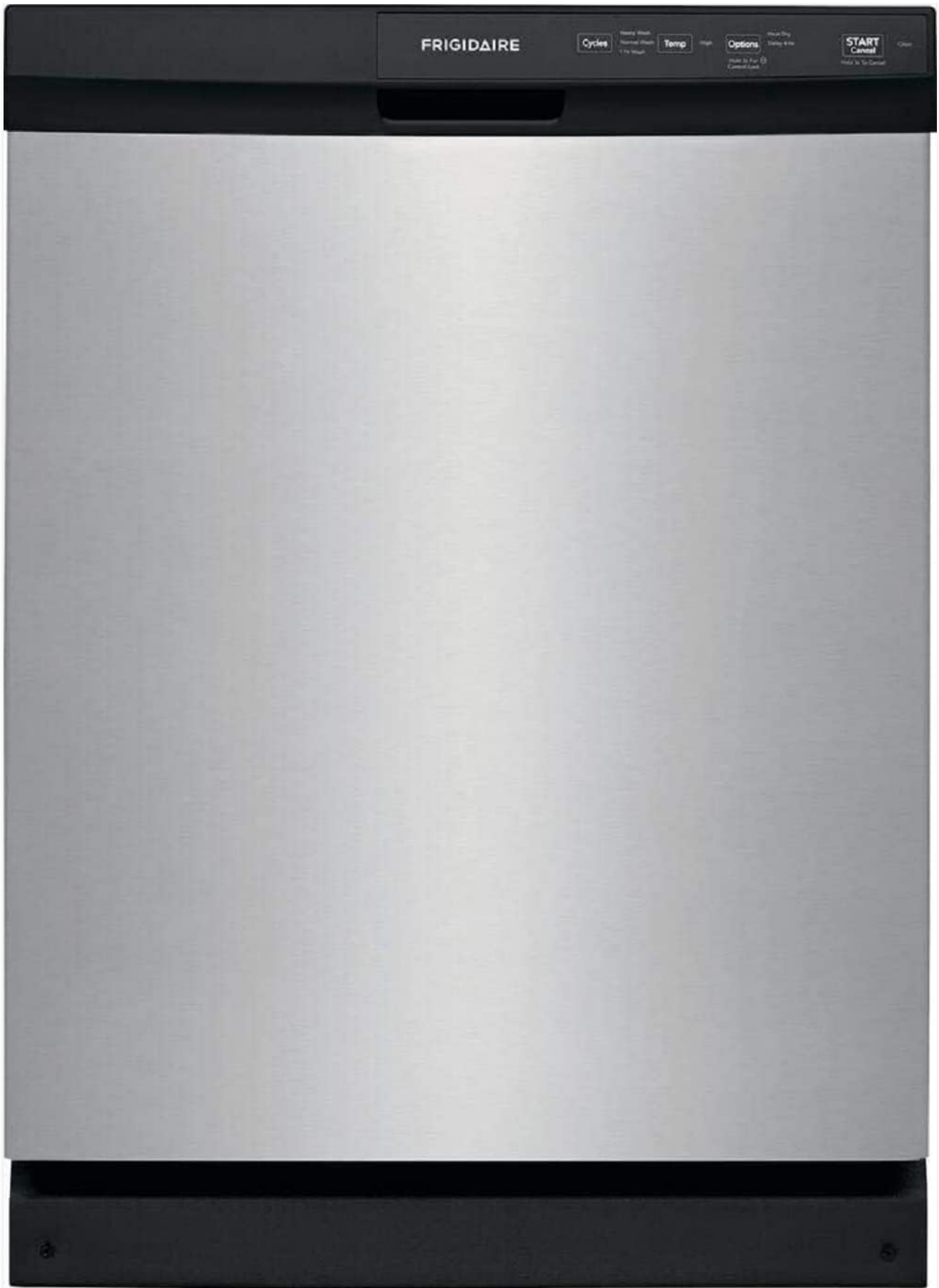
Front view of the Frigidaire FFCD2413US 24-inch Built-in Dishwasher in Stainless Steel. This image shows the sleek stainless steel exterior and the top-mounted control panel.