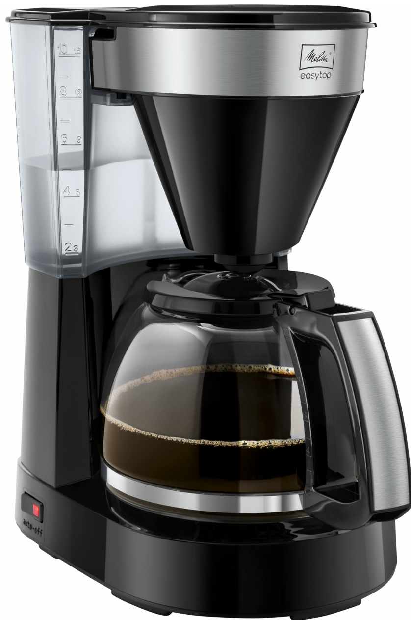
Image 1.1: Melitta Easy Top 1023-04 Filter Coffee Machine in operation.