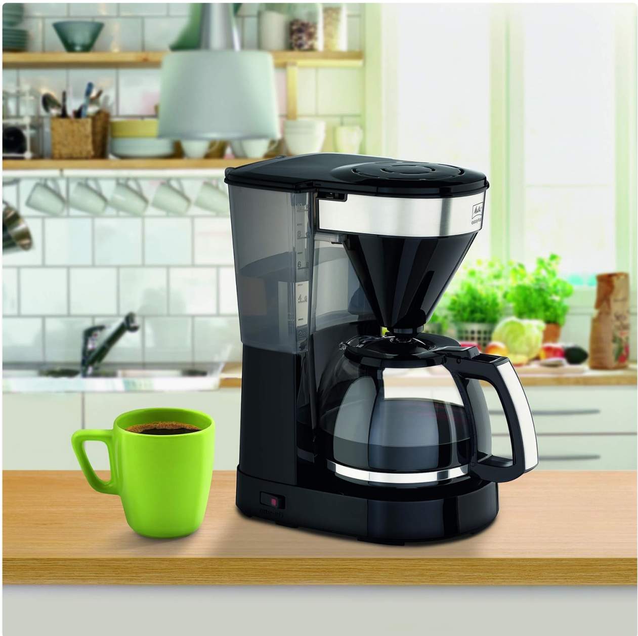
Image 5.1: Melitta Easy Top 1023-04 in a kitchen setting, ready for use.