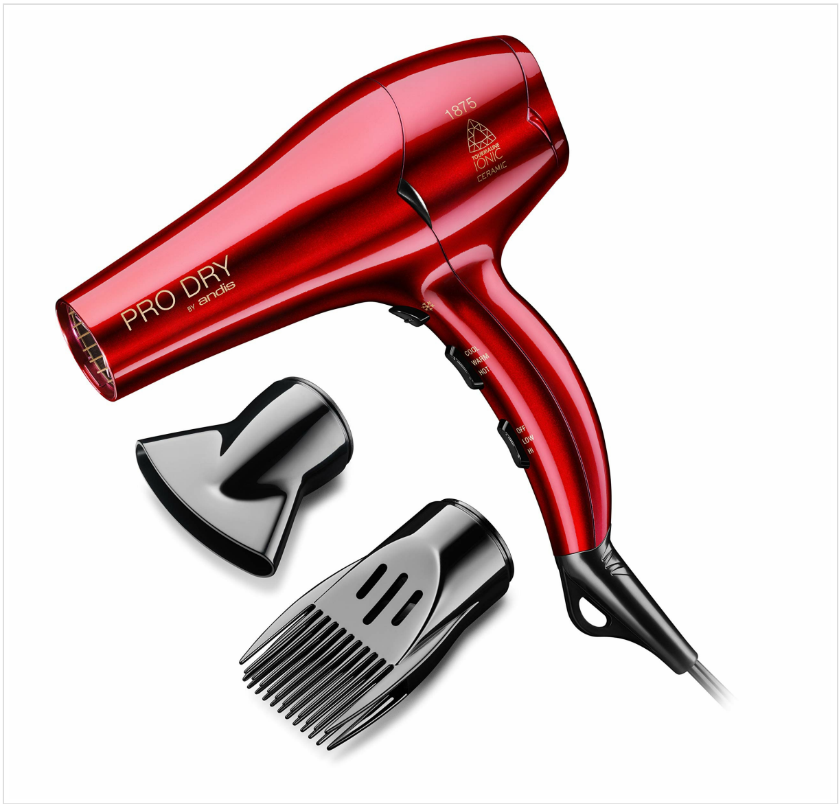
Image: The Andis 30245 1875W Tourmaline Ceramic Ionic Pro Dry Professional Hair Dryer in its red finish, showcasing its sleek design.