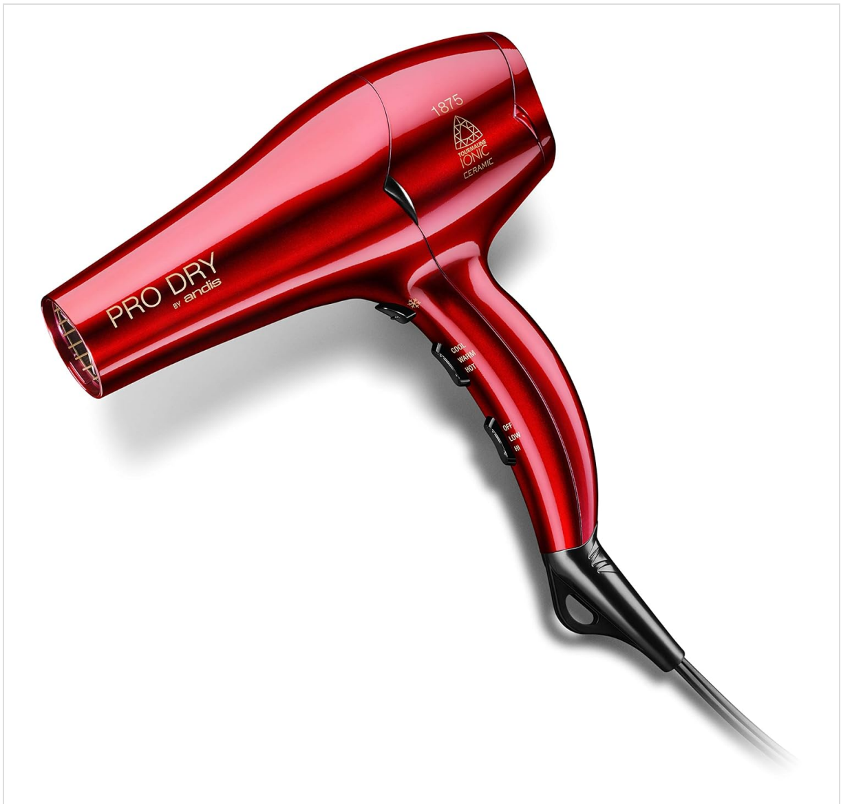
Image: A close-up view of the Andis 30245 hair dryer, highlighting the control switches for speed (OFF, LOW, HI) and heat (COOL, WARM, HOT), along with the separate cool shot button.